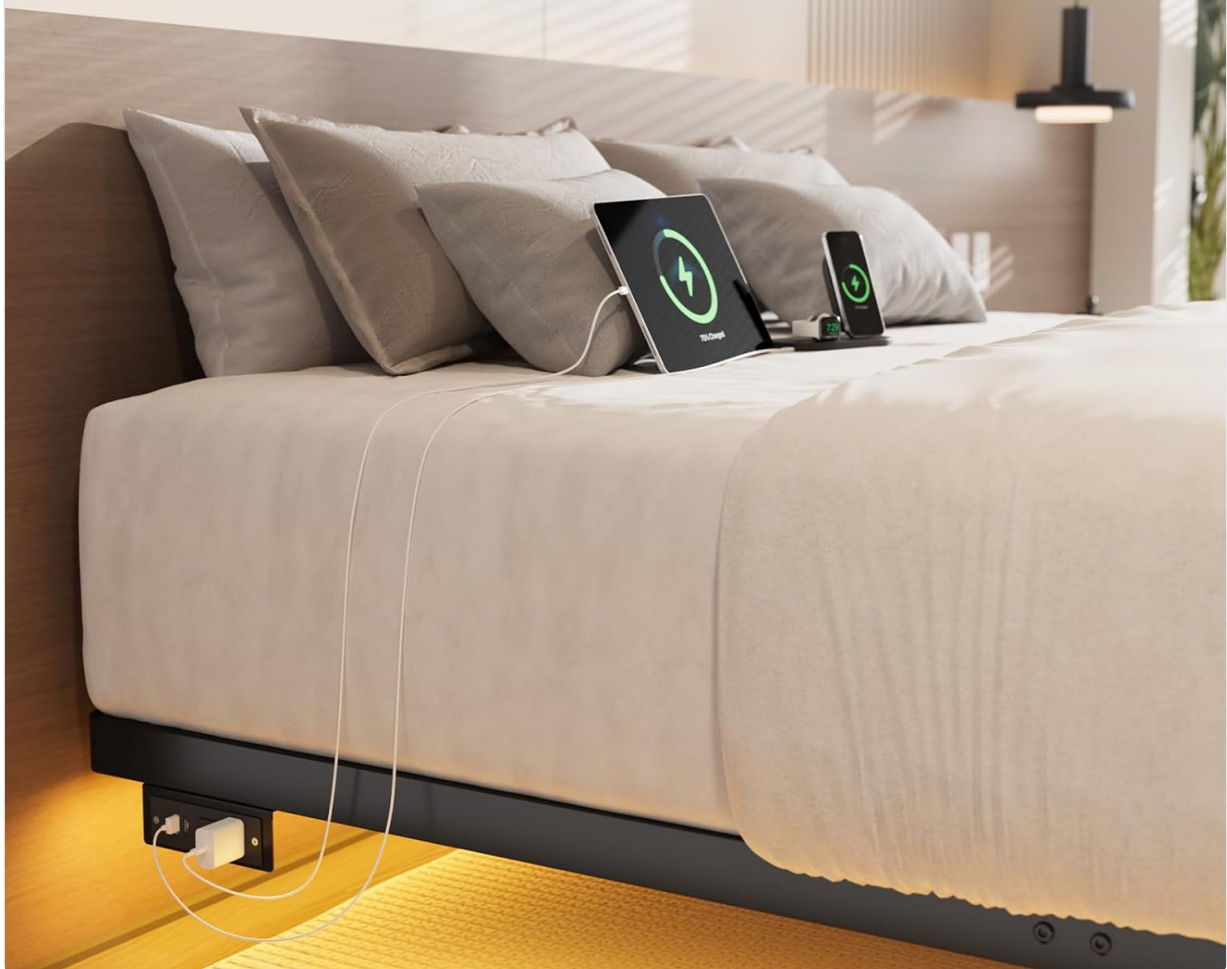
Image 5.3: Detailed view of the built-in charging station, featuring two AC outlets, one USB port, and one Type-C port for convenient device charging.