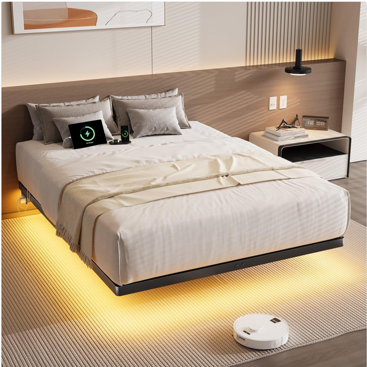
Image 1.1: The ONBRILL Floating Bed Frame with integrated LED lighting, showcasing its modern design and under-bed illumination.