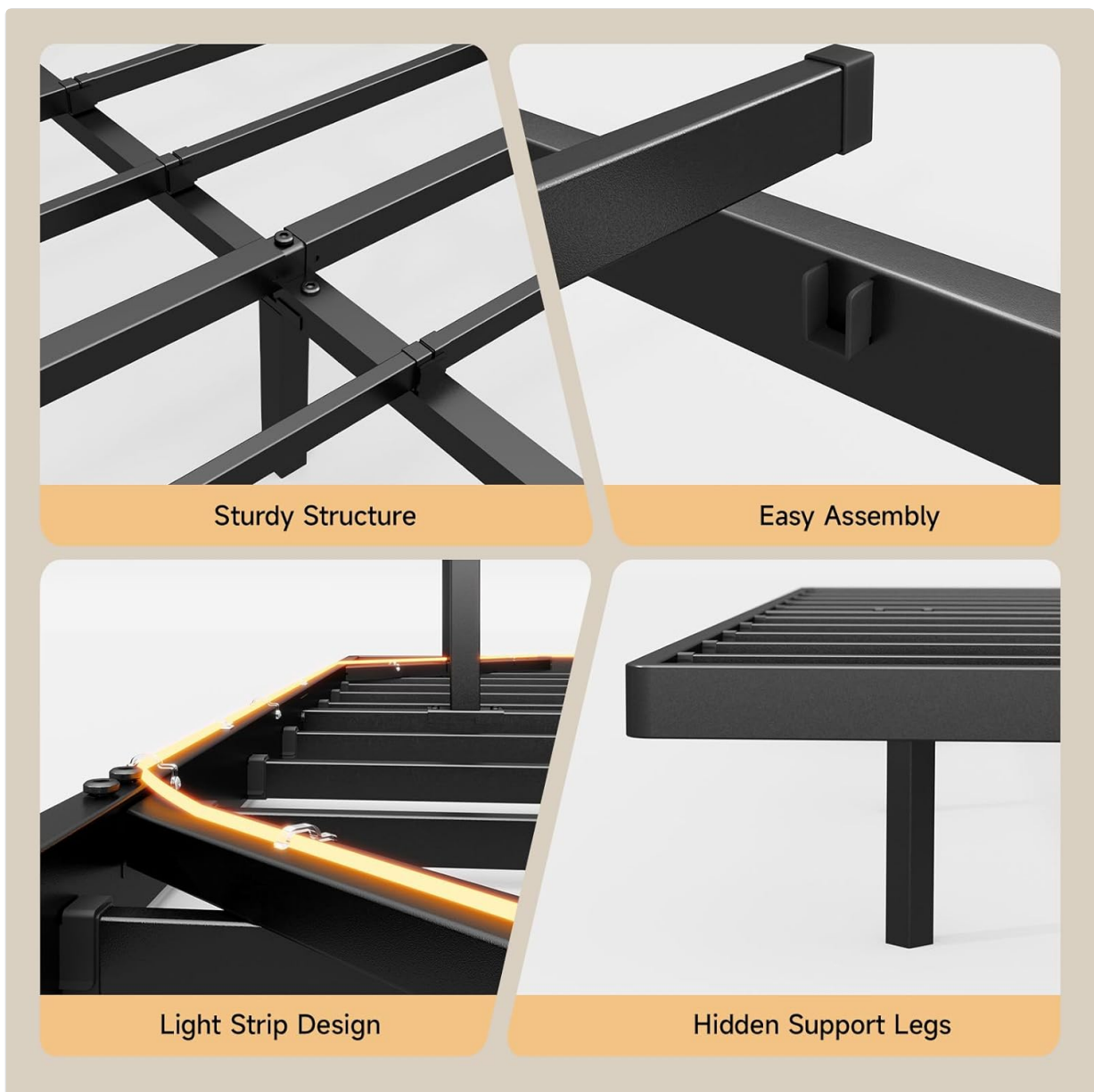
Image 4.1: Visual representation of the bed frame's sturdy structure, ease of assembly, integrated light strip design, and hidden support legs.