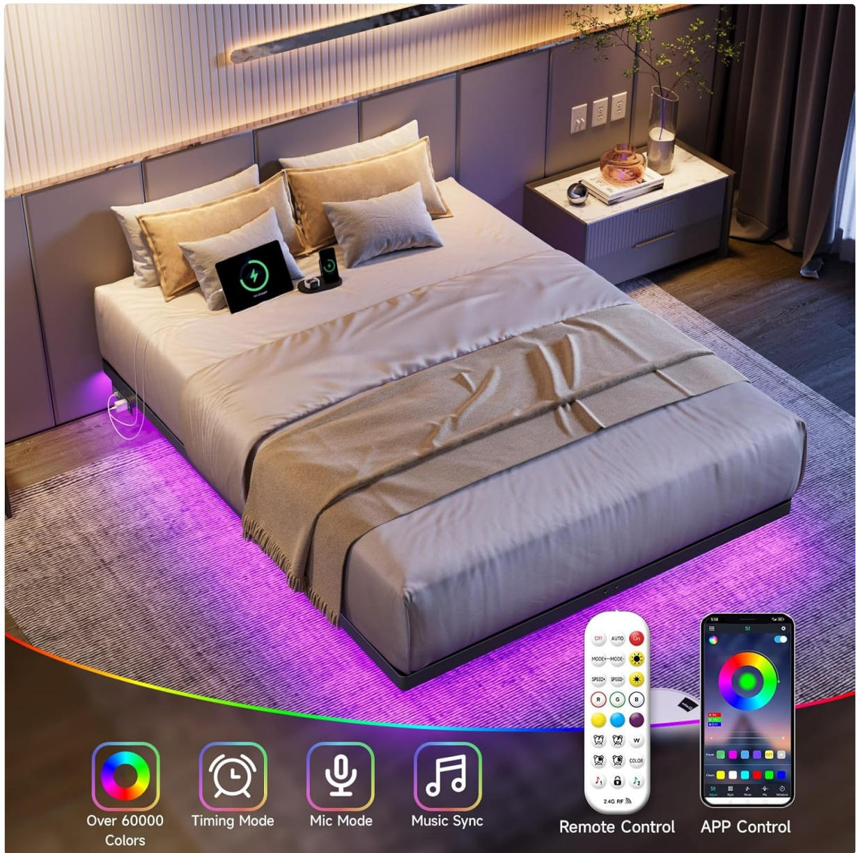
Image 5.1: The bed frame's LED lighting system, illustrating control options via remote and smartphone application, with features like color selection, timing, and music synchronization.