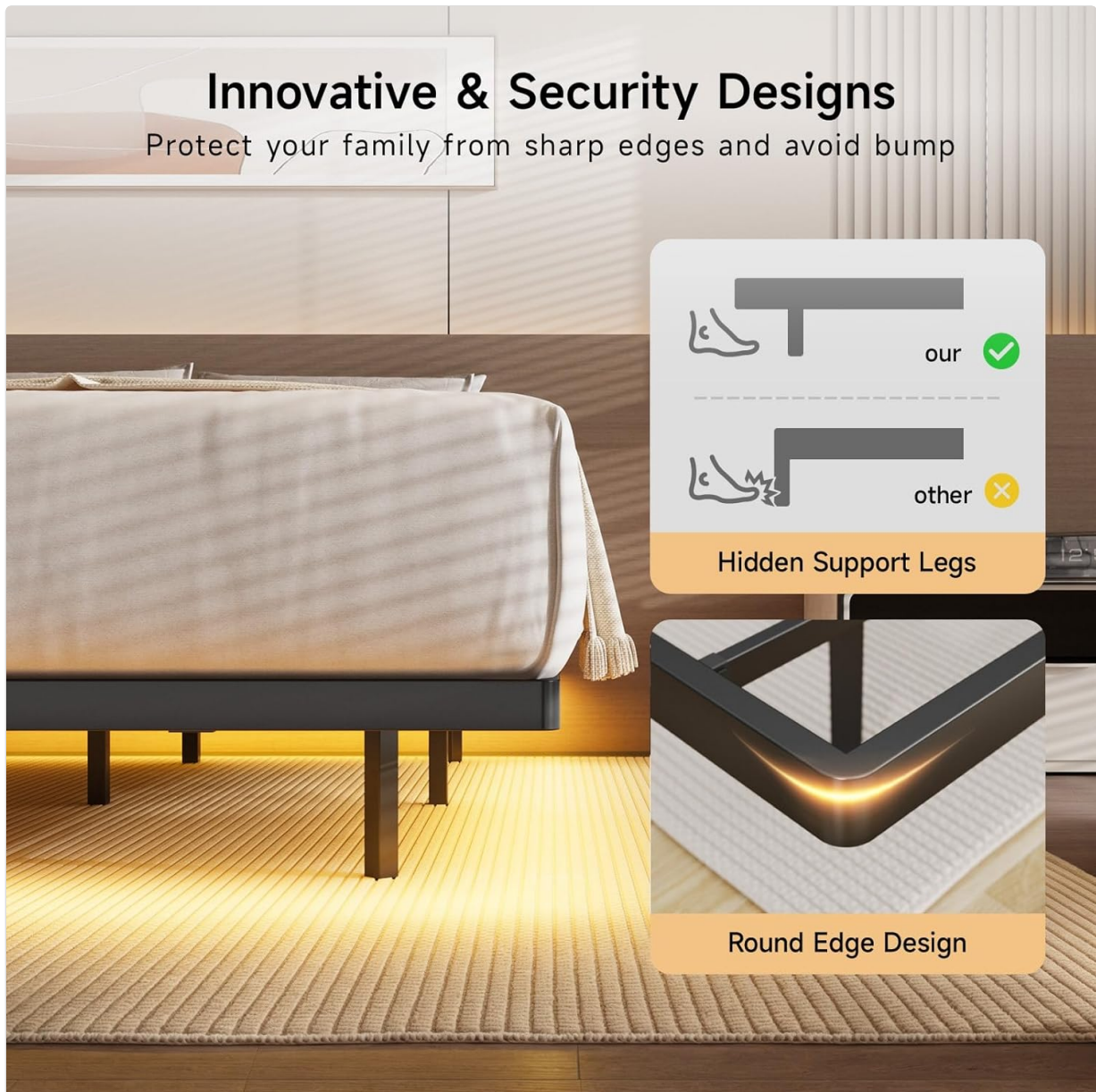
Image 2.1: Illustration of the bed frame's innovative hidden support legs and rounded edge design, contributing to safety and aesthetics.