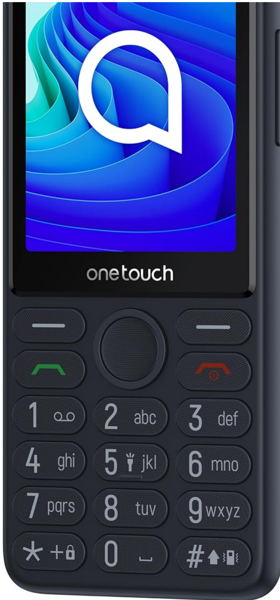
Front View: Shows the 2.8-inch display, large numeric keypad, and navigation buttons.