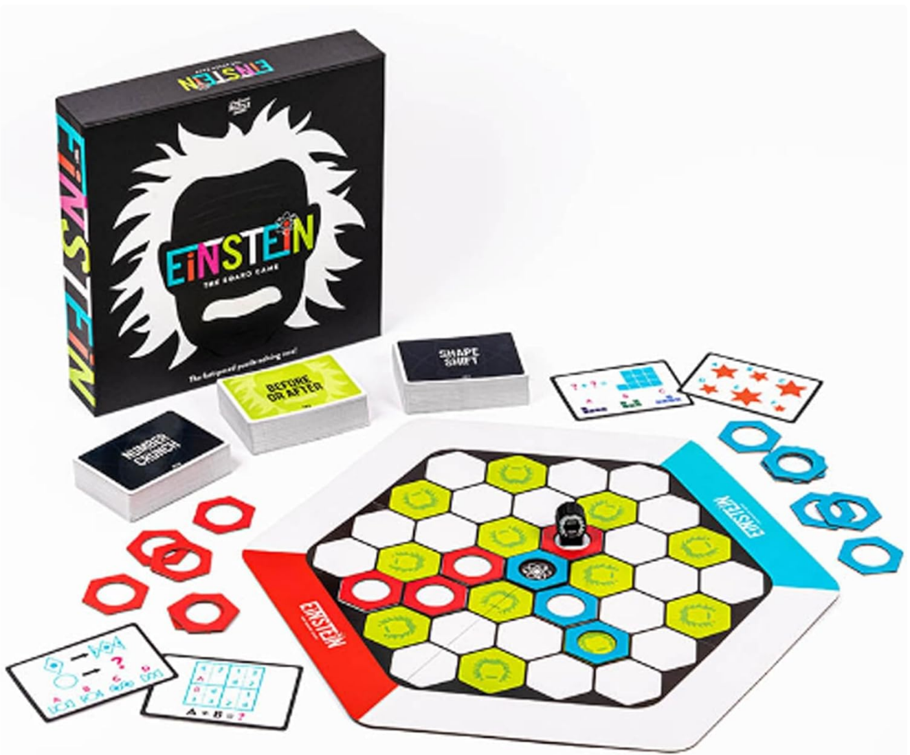
The game board with the Einstein token in the center, surrounded by various puzzle cards and game pieces, illustrating the initial setup.