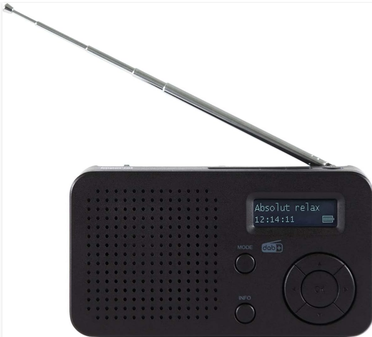
Image: The IMPERIAL DABMAN 17 portable radio with its telescopic antenna extended, displaying station information on its LCD screen.