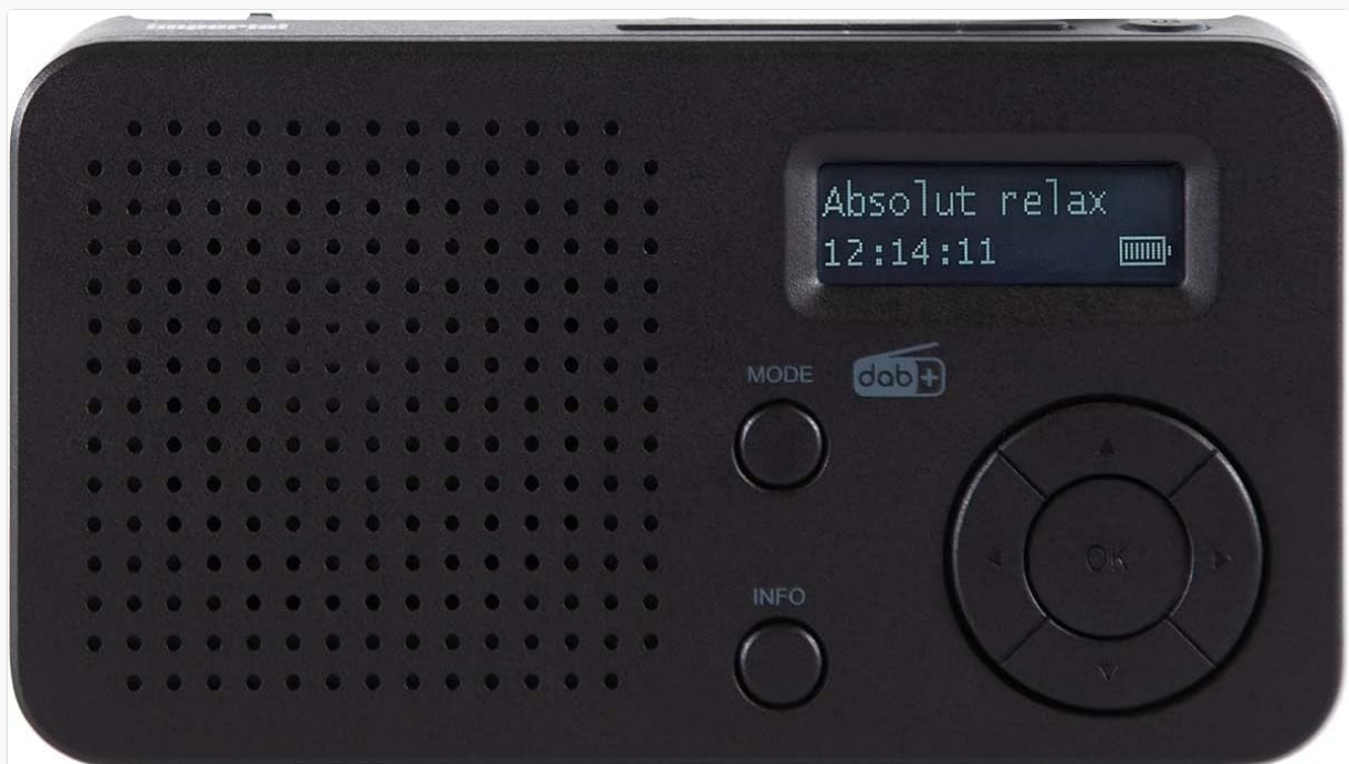
Image: Front view of the IMPERIAL DABMAN 17 radio, displaying the speaker grille, LCD screen, and control buttons (MODE, INFO, OK, navigation).