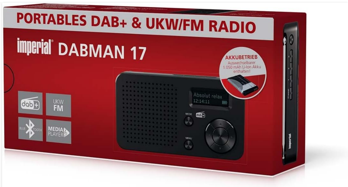
Image: The product packaging for the IMPERIAL DABMAN 17, illustrating the radio, its key features, and included accessories.