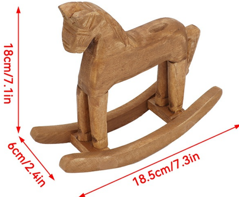
Image: Detailed breakdown of product features, showing high-quality materials, exquisite craftsmanship, and stable design.

Your browser does not support the video tag.