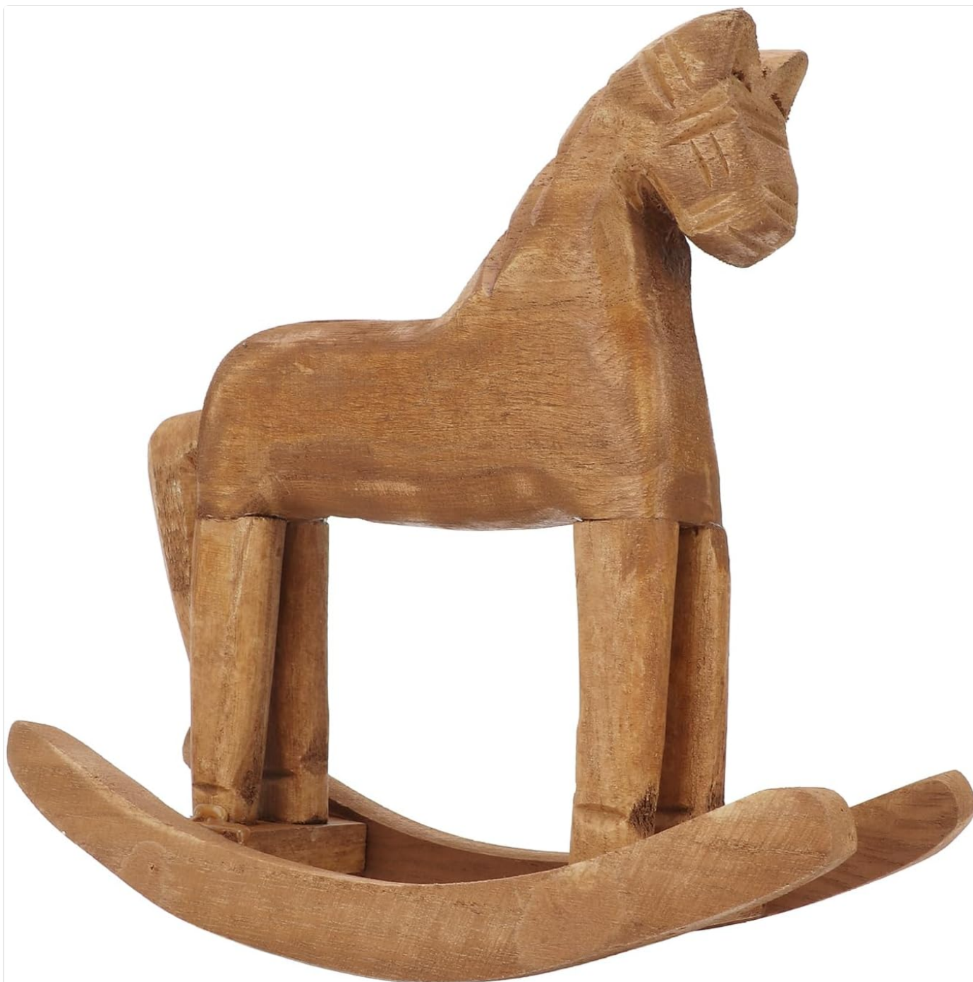
Image: Front view of the Jwthee Mini Wooden Rocking Horse Figurine.