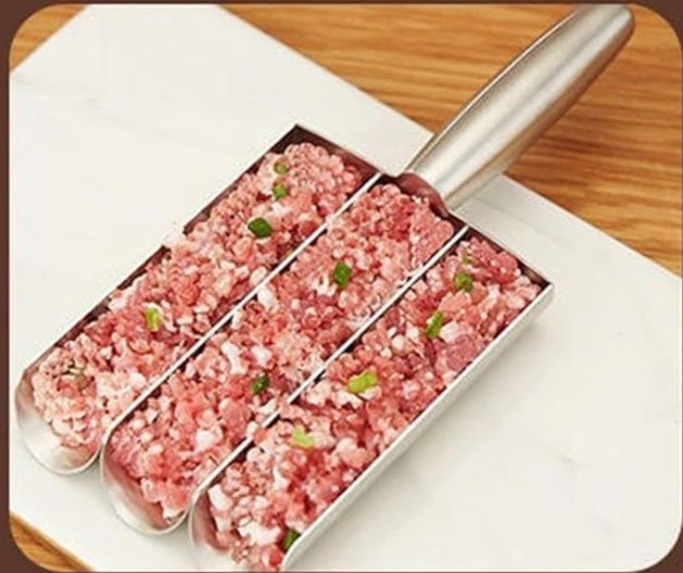
Fill the meat trough and put the minced meat on the meat trough and smooth it out