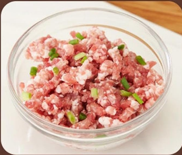
Prepare the minced meat according to your preference

Follow these steps to efficiently create uniform meatballs: