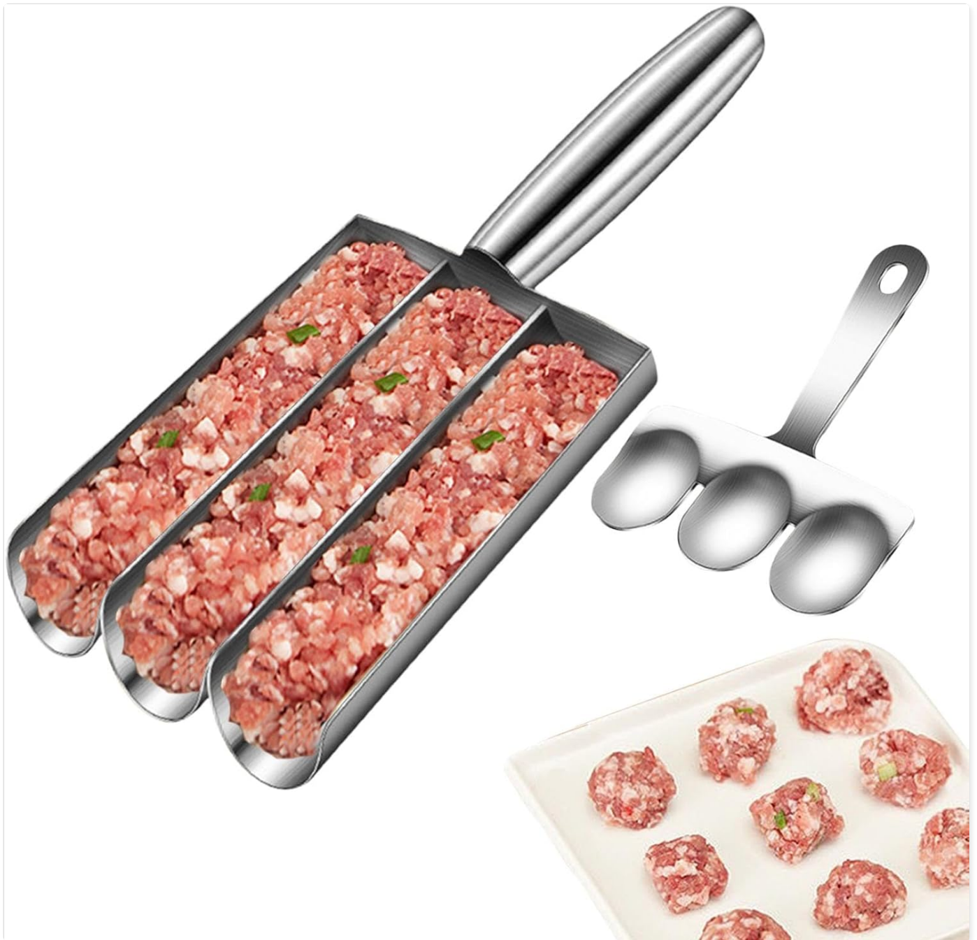
Image: The 3-Row Meatball Maker filled with minced meat, alongside the scooper and a plate of freshly formed meatballs, demonstrating its primary function.