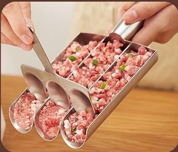
Meatball Forming Use a spoon to form the meatballs!