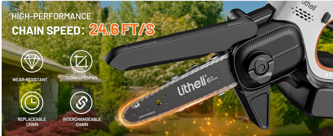
Image: Key safety features of the Litheli Mini Chainsaw, including the anti-flying splash guard, durable steel chain, double safety lock, and the 50ml oil tank for lubrication.