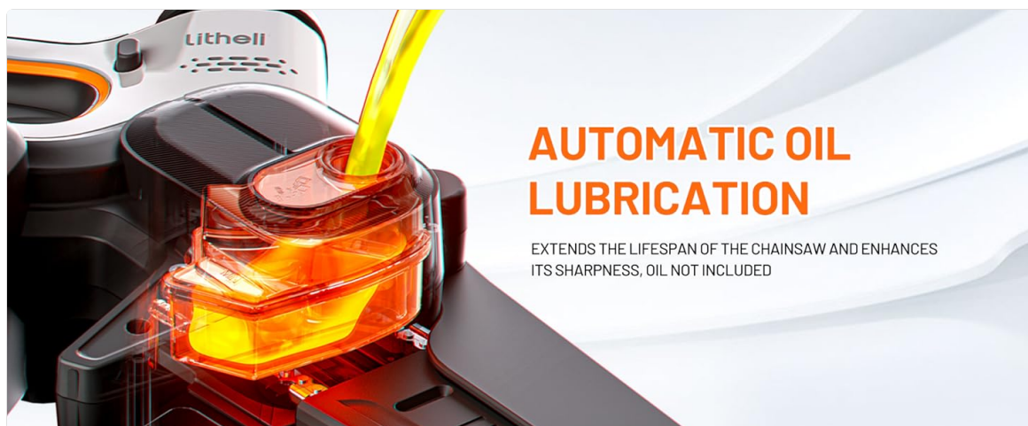
Image: A detailed view of the 50ml oil tank and its oil control window, illustrating the automatic oiling system.