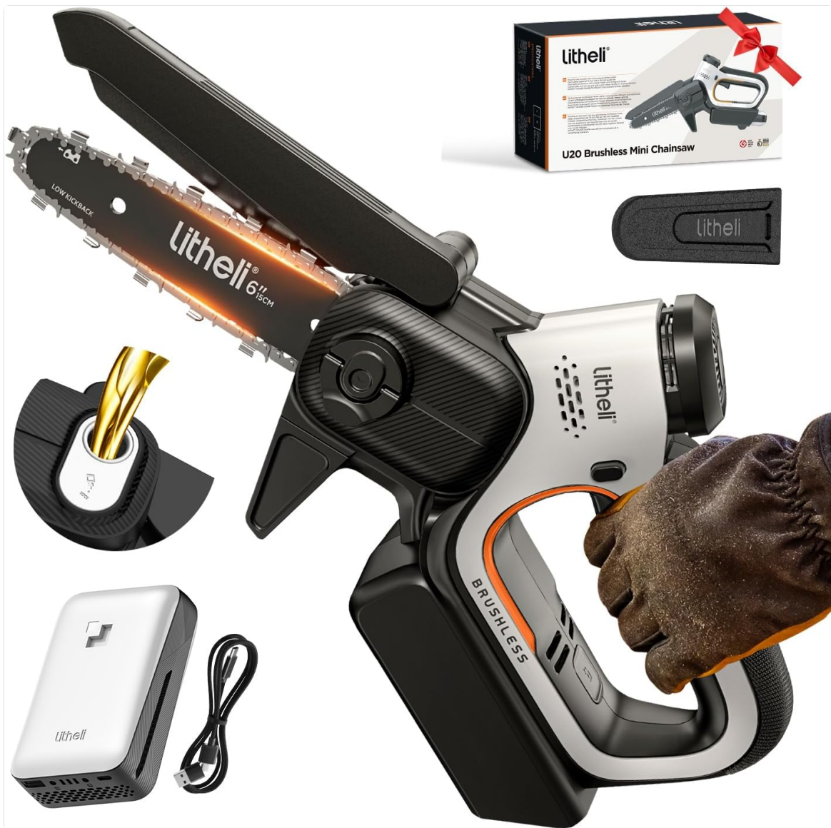
Image: The Litheli 20V 6-inch brushless mini chainsaw, shown with its included 2.0Ah battery, charging cable, and chain guard.