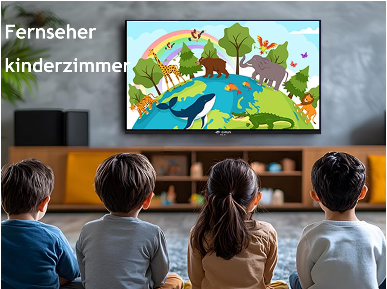
Image: The CRUA Smart TV in a child's room, displaying animated content, suitable for various family settings.

Your CRUA Smart TV runs on Android 11, providing access to the Google Play Store and a wide array of streaming services and applications. Popular apps like Prime Video, Netflix, YouTube, DAZN, and Twitch are readily available. Note that some streaming services may require separate subscriptions.