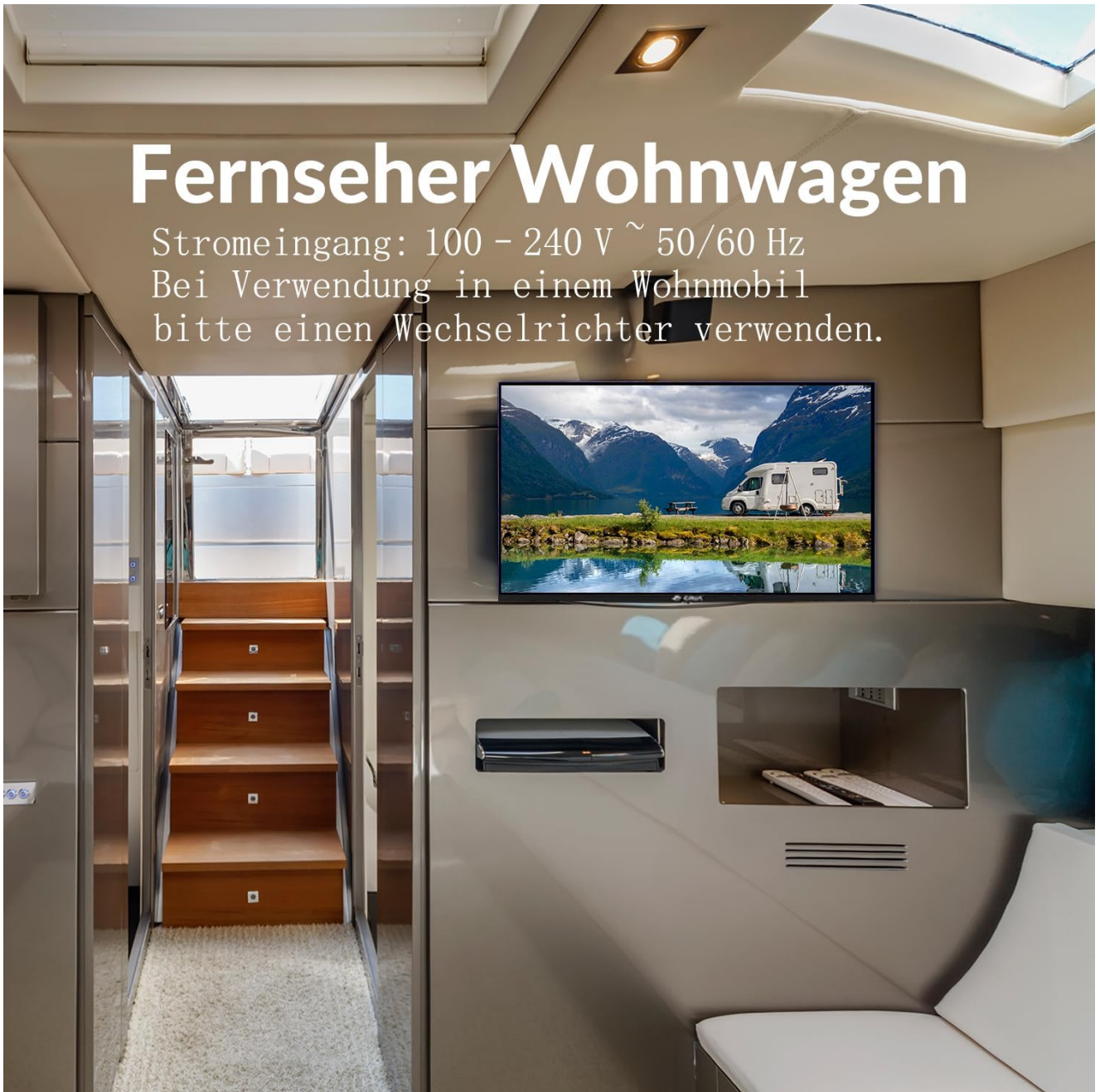
Image: The CRUA Smart TV mounted in a caravan, illustrating its compact size and versatility for various environments.

Stromeingang: 100 - 240 V ~ 50/60 Hz Bei Verwendung in einem Wohnmobil bitte einen Wechselrichter verwenden.