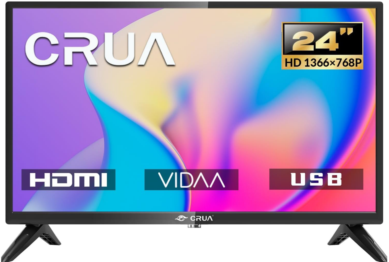
Image: Front view of the CRUA 24-inch Smart TV, highlighting its smart features and connectivity options.

This manual provides essential information for the safe and efficient operation of your CRUA Smart TV 24" (60 cm), model 24F1D. Please read this manual thoroughly before using the television and retain it for future reference. Your CRUA Smart TV features an integrated triple tuner (DVB-T2, DVB-C, DVB-S2), Android 11 certification for access to a wide range of applications, and voice control capabilities via Amazon Alexa or Google Assistant (requires a separate smart speaker).