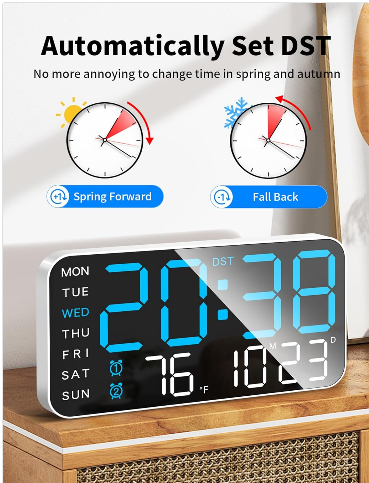
Figure 4.3: Automatically Set DST. The clock can automatically adjust for Daylight Saving Time.

time, eliminating the need for manual changes during spring forward or fall back.