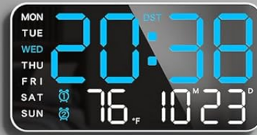
Figure 3.2: Two Power Modes. The clock can be powered by a USB cable for continuous display or by 3 AAA batteries for a power-saving, voice-activated display.

Your browser does not support the video tag.