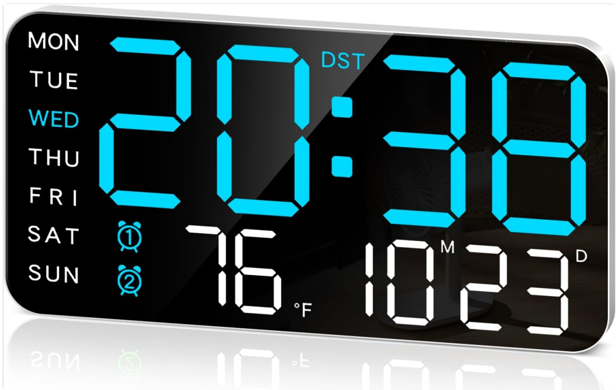
Figure 4.1: Key Information Clearly Visible. The clock displays time, day of the week, temperature, and date.