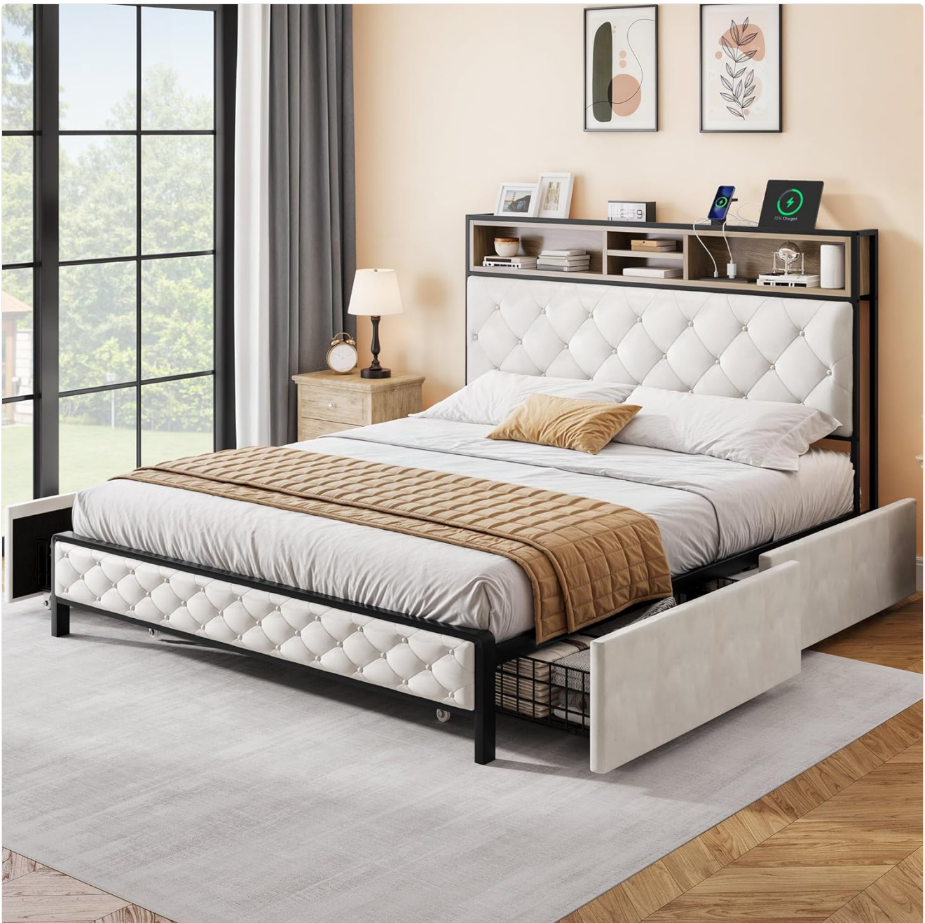
Image 1.1: The DWVO Queen Size Storage Bed Frame, showcasing its upholstered design, bookcase headboard, and under-bed storage drawers.