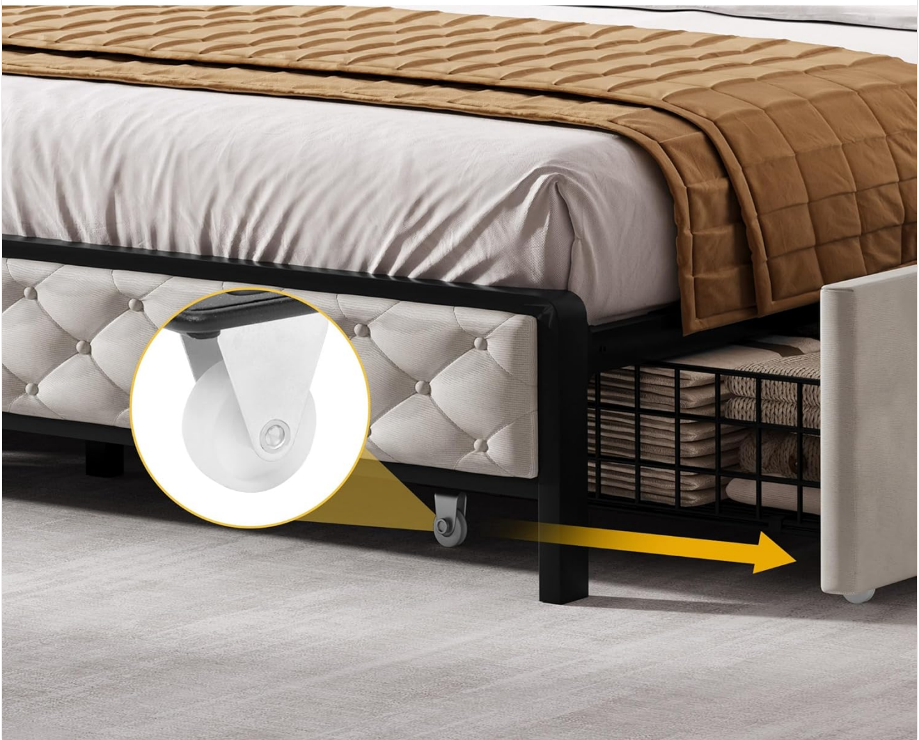
Image 4.3: A close-up of the under-bed storage drawer, highlighting the wheels for smooth and easy access.

The drawer under the bed has wheels for easy pulling out