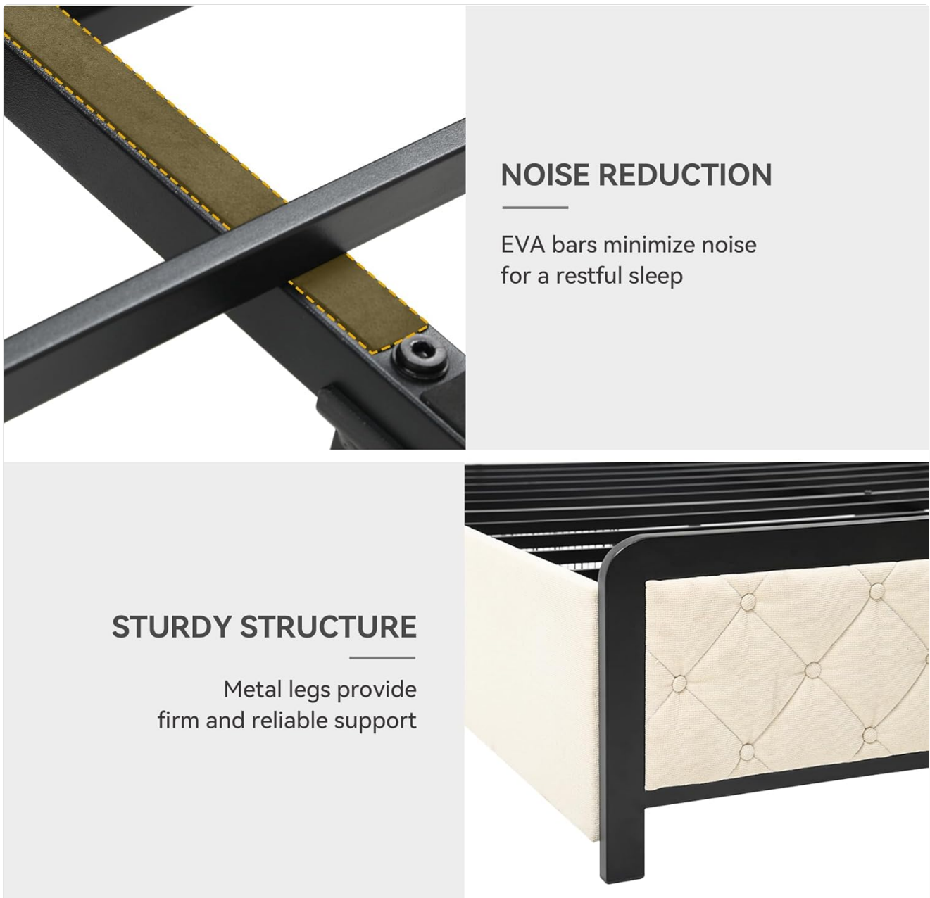
Image 3.1: Close-up view highlighting the noise-reducing EVA bars on the frame and the sturdy metal legs, contributing to a quiet and stable setup.