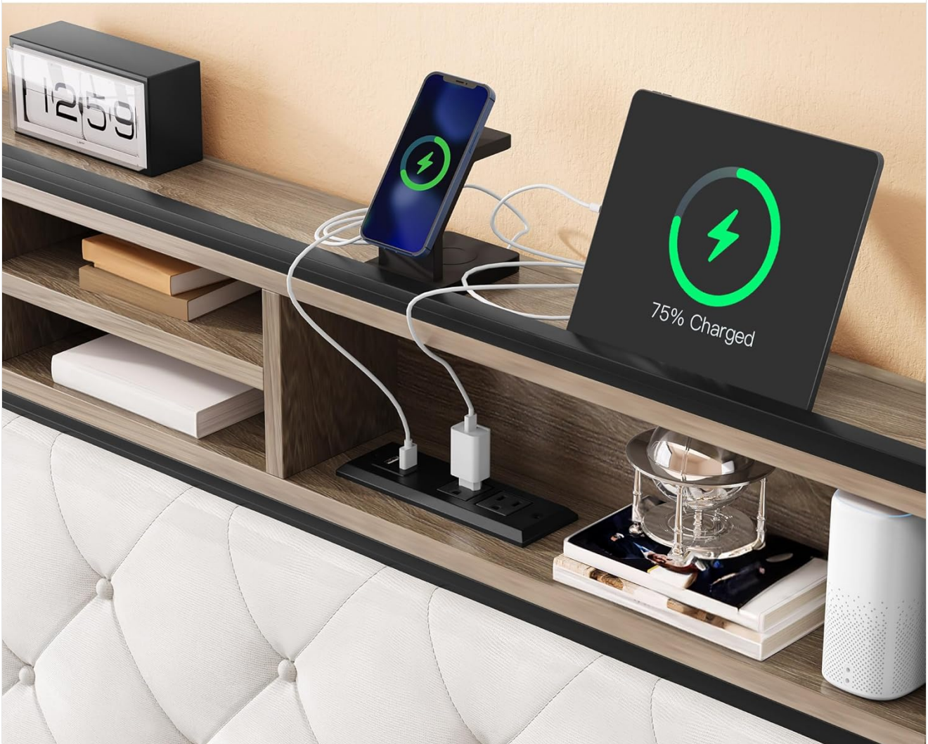
Image 4.1: The integrated charging station on the headboard, featuring two AC outlets and two USB ports for convenient device charging.