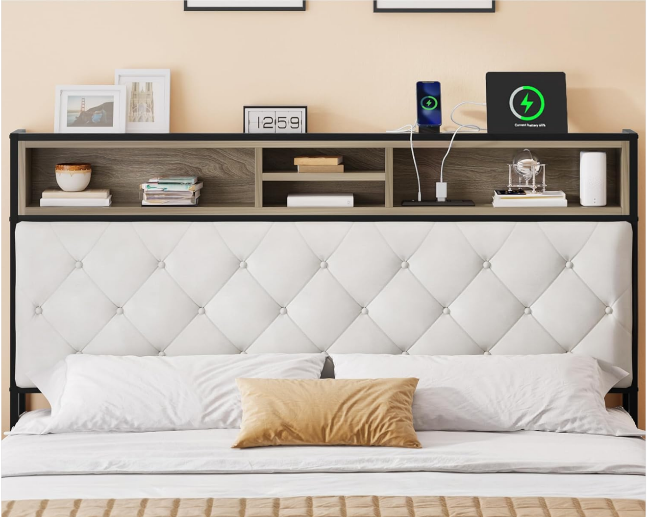
Image 4.2: The double-layered headboard storage, offering ample space for daily necessities and decorative items.

Double layered storage with large storage space to meet daily storage needs