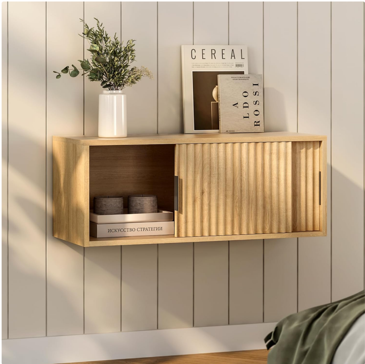
Image: The EYYTHUNG Fluted Wall Cabinet, showcasing its natural oak finish and sliding doors, adorned with a vase and books.