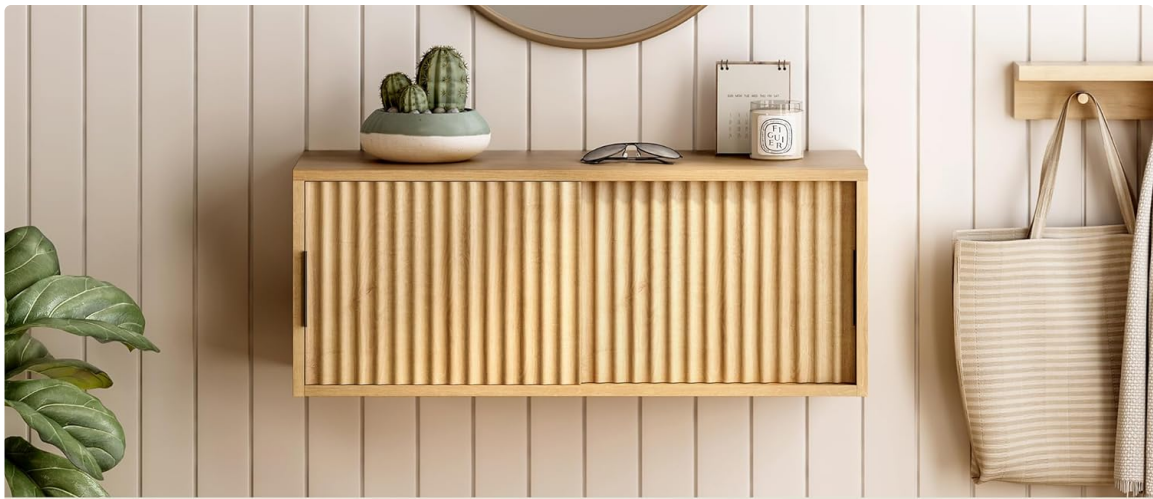
Wall-mounting Free Up Space Beneath