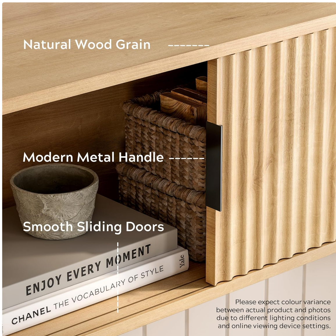
Image: Detailed view of the natural wood grain, the modern metal handle, and the smooth functionality of the sliding doors.