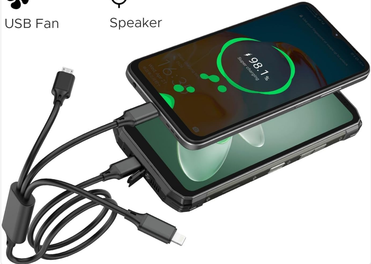
Figure 4: Demonstrates the 18W 3-in-1 OTG fast charging capability.

This image shows the phone's ability to charge multiple devices simultaneously using its reverse charging feature.