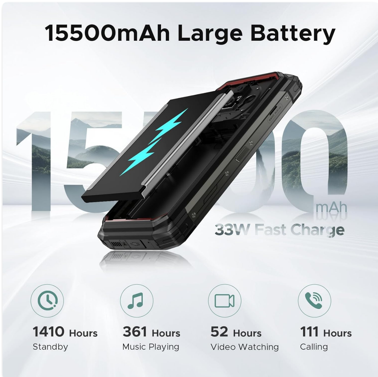
Figure 3: Illustrates the impressive battery life of the 15500mAh battery.

This image highlights the long standby, music playing, video watching, and calling times provided by the large 15500mAh battery.