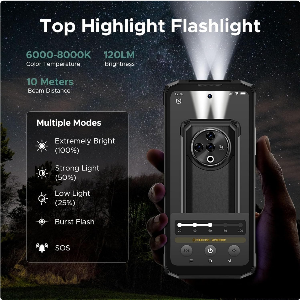
Figure 8: Overview of the 120LM flashlight and its multiple modes.

This image details the color temperature, brightness, beam distance, and various lighting modes available for the flashlight.