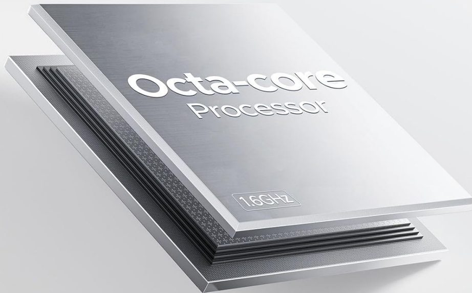
Figure 6: Overview of the powerful Octa-Core Processor, RAM, and ROM.

This image illustrates the phone's processing power and memory configurations, including basic RAM, extended RAM, ROM, and expandable storage.