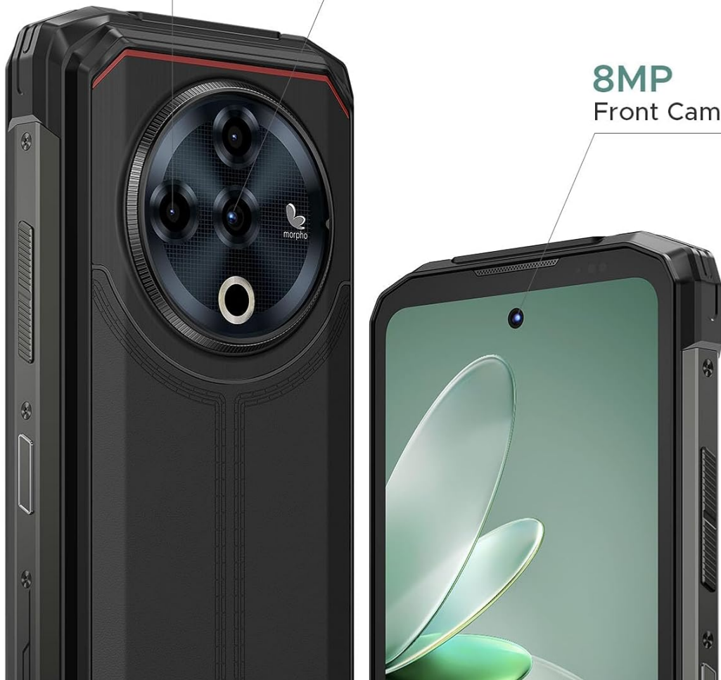
Figure 7: Details of the phone's camera setup.

This image highlights the 2MP macro camera, 50MP super anti-shake main camera, and 8MP front camera specifications.