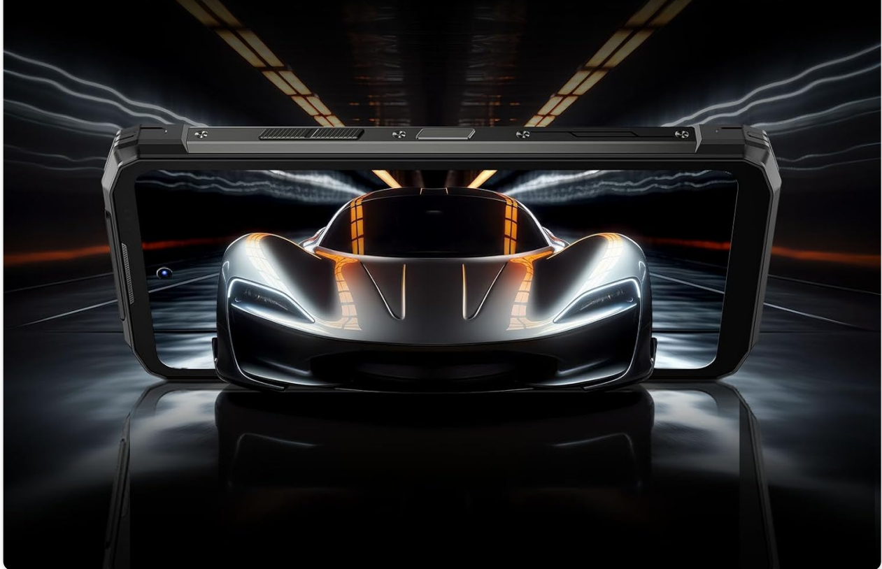
Figure 5: Specifications of the 6.56-inch IPS Ultra HD Display.

This image details the screen-to-body ratio, resolution, refresh rate, aspect ratio, color depth, and contrast of the display.