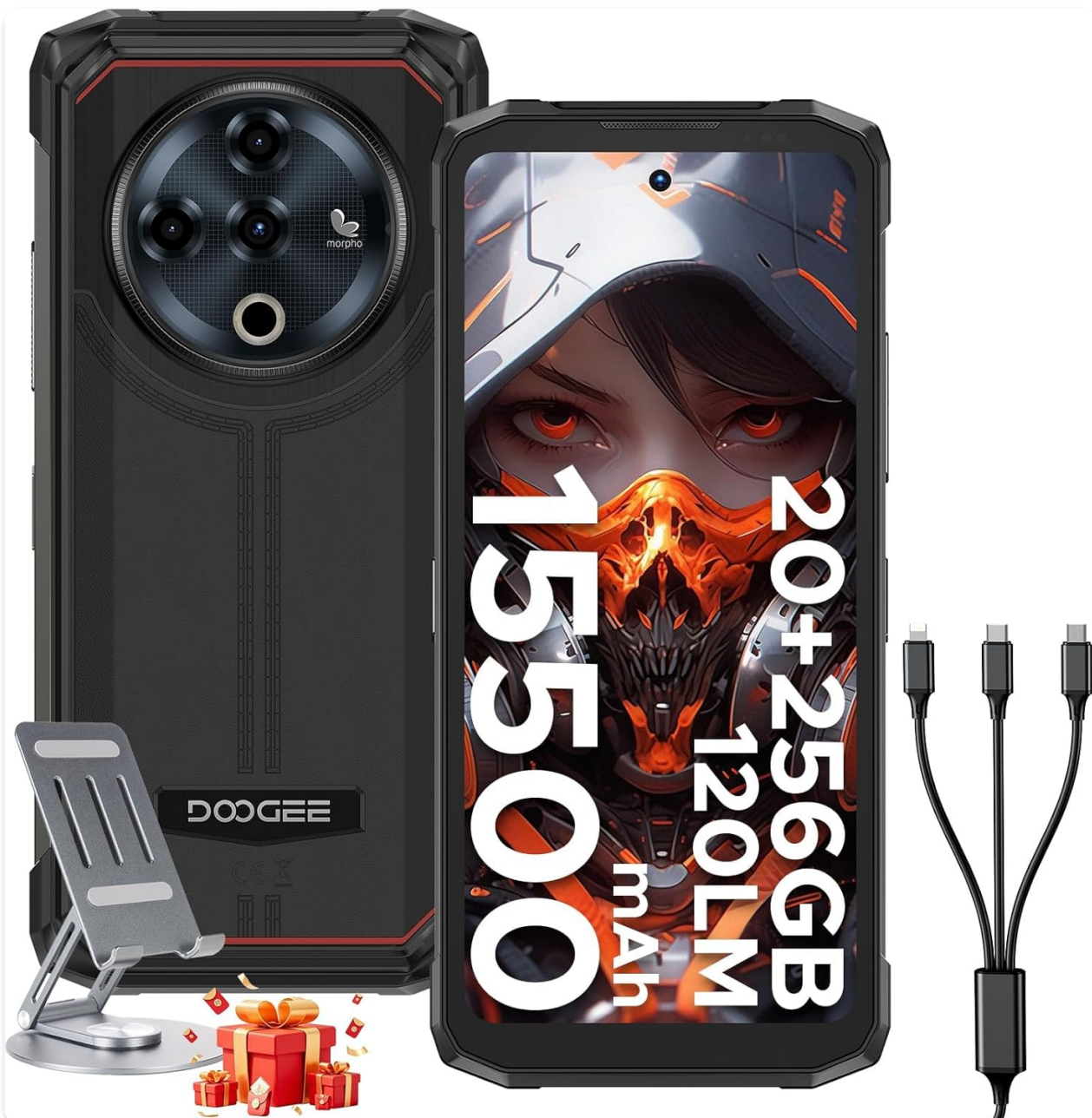
Figure 1: DOOGEE Fire 6 Power Rugged Smartphone (Black)

The DOOGEE Fire 6 Power is a rugged smartphone featuring a large display, powerful cameras, and a durable build, designed for users who require reliability in demanding conditions.