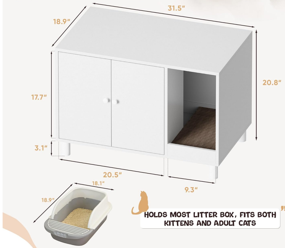
Image description: This diagram provides a clear overview of the enclosure's external dimensions, including length, width, and height, essential for planning placement.