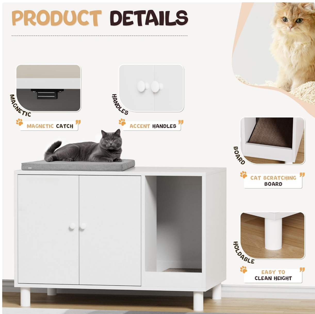
Image description: This image highlights key features such as the magnetic catch for secure doors, round accent handles, the integrated cat scratching board at the entrance, and the elevated legs for easy cleaning underneath.