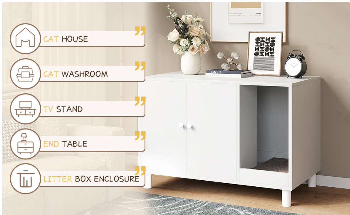
Image description: This visual demonstrates the primary function of the enclosure: providing a private space for the litter box, reducing odors, and minimizing litter scatter with its design.

Open the front doors and place a standard-sized litter box inside the main compartment. The side entrance allows your cat private access. The integrated scratching pad helps to reduce litter tracking as your cat exits.