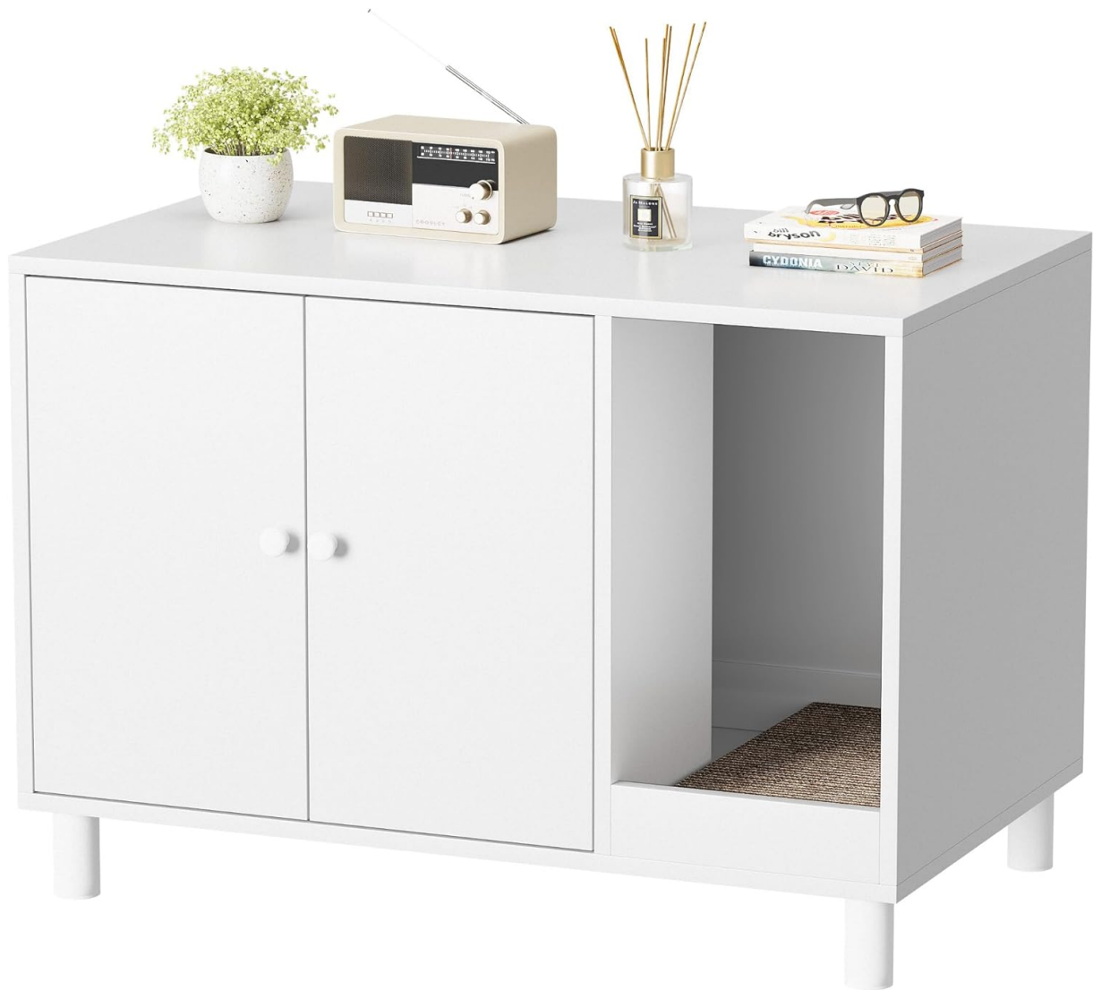
Image description: The enclosure functioning as an end table, adorned with a plant, radio, and books, showcasing its dual purpose.