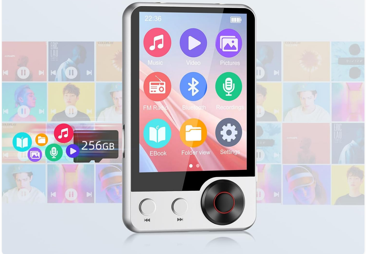
Figure 3.3: The MP3 player screen showing various app icons, with a graphic indicating 128GB internal memory and support for up to 256GB TF card expansion.

Built-in 128GB memory, also support TF card up to 256GB