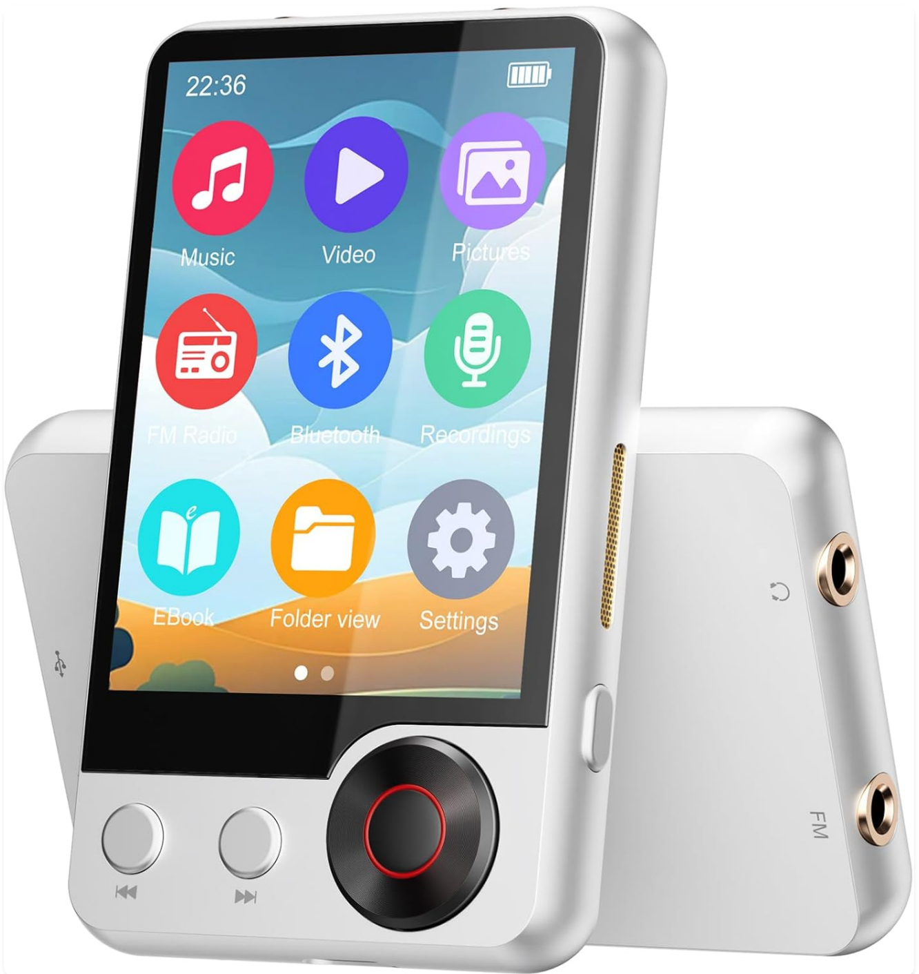
Figure 3.1: Front and back view of the Joliker X58 MP3 Player, highlighting its compact design and dual headphone ports.