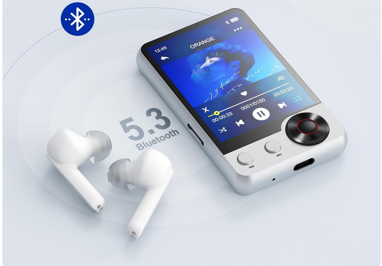
Figure 3.2: The MP3 player displaying a music interface, with two white wireless earbuds nearby, illustrating Bluetooth 5.3 connectivity.

Equipped with the latest Bluetooth 5.3 chip, X58 mp3 player has a faster and more stable transmission with Bluetooth headphones or speakers.