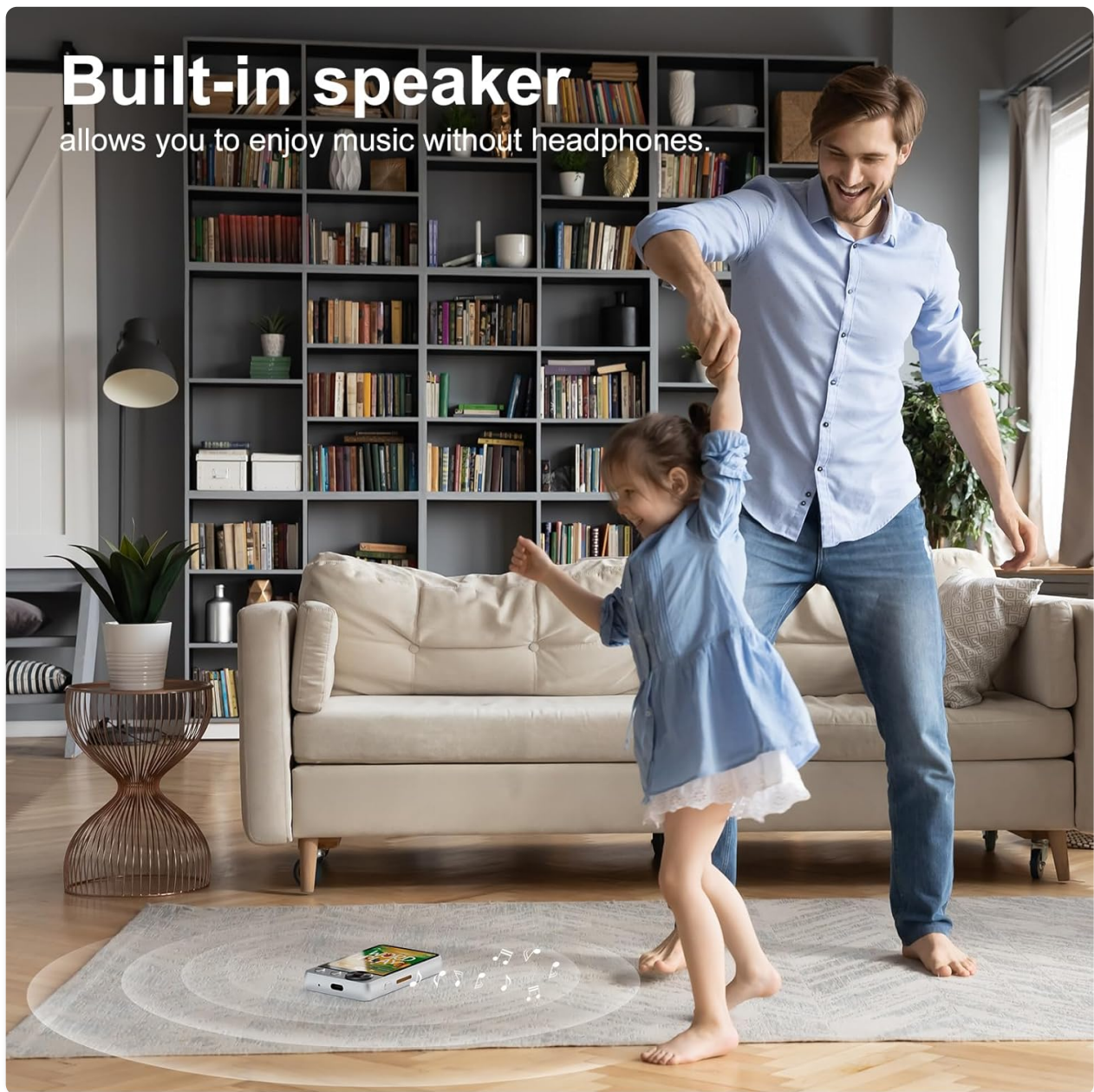
Figure 3.6: A father and daughter dancing in a living room, with the MP3 player on the floor emitting sound, demonstrating the built-in speaker feature.