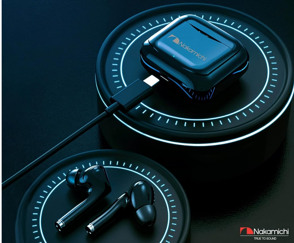
Image: Nakamichi TW2XS charging case connected to a power source via USB-C cable, with earbuds inside. This illustrates the charging process.

Approximate playtime using alongside charging case