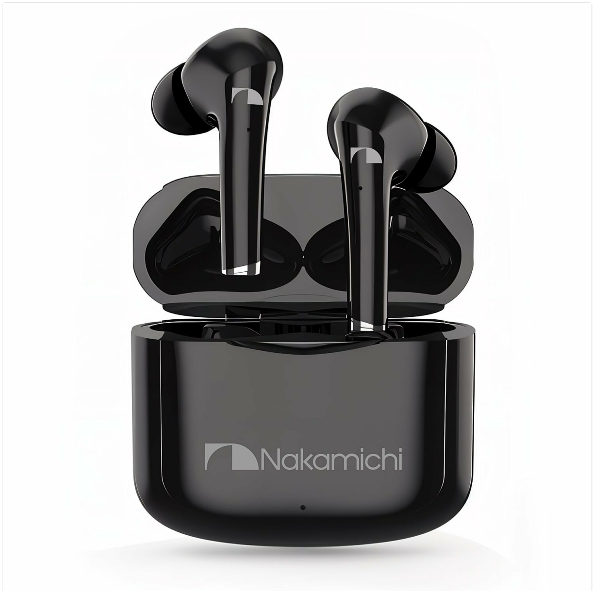
Image: Nakamichi TW2XS Earbuds and their charging case. The earbuds are shown in their sleek black design, ready for use.