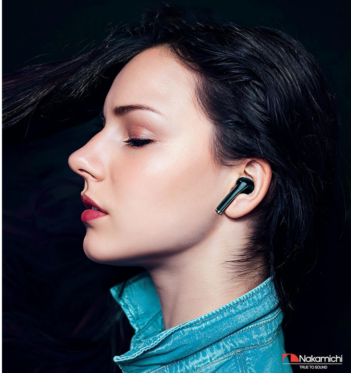
Image: A person wearing a Nakamichi TW2XS earbud, demonstrating the ergonomic in-ear design for a comfortable and secure fit.

Experience the ultimate in comfort with our ergonomically designed in-ear headset. Engineered for all-day wear, it ensures a flawless fit and truly comfortable listening experience.