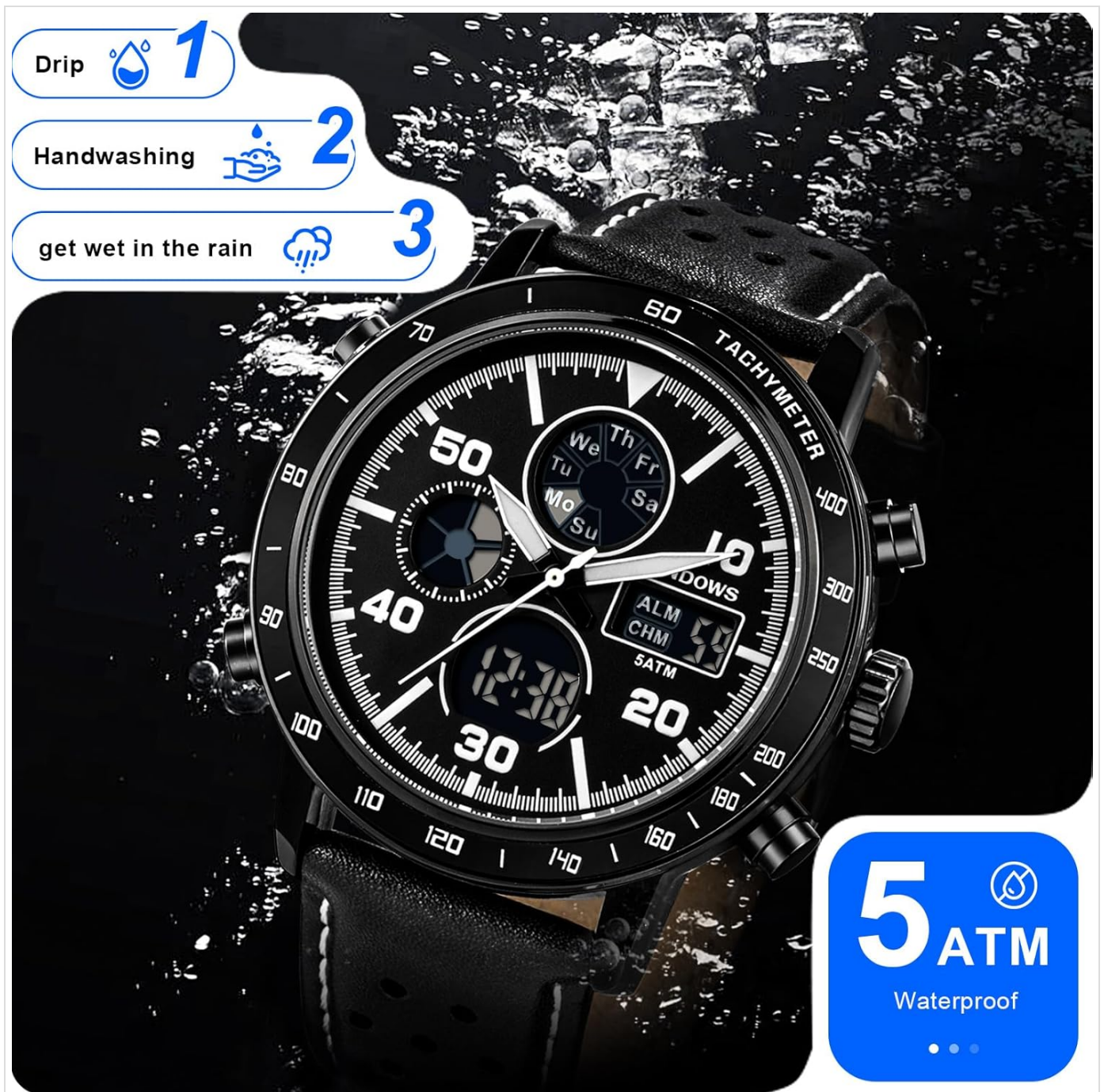
Image: Visual representation of the watch's 5 ATM water resistance, suitable for daily splashes and rain, but not for submersion.