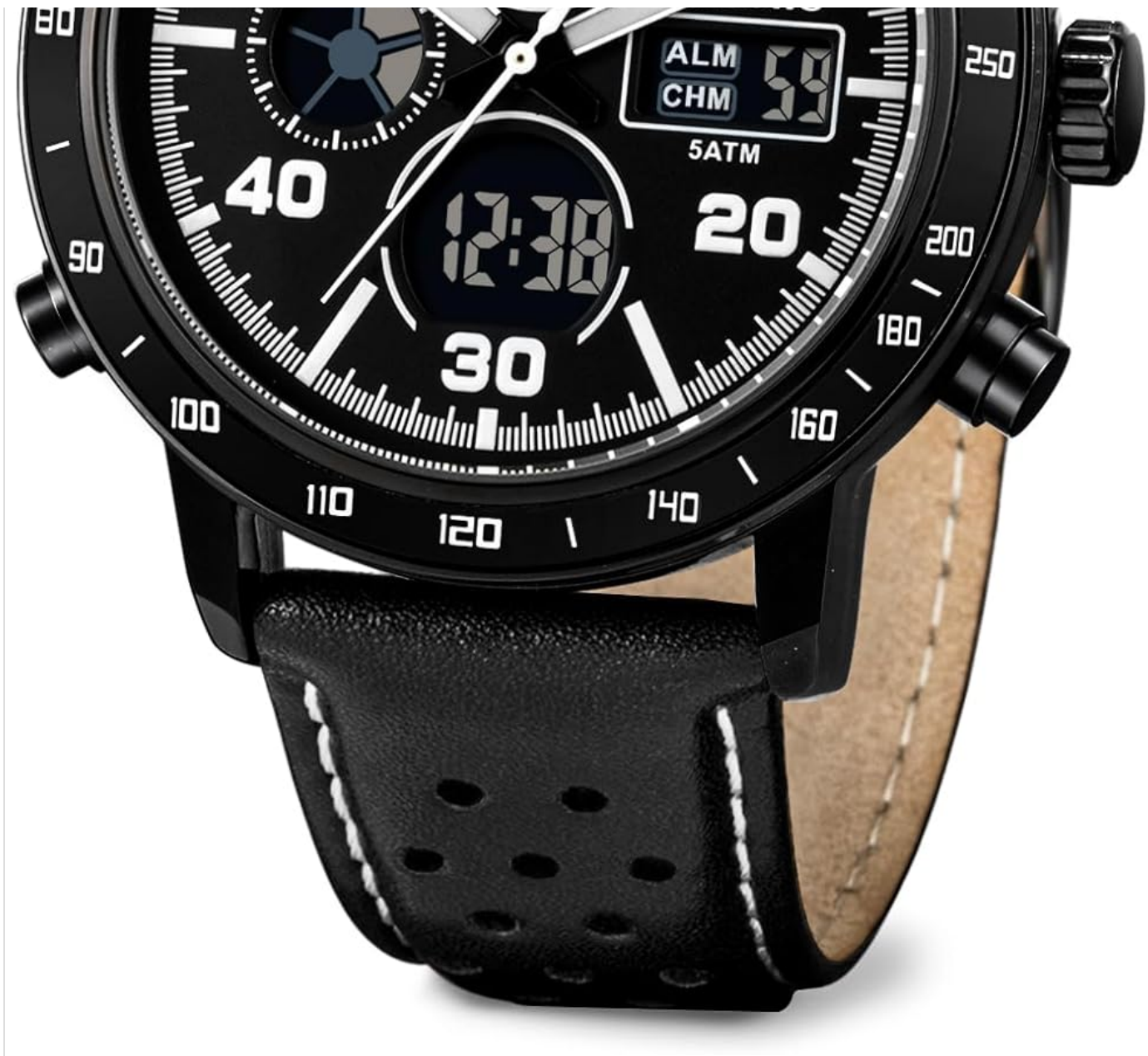
Image: Front view of the PINDOWS PDS-642 watch, showcasing the analog and digital displays, and control buttons.