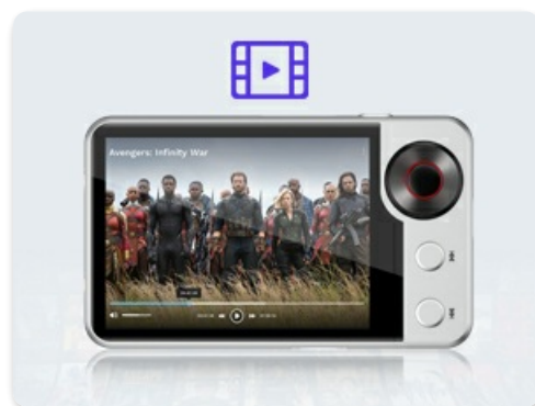
Video playback feature for enjoying multimedia content.

Tap the 'Video' icon to play supported video files. Ensure your video files are in a compatible format for optimal playback. The device's 2.4-inch screen provides a compact viewing experience.