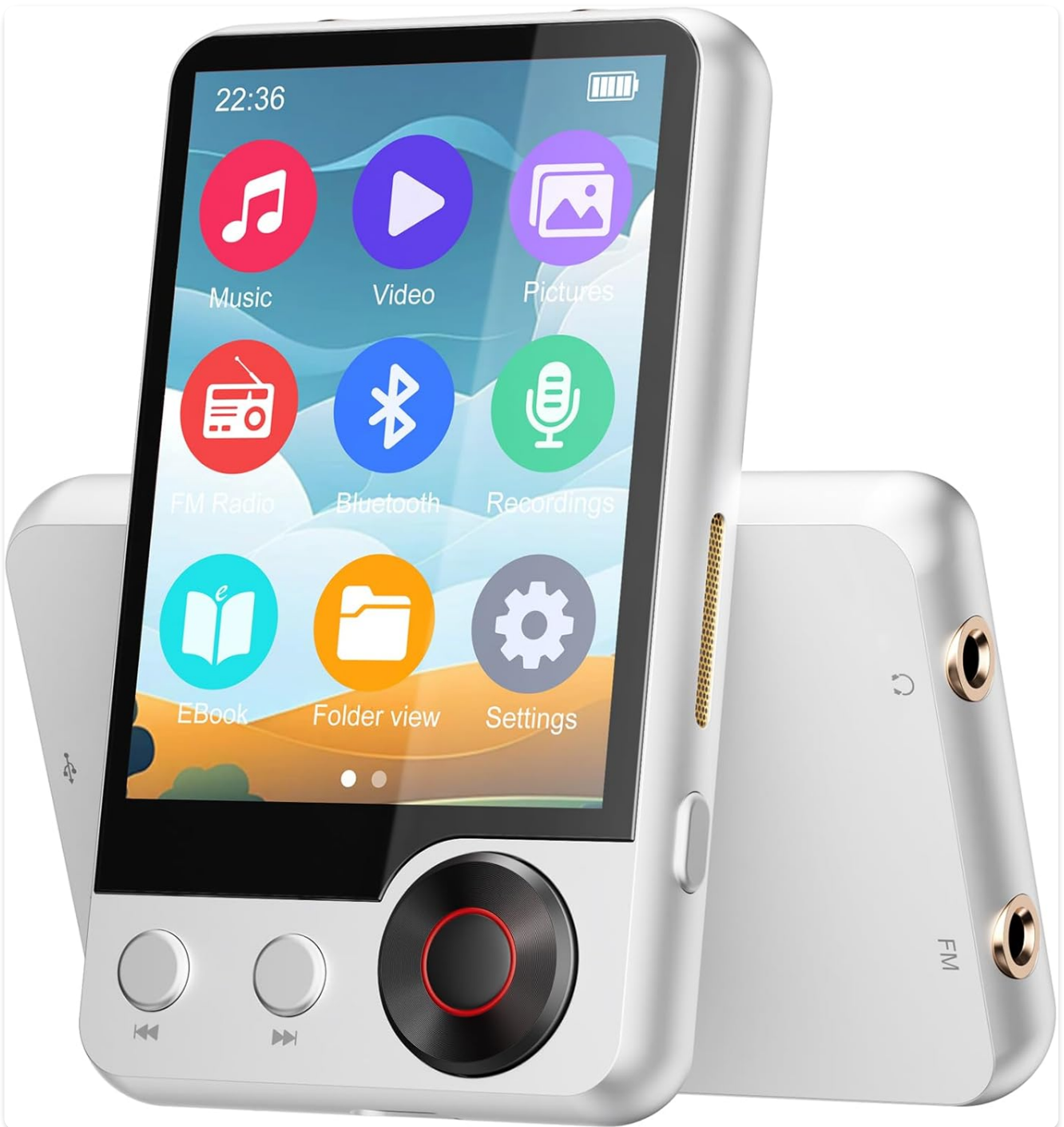
The joliker X58 MP3 Player, showcasing its intuitive touchscreen interface and compact design.