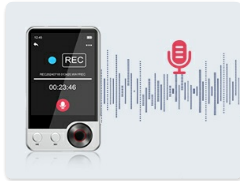
Voice Recorder feature for capturing audio moments.

Tap the 'Recordings' icon to access the voice recorder. Press the record button to start and stop recording. Recordings are saved internally and can be managed through the 'Folder view' or 'Recordings' menu.