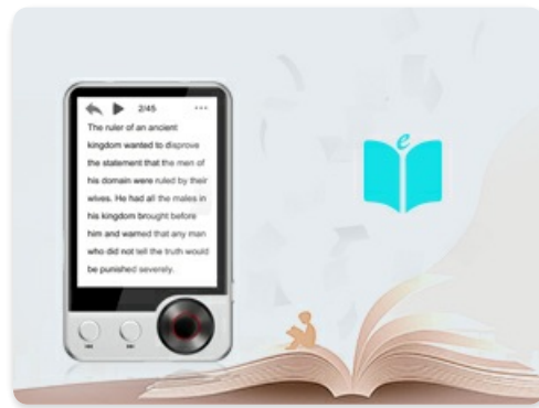
E-book reader for reading text files on the go.

The device supports e-book reading. Tap the 'EBook' icon to open your text files. Note that only plain text (.txt) files are supported for e-books. You can adjust font size and navigate pages using the touchscreen.