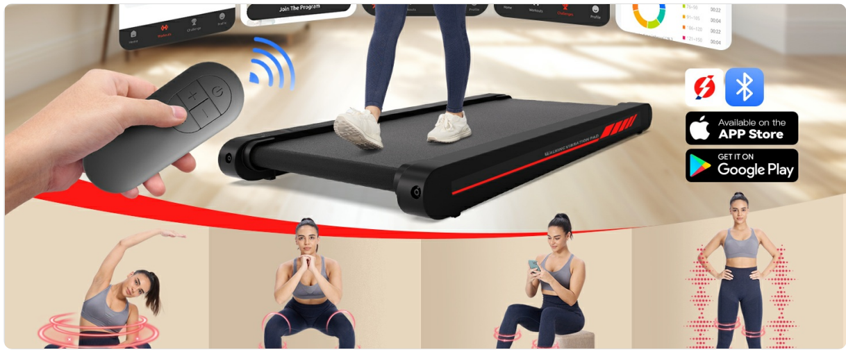
Figure 5: Remote control for easy operation and real-time data display.