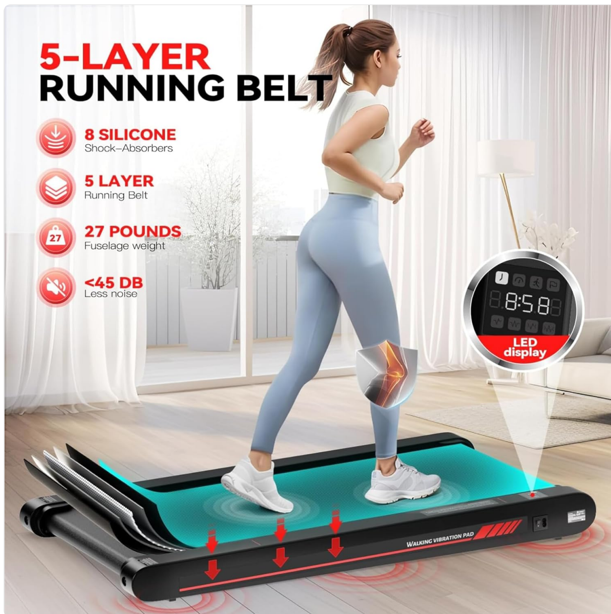
Figure 8: The Sperax Walking Vibration Pad is easy to carry and store, weighing only 27 lbs.