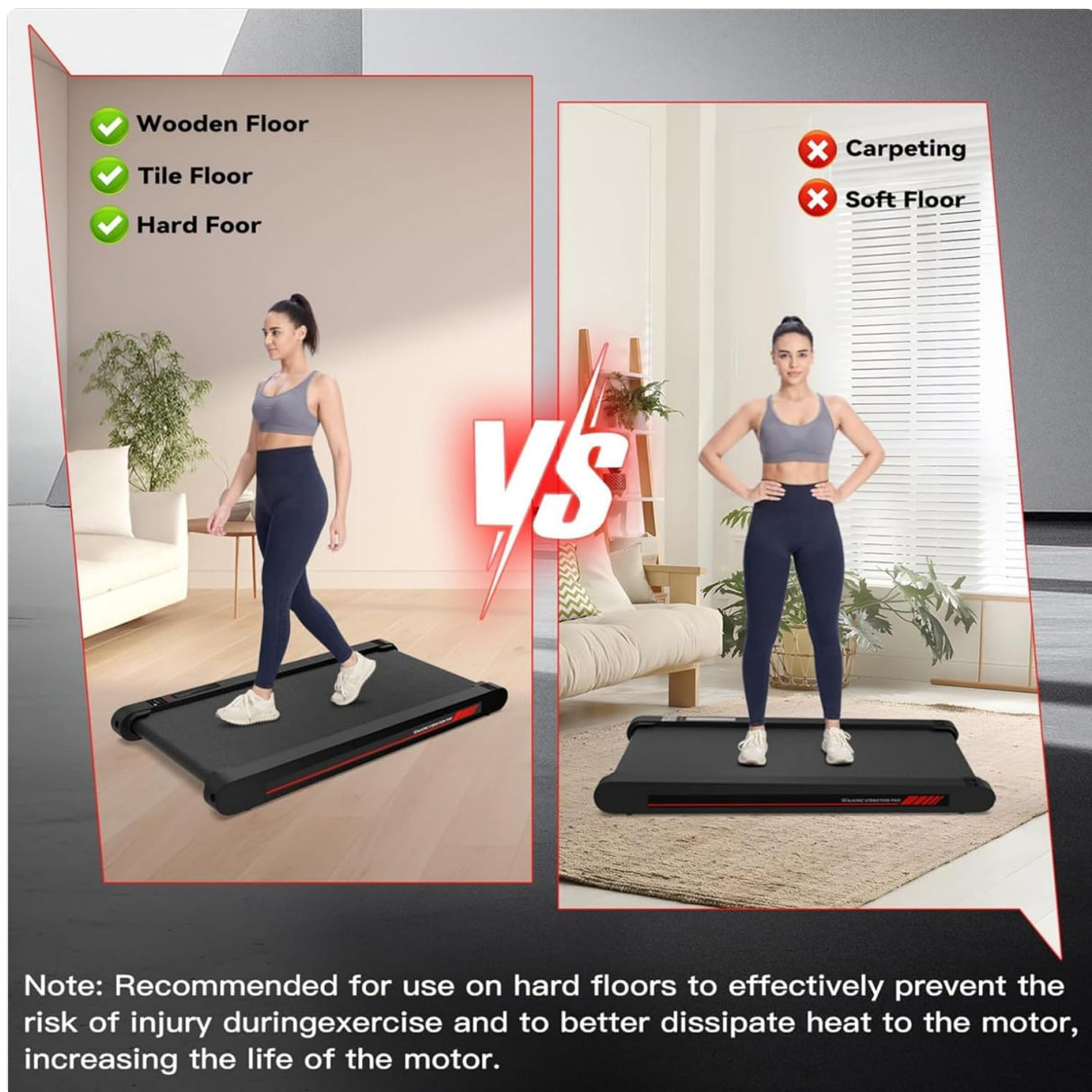
Figure 2: Recommended usage on hard floors for optimal performance and safety.