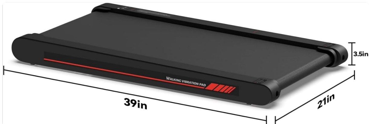
Figure 9: Product dimensions for space planning.