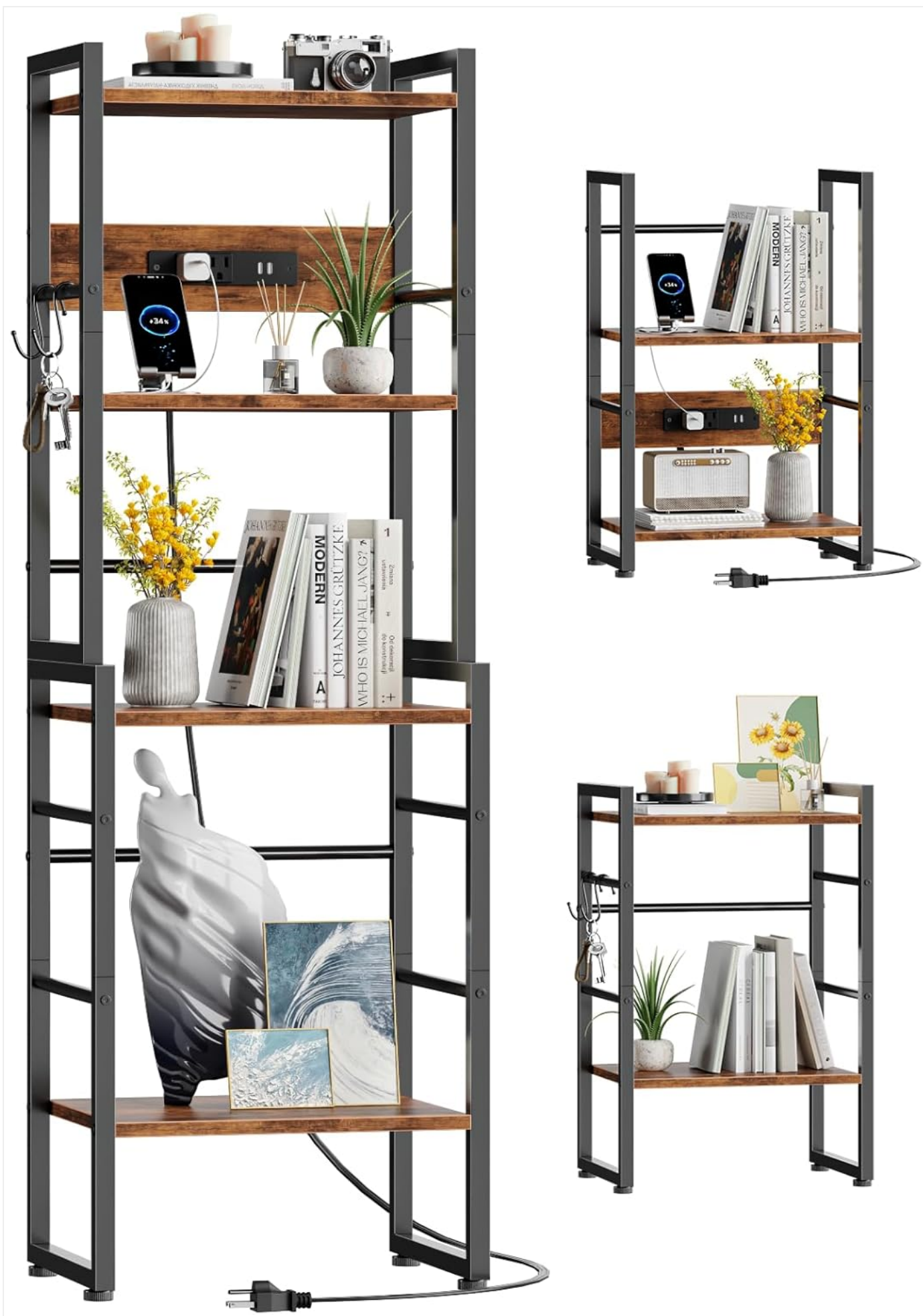
Image: The fully assembled Furolee 4-Tier Bookshelf, showcasing its rustic brown shelves, black metal frame, and integrated power outlet with devices plugged in. Various items like books, plants, and decorative pieces are displayed on the shelves.