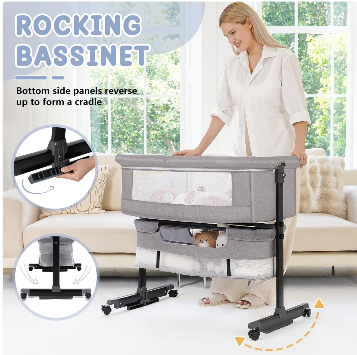
Illustration of the rocking mechanism on the bassinet base.