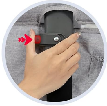
Height Adjustable Button