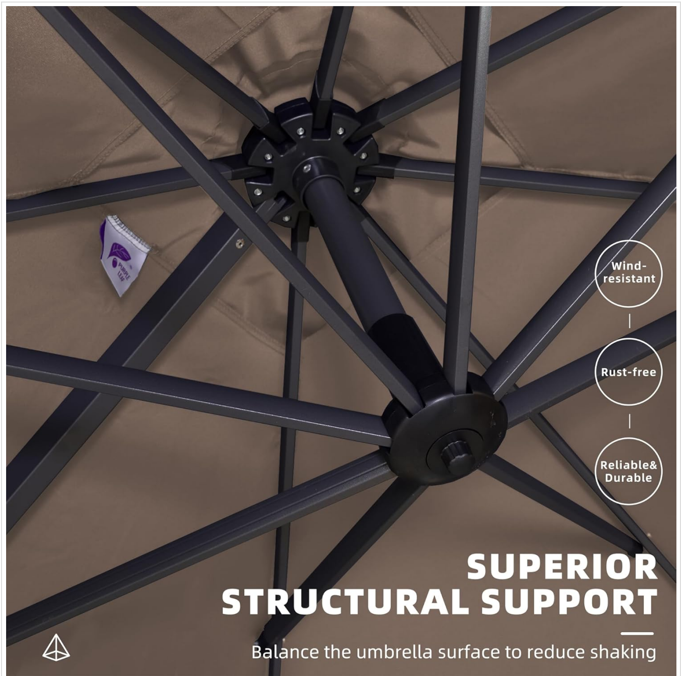
Image: The crank system, designed for easy opening and closing of the canopy, supported by a triangular structure.