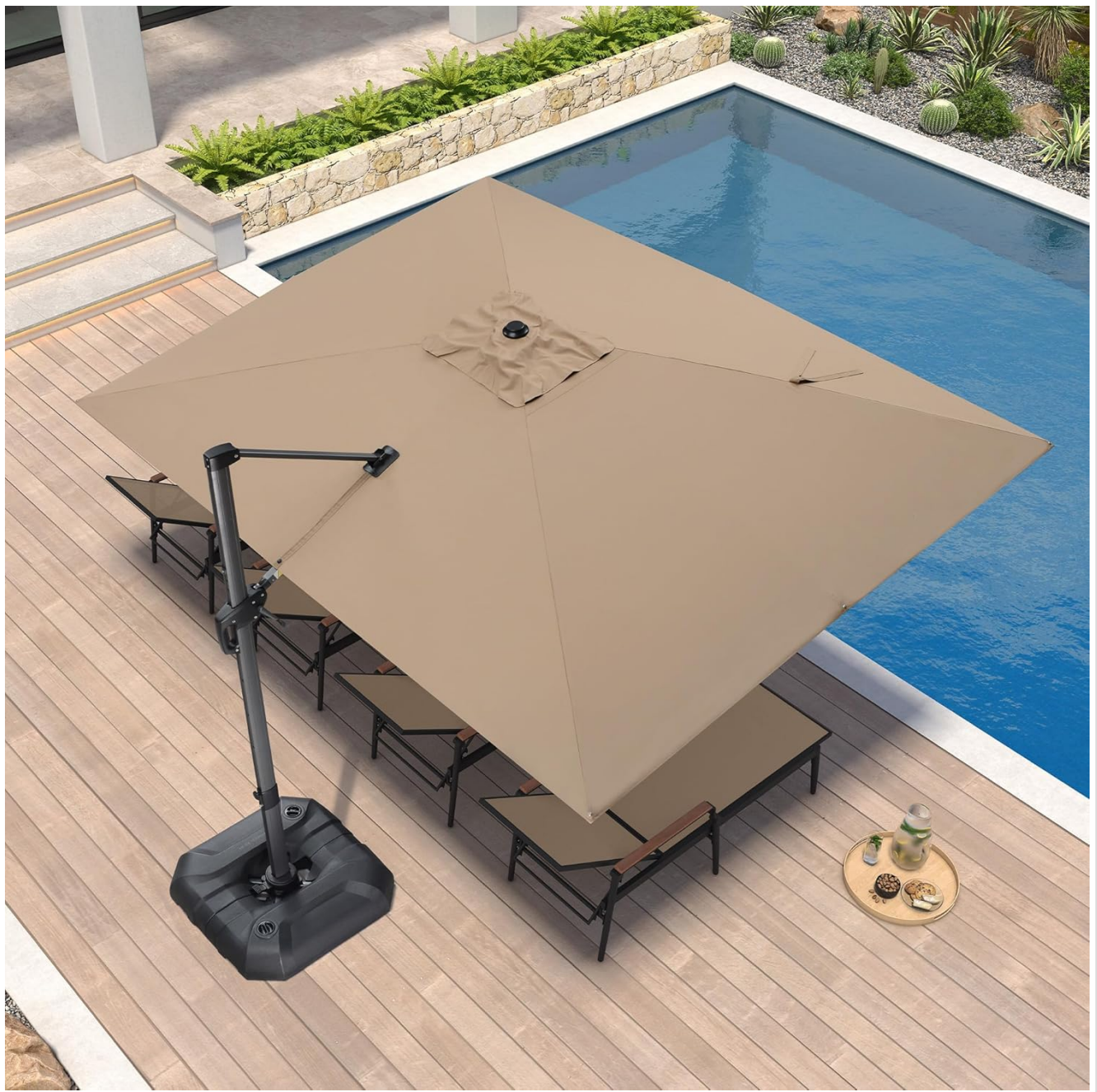
Image: The PURPLE LEAF 9' X 11.5' Taupe Patio Umbrella providing ample shade over a pool deck with lounge chairs.