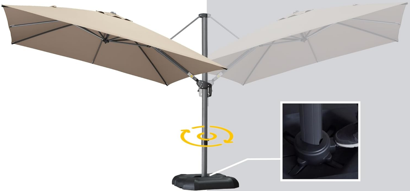
Image: Detail of the umbrella's superior structural support, highlighting wind-resistant, rust-free, reliable, and durable components.