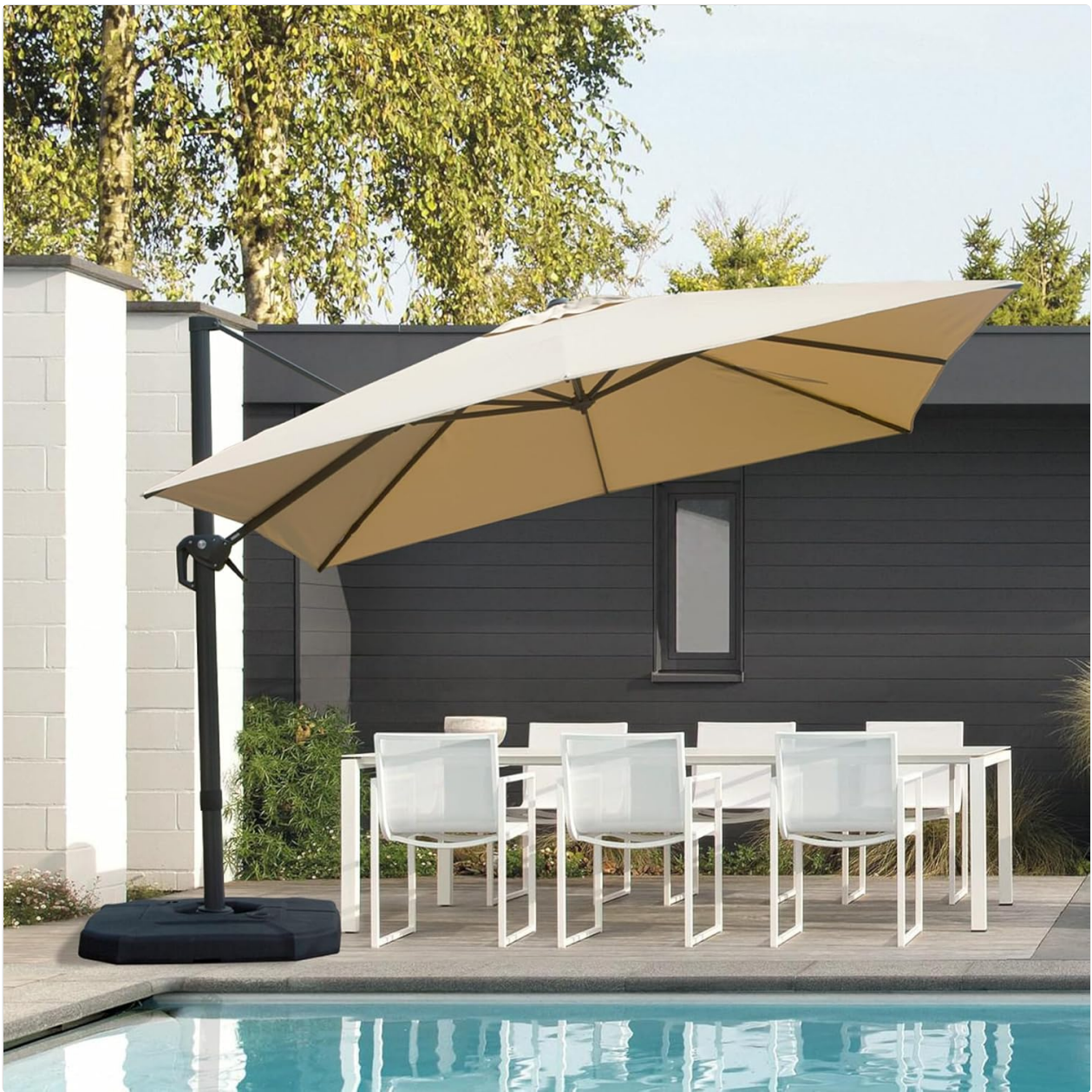
Image 2.1: The Domi 9'x9' Cantilever Patio Umbrella providing shade over an outdoor dining area.