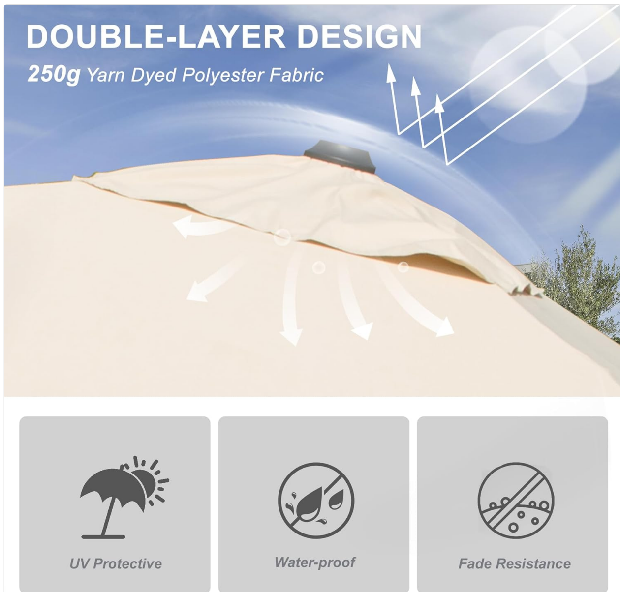
Image 6.2: The double-layer canopy design enhances breathability and UV protection.