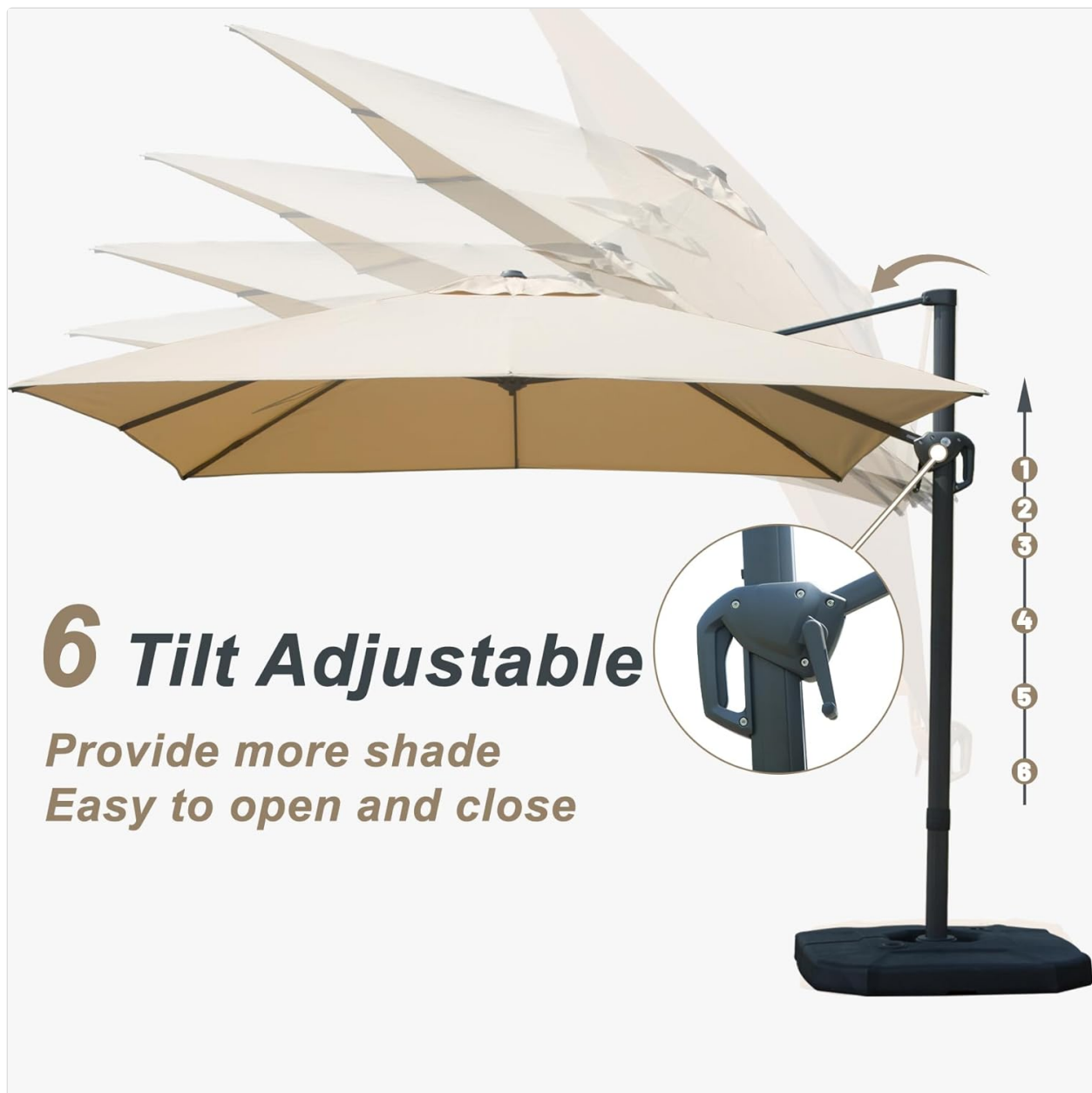
Image 5.1: The tilt adjustment mechanism, allowing for multiple canopy angles.