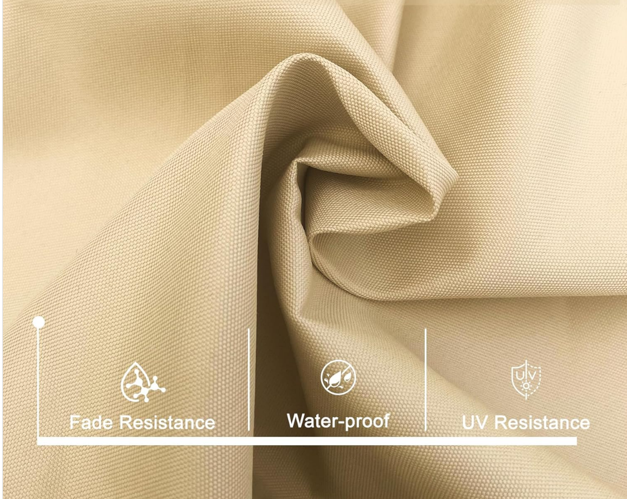
Image 6.1: The yarn-dyed polyester fabric is designed for fade resistance, water resistance, and UV protection.