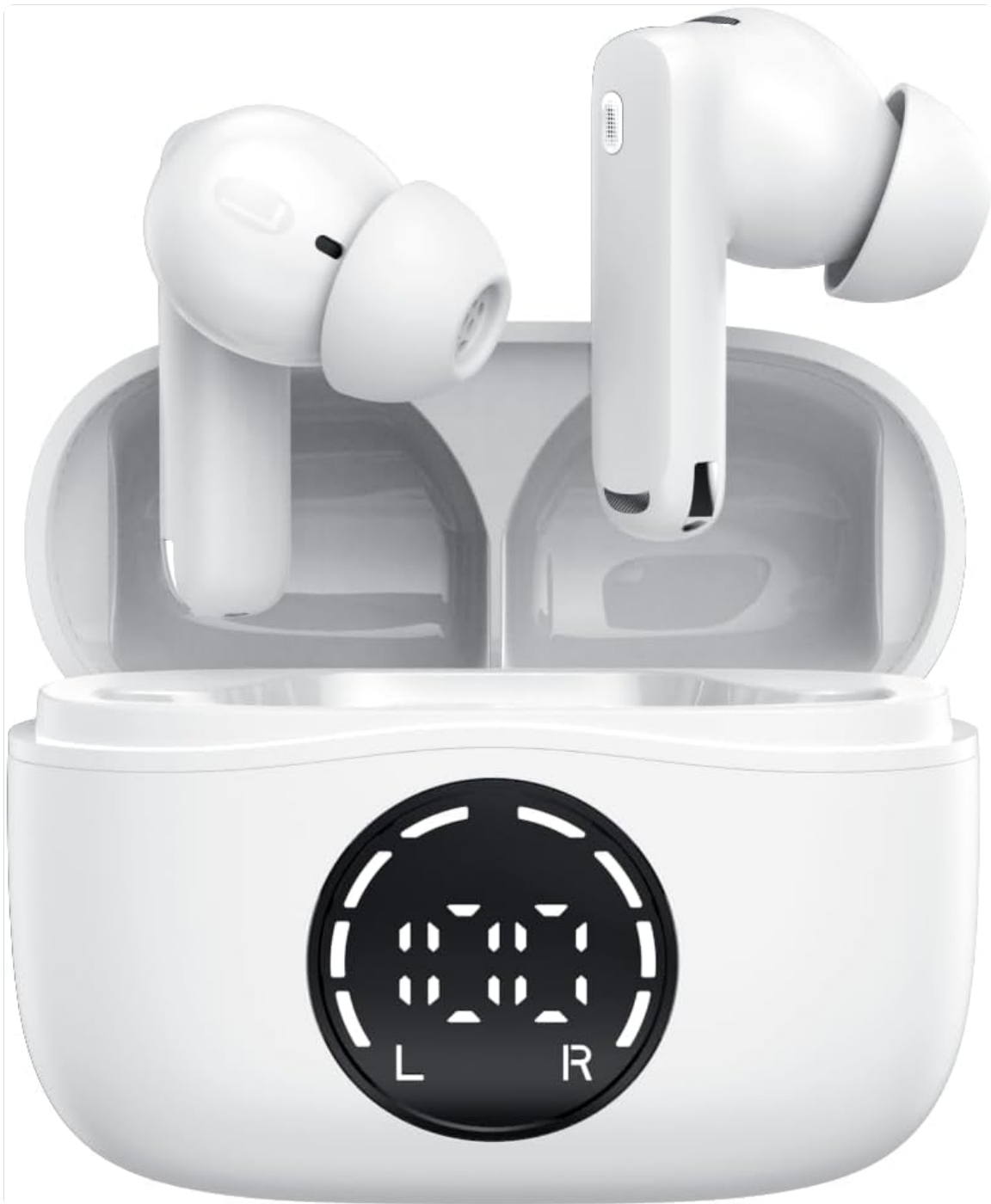
Image: The chalh Wireless Earbuds J66, shown in their open charging case, highlighting the earbuds and the digital display on the case.