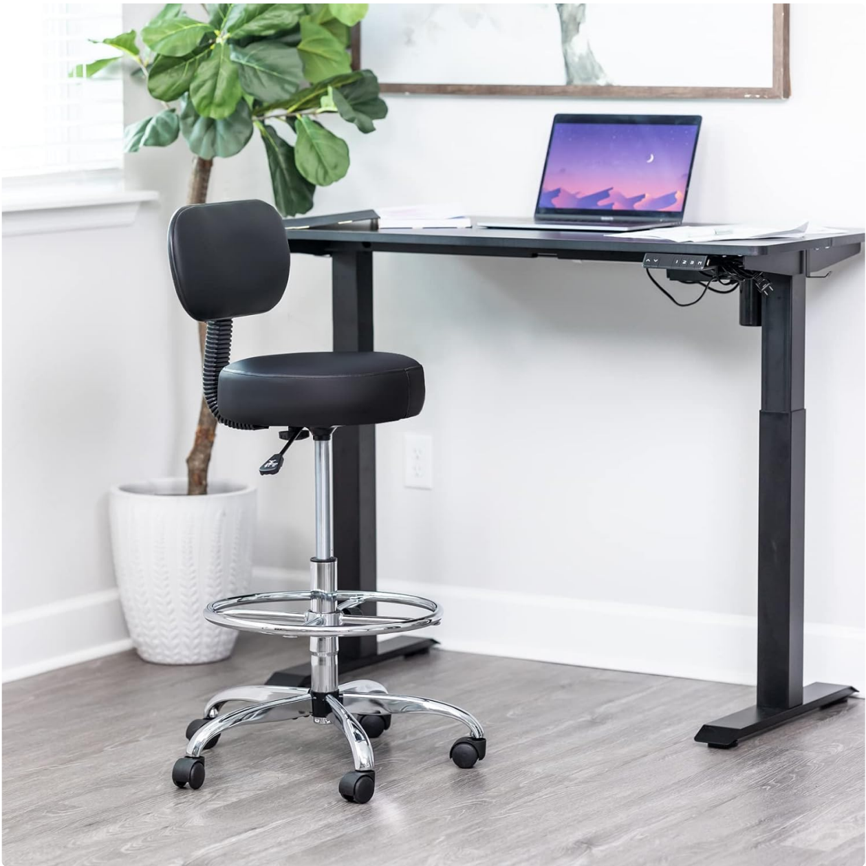
Image: The SUPERJARE Drafting Chair and Huuger 47 Inch Computer Desk bundle set up in a modern office environment.