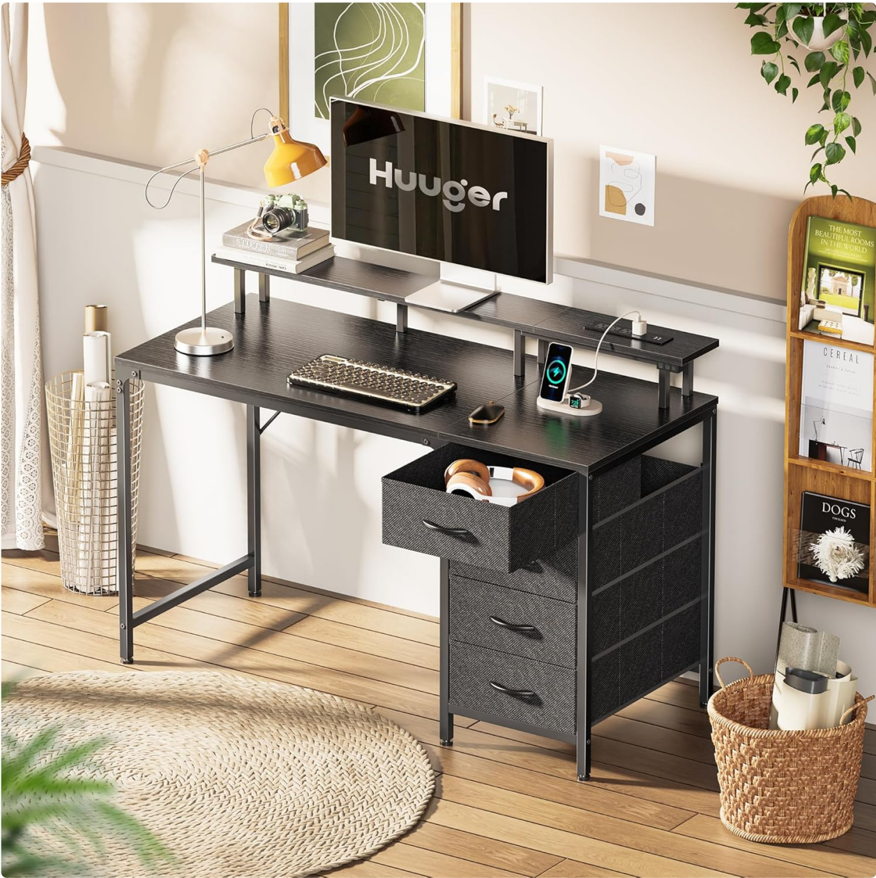
Image: The Huuger 47 Inch Computer Desk set up with a monitor, keyboard, and various accessories, showcasing its functional design.

back edge of the monitor stand or desktop, ensuring the controller is accessible.