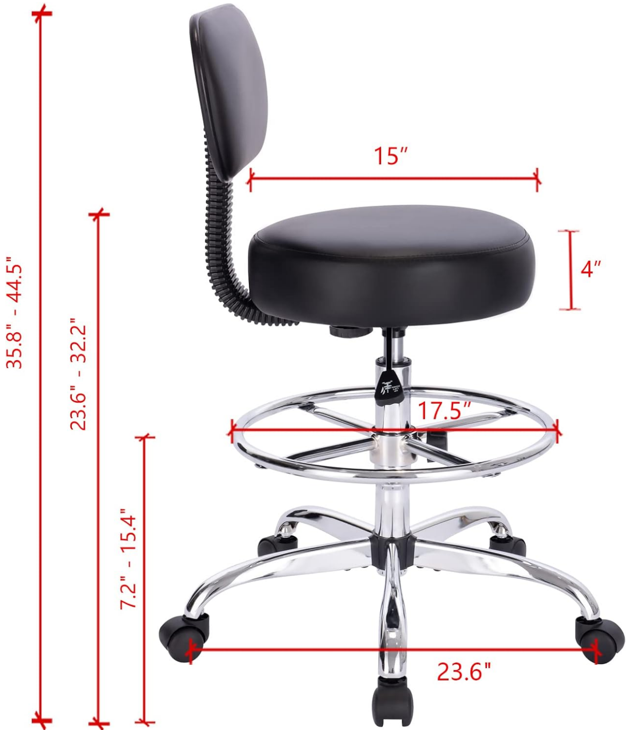
Image: Detailed dimensions of the SUPERJARE Drafting Chair, showing height, seat width, and footrest height ranges.