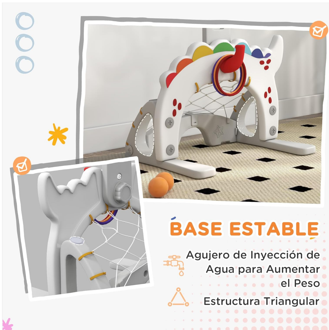
Image 4.1: Detail of the stable base with fill hole for water or sand.