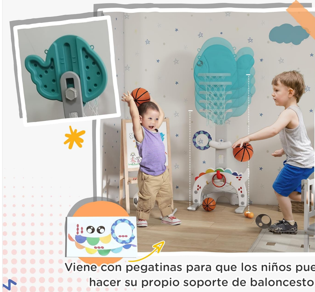
Image 4.3: The adjustable height mechanism, allowing the hoop to grow with your child.

95-130 cm, crece con niños a partir de 3 años