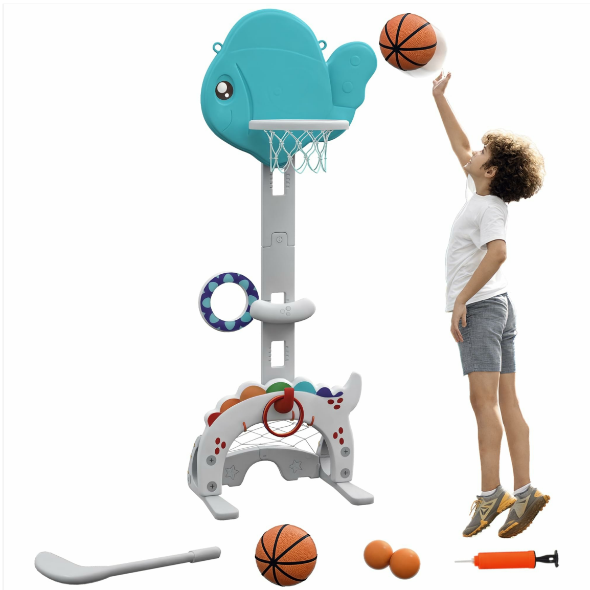
Image 5.1: A child actively playing basketball with the adjustable hoop.

The base of the unit includes a soccer goal. Use the included soccer ball to practice kicking and scoring goals. This promotes leg strength and coordination.