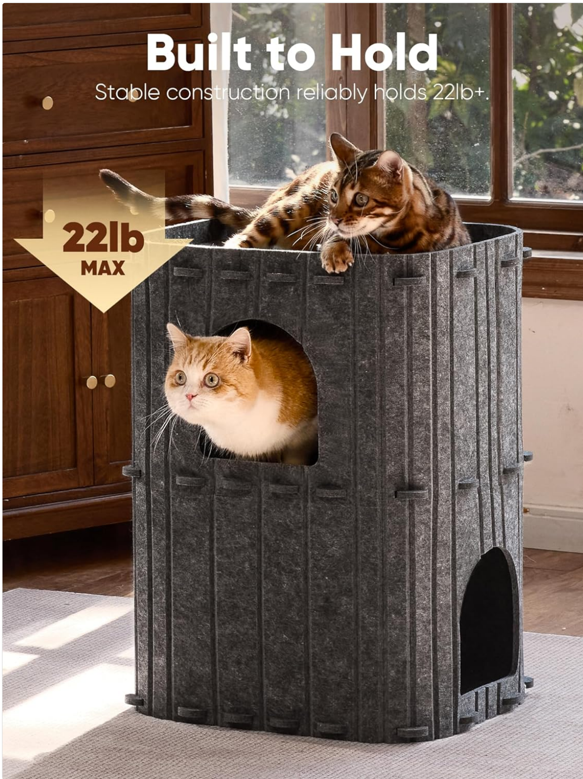
Image: The FUKUMARU Cat Cave demonstrating its sturdy construction, capable of supporting a cat weighing up to 22 pounds on its top surface.

Stable construction reliably holds 22lb+.