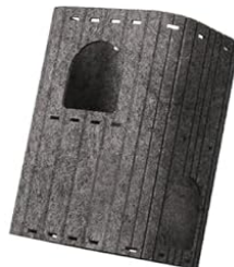
Side Panel (1 piece)