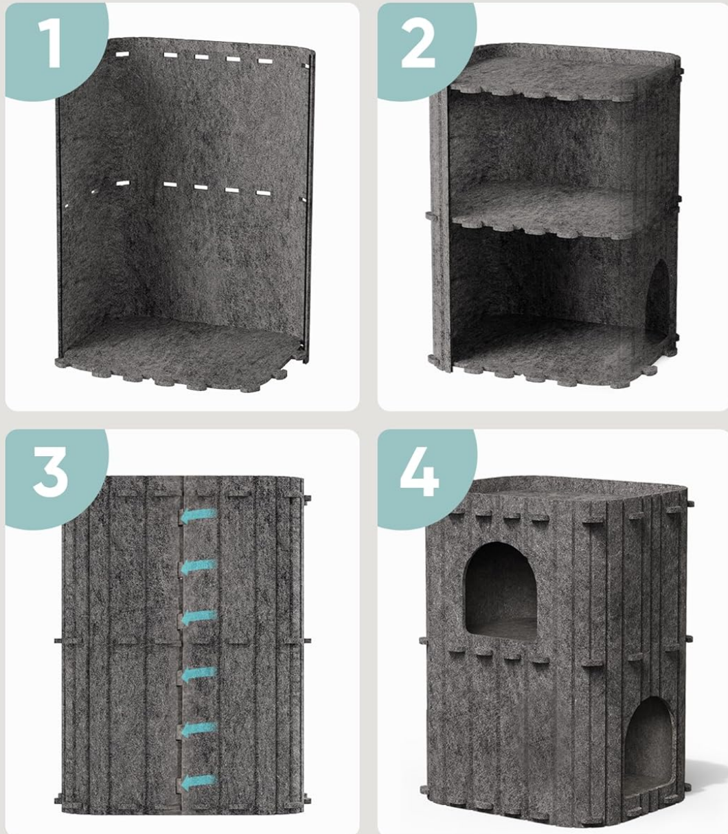
Image: Visual guide for the assembly of the cat cave, detailing the four main steps from laying out panels to securing the final structure.

Modular design for a fast, tool-free setup.