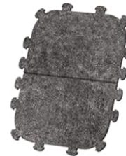
Center Panel without logo (1 piece)