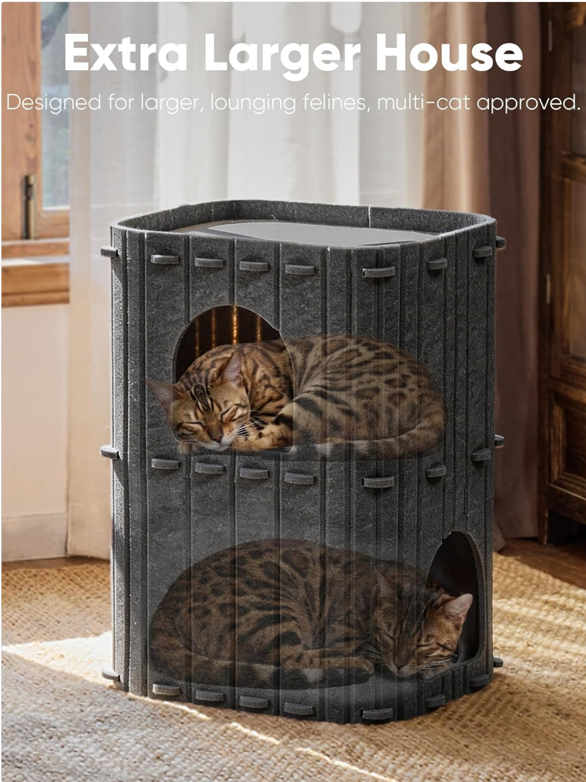
Image: Two cats resting within the multi-level interior of the FUKUMARU Cat Cave, illustrating its spacious design suitable for multiple cats.

Designed for larger, lounging felines, multi-cat approved.