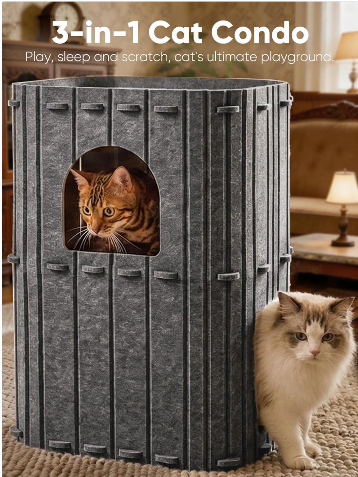
Image: A cat utilizing the FUKUMARU Cat Cave for resting and observation, highlighting its multi-purpose design for play, sleep, and scratching.