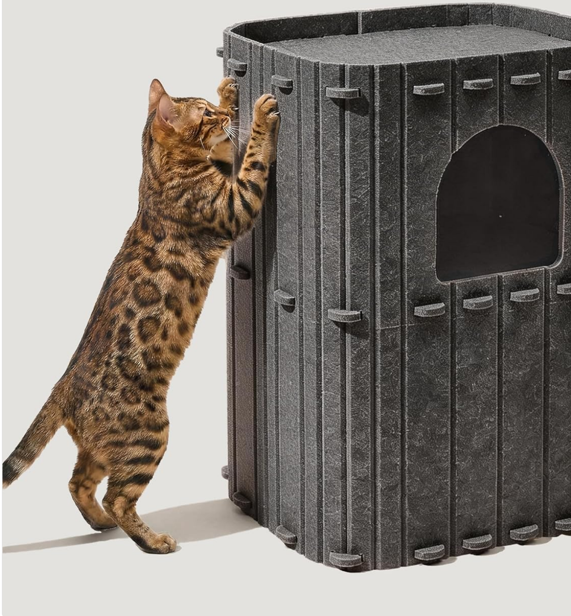
Image: A cat engaging with the felt surface of the FUKUMARU Cat Cave, highlighting its function as a scratching post.

Scratch-resistant felt, cat feels so right to scratch.