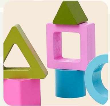
Non-toxic Water Paint