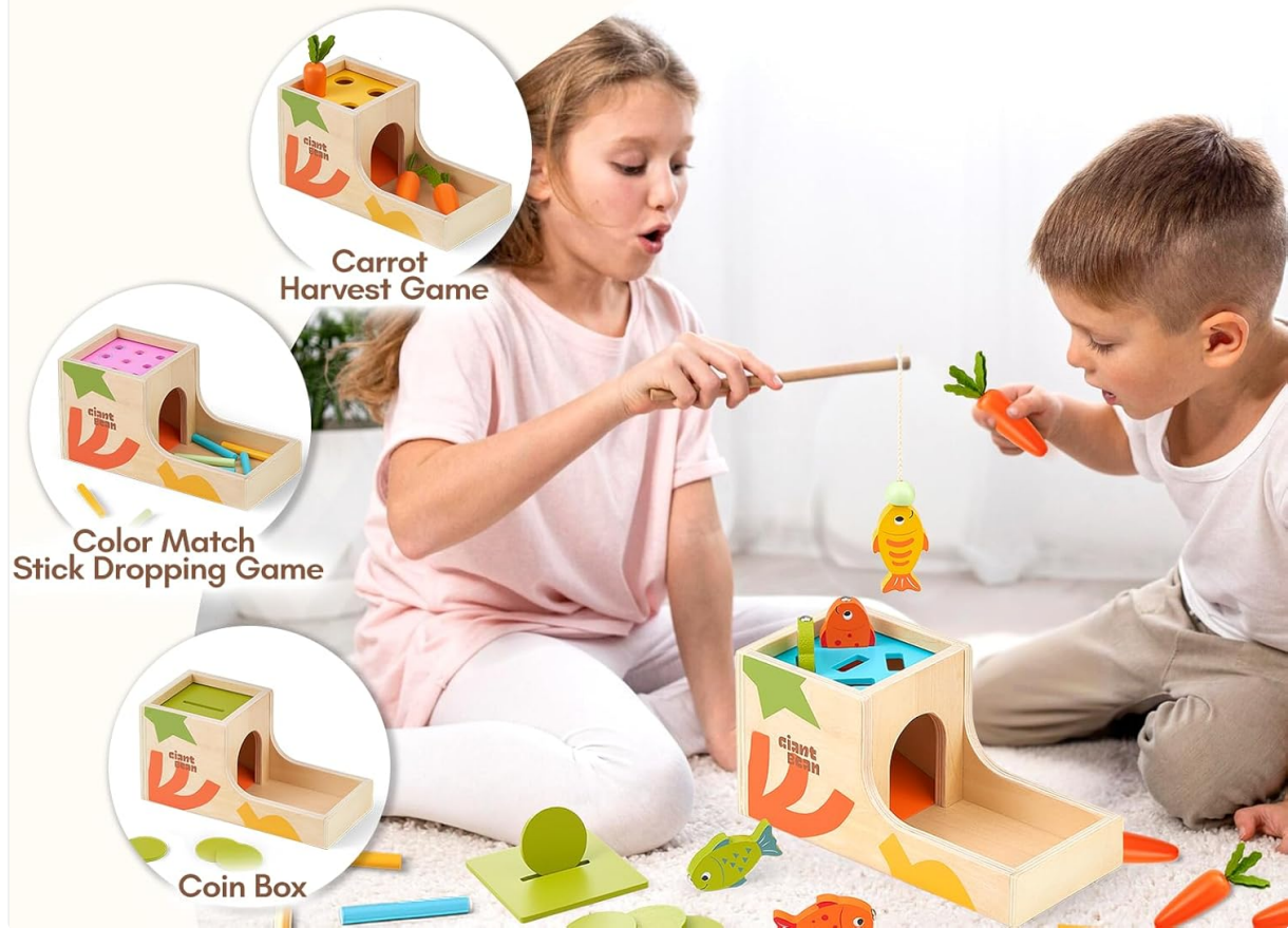
Image: A child engaged with the magnetic fishing game, with insets showing the carrot harvest and stick dropping activities of the Explore Box.

Develops hand-eye coordination, fine motor skills and concentration.