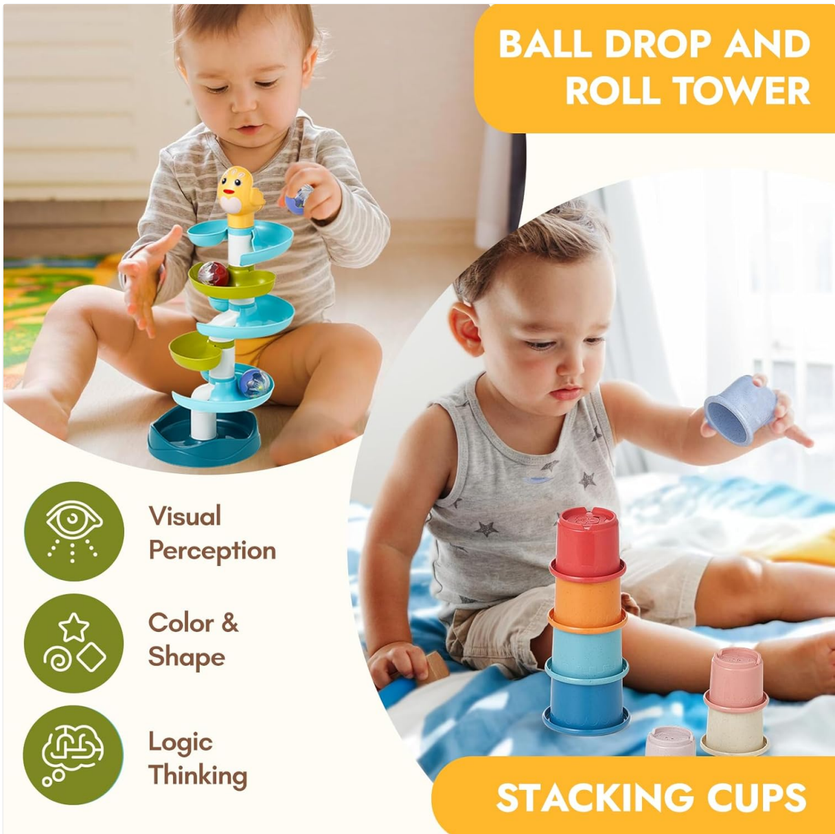
Image: A baby playing with the ball drop tower and another baby stacking cups, illustrating the development of visual perception, color and shape recognition, and logical thinking.