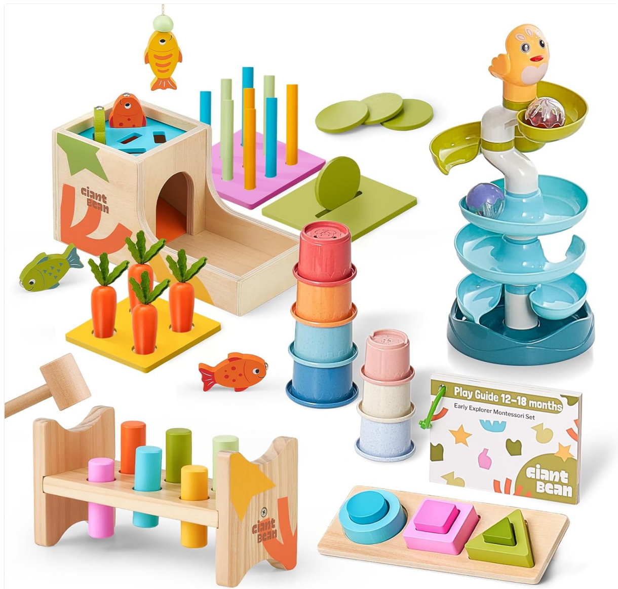
Image: The complete Giant bean 8-in-1 Wooden Montessori Toys Set, showcasing all included components such as the ball drop tower, hammering bench, shape sorter, stacking cups, and the explore box with fishing and carrot harvest games.