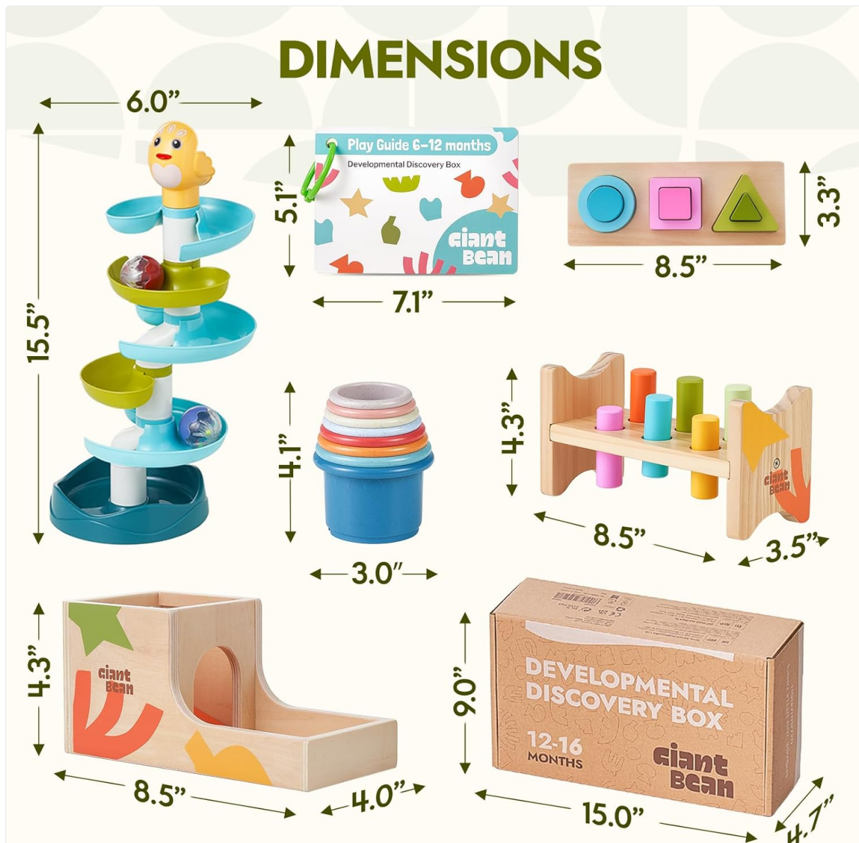
Image: Detailed dimensions for the various toy components, including the ball drop tower, stacking cups, hammering bench, shape sorter, and the explore box.