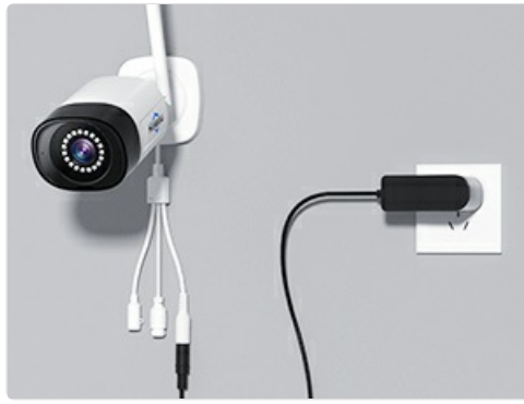
Image: Overview of the Hiseeu security camera system components.