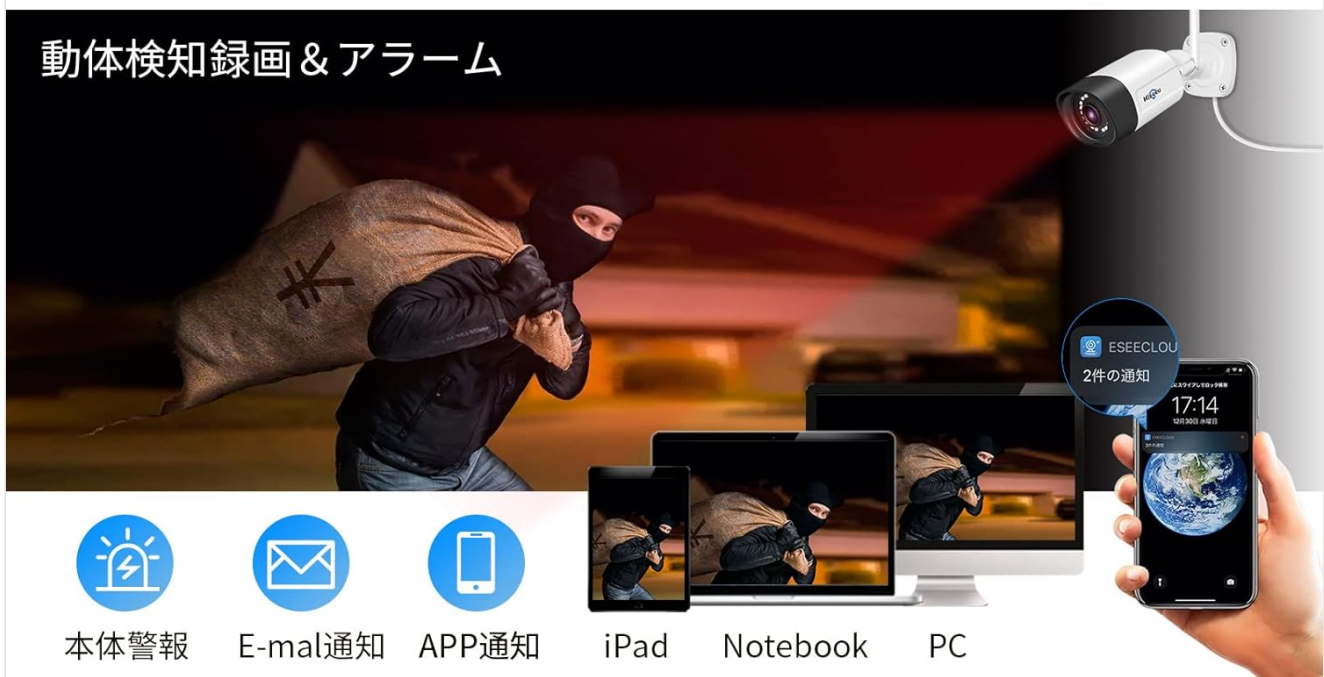
Image: Illustrates various recording modes (continuous, scheduled, motion detection) and alarm notifications for motion events.