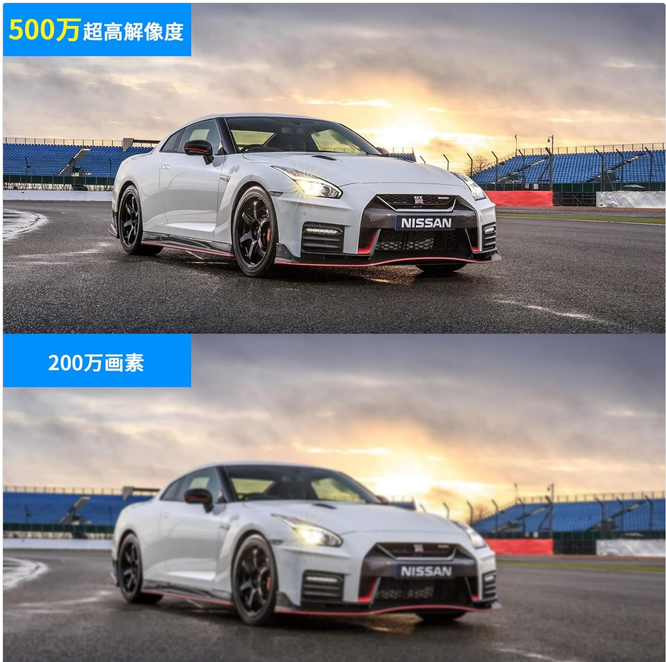
Image: Comparison of 5MP ultra-high-definition image quality versus lower resolution, highlighting clarity.