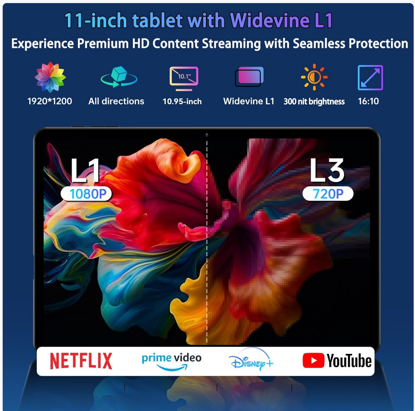
Image 4.4: Widevine L1 certification ensures high-definition streaming.

connection for optimal streaming quality.