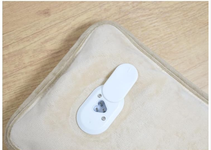
2.Turn on the charger port