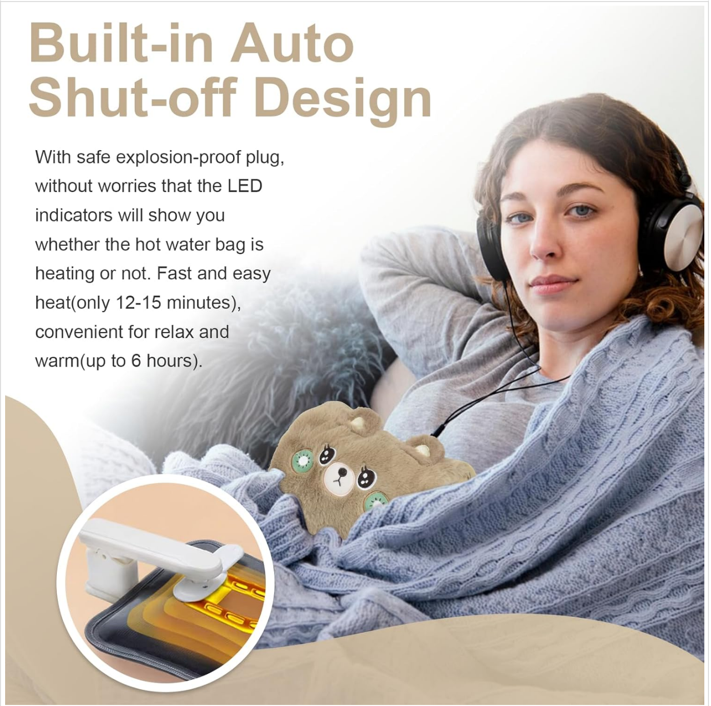
Image showing a person relaxing with the hot water bag, with an inset highlighting the internal heating element and automatic shut-off feature for safety.

With safe explosion-proof plug, without worries that the LED indicators will show you whether the hot water bag is heating or not. Fast and easy heat(only 12-15 minutes), convenient for relax and warm(up to 6 hours).