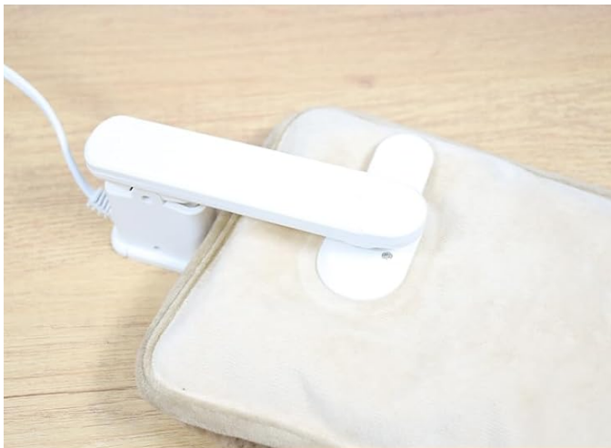
3.Connect to Charging Port