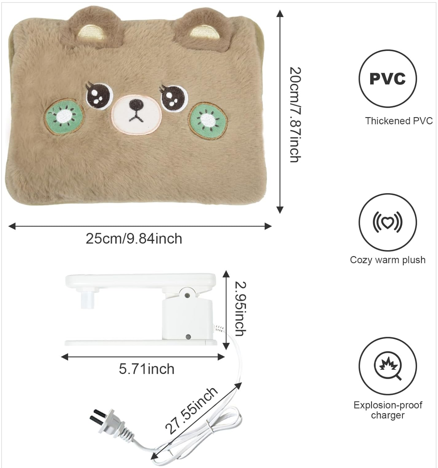
Image showing the dimensions of the hot water bag and charger, highlighting key features like thickened PVC, cozy warm plush, and explosion-proof charger.