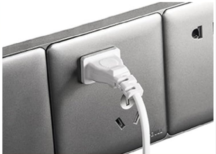
4.Plug in the Adaptor,Heat for 8-12 Minutes

A four-panel image demonstrating the quick and easy heating process: 1. Place on a flat surface, 2. Turn on the charger port, 3. Connect to charging port, 4. Plug into adapter and heat for 8-12 minutes.