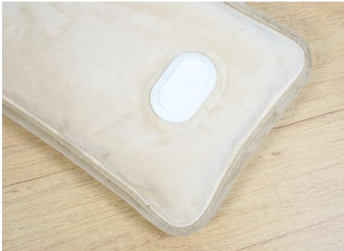
1.Place On a Flat Surface

No need to boil, microwave or refill water. Simple preparations can save time&energy, which is a practical alternative to the traditional hot water bottle