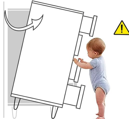
Figure 1: Anti-Tipping Fittings. This image illustrates the importance of installing the anti-tipping device to secure the dresser to the wall, preventing accidental tipping. It shows a diagram of the device and a comparison of a dresser with and without the device, highlighting the risk of tipping without proper installation.