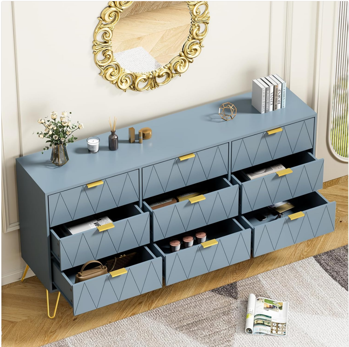
Figure 3: Spacious Storage. This image displays the dresser with multiple drawers pulled open, showcasing the ample storage space available for various items such as clothing, accessories, and personal belongings. It highlights the practical utility of the nine deep drawers.