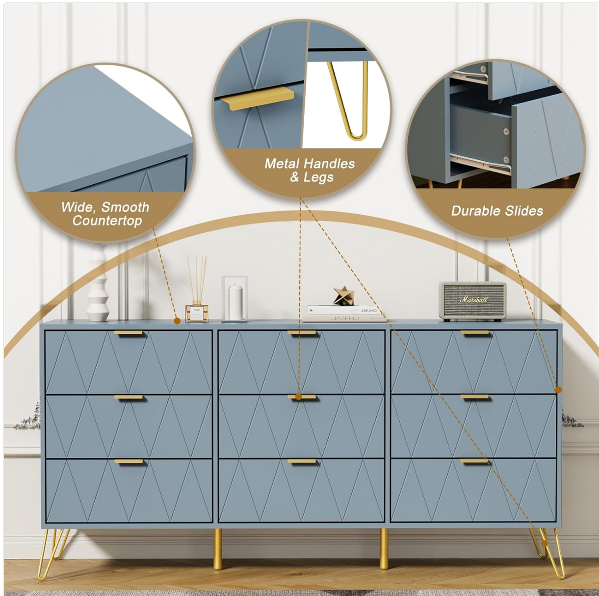
Figure 4: Key Features. This image highlights the dresser's design elements, including the wide and smooth countertop, the durable metal handles and legs, and the robust drawer slides, all contributing to the product's functionality and ease of maintenance.