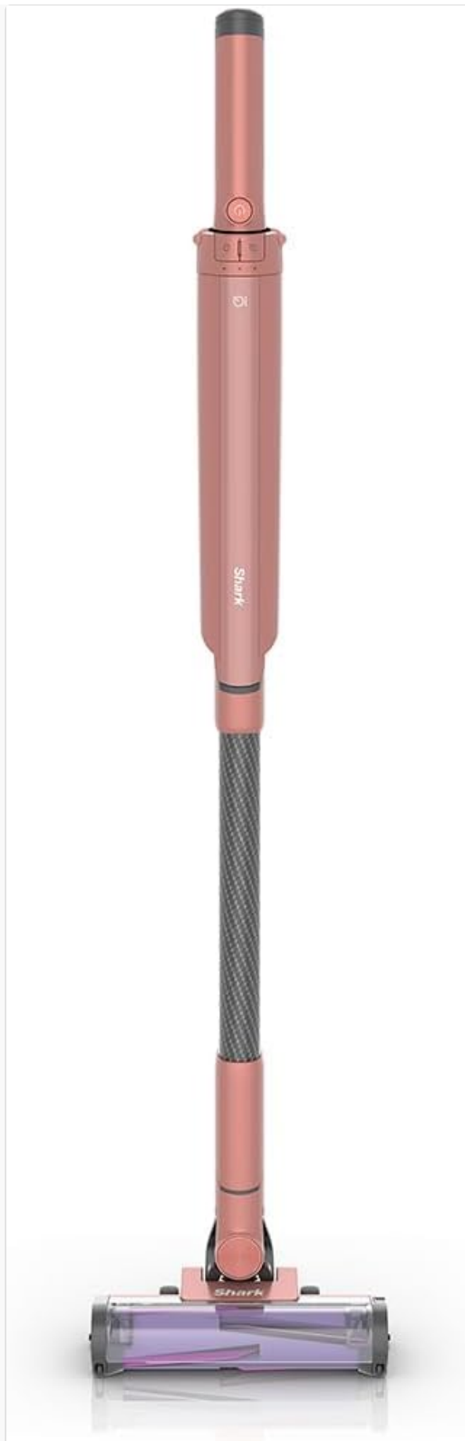
Figure 2.1: Shark EVOPOWER SYSTEM NEOII LC400JOR Cordless Stick Vacuum Cleaner (Light Terracotta variant).