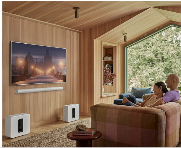
Image: A living room setup featuring two Sonos Sub 4 subwoofers and a Sonos soundbar, illustrating a dual subwoofer configuration for enhanced audio.

Pair two subwoofers with Arc Ultra for bass so deep and sound so immersive, you'll forget you're at home and not in an actual theater.