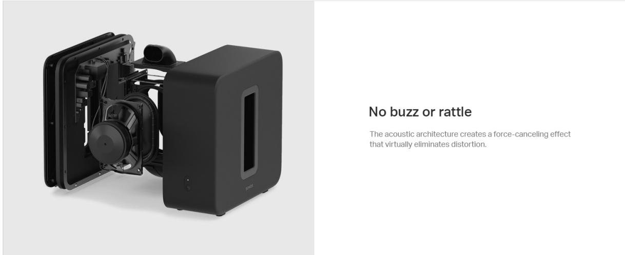
Image: An internal diagram of the Sonos Sub 4, highlighting the force-canceling acoustic architecture designed to eliminate distortion and rattle.