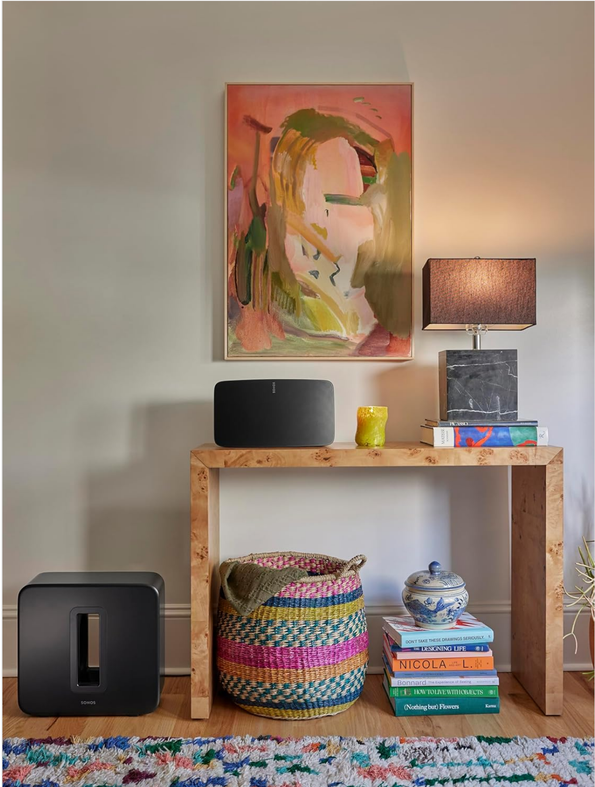
Image: The Sonos Sub 4 positioned vertically next to a sofa in a living room setting, demonstrating flexible placement.