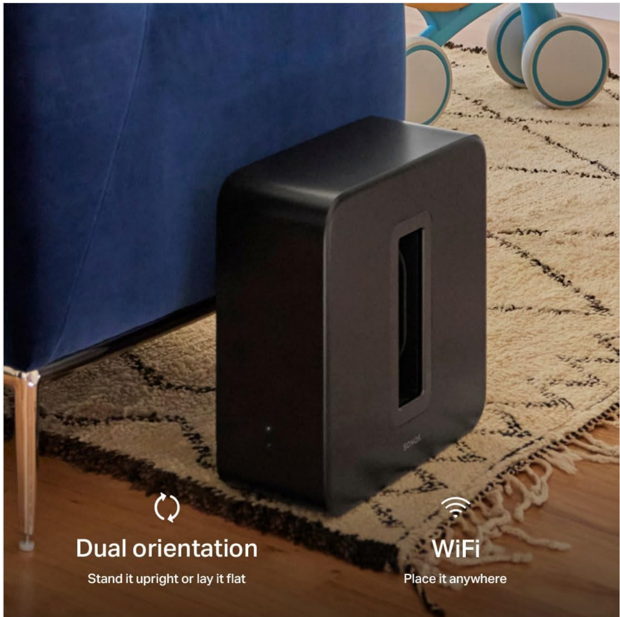
Image: The Sonos Sub 4 showing its dimensions: 15.3 inches high, 6.2 inches deep, and 15.8 inches wide.