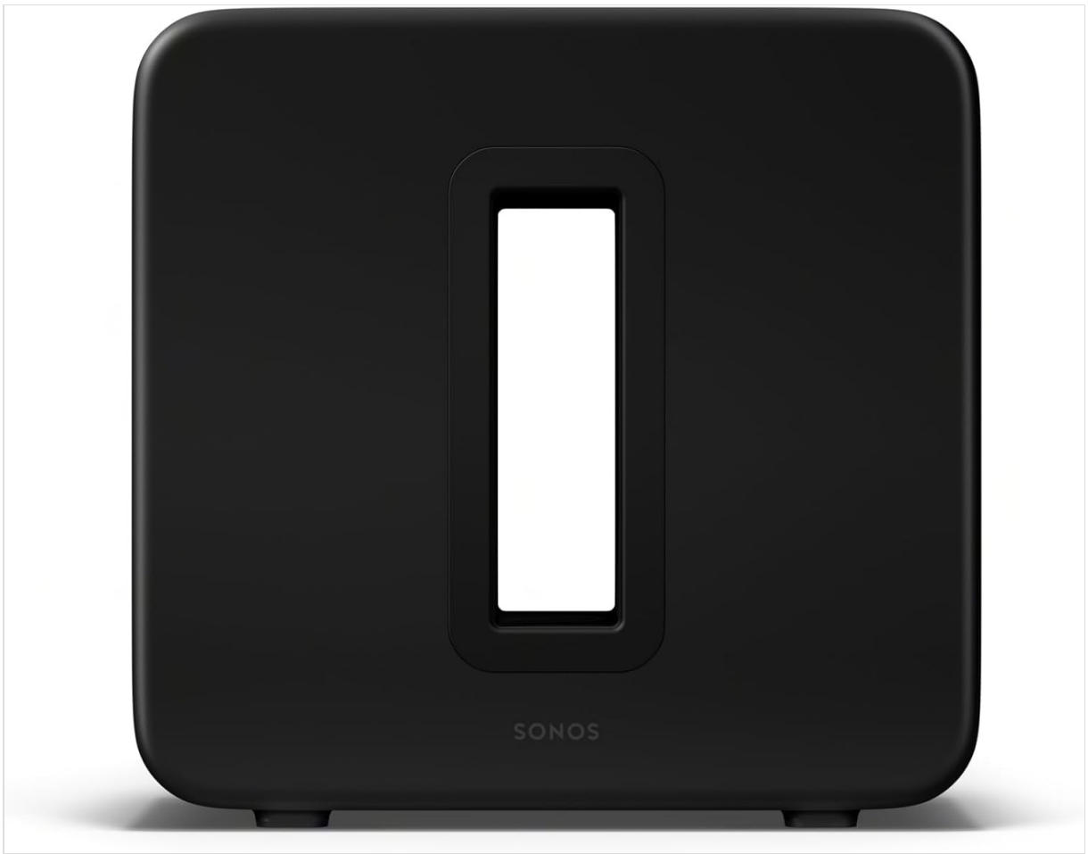
Image: Front view of the Sonos Sub 4 wireless subwoofer in black.