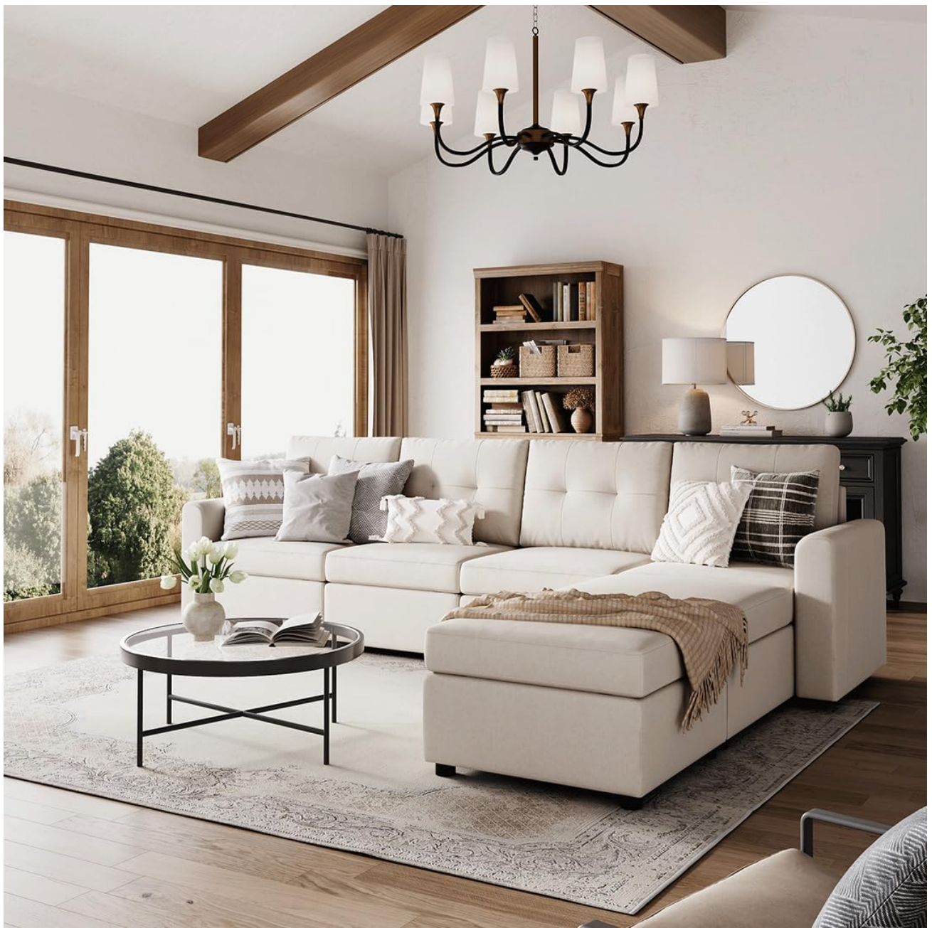
Image 1.1: The LINSY HOME Rubik III Modular Sectional Sofa arranged in an L-shape configuration within a living room.