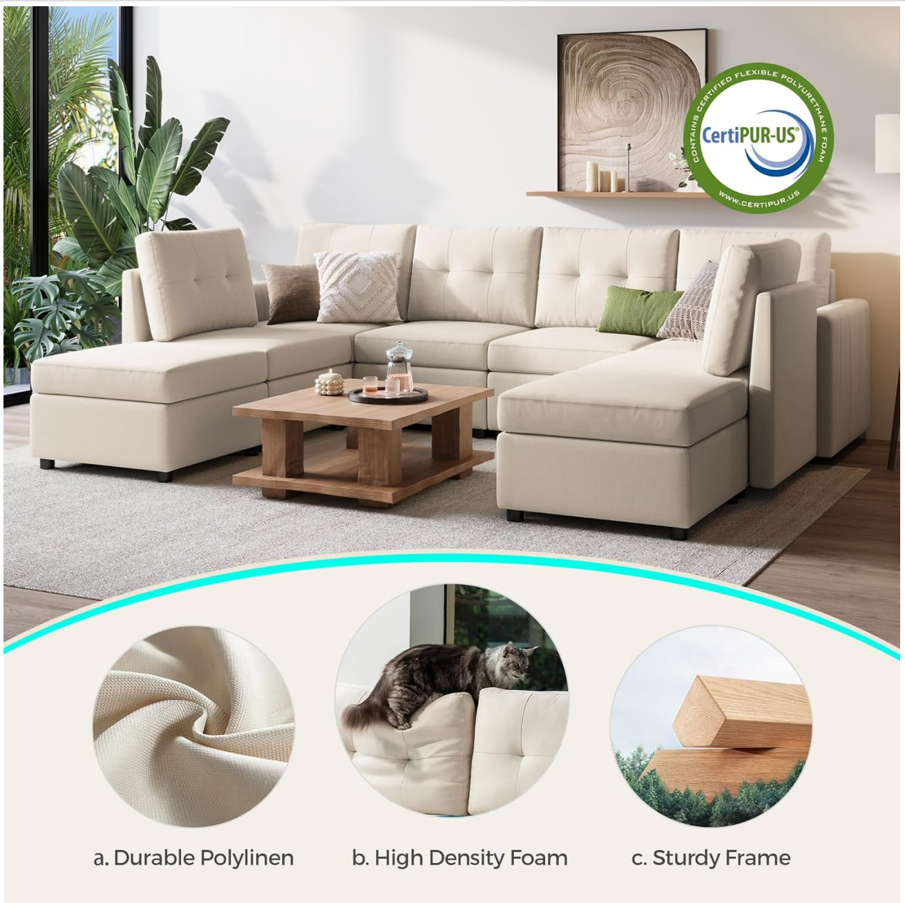
Image 8.1: Details on the materials used in the sofa construction, including durable polylinen fabric, high-density foam, and a sturdy wood frame.