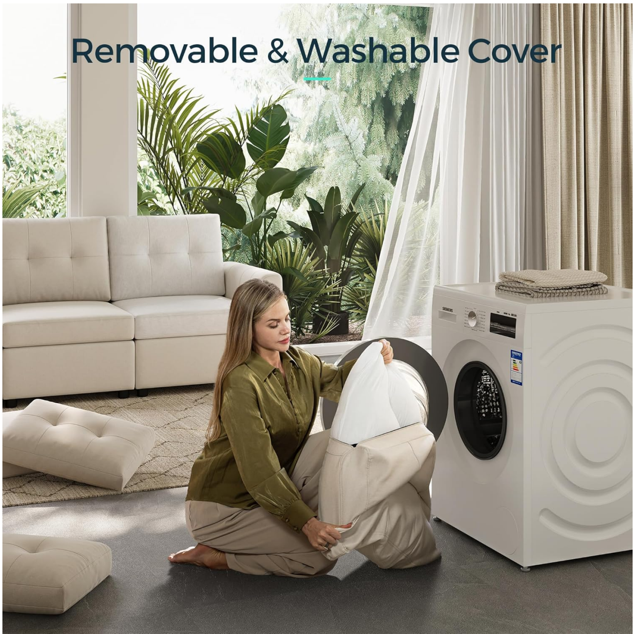
Image 6.1: Demonstration of removing a sofa cover for machine washing.