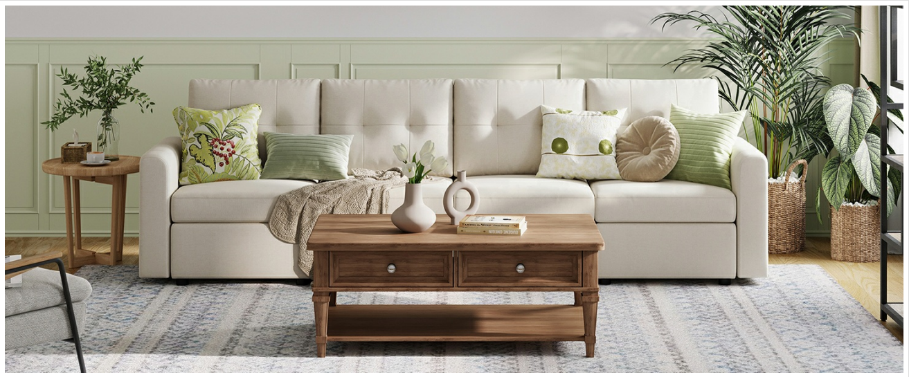
Image 5.1: Examples of different sofa configurations possible with the modular design.