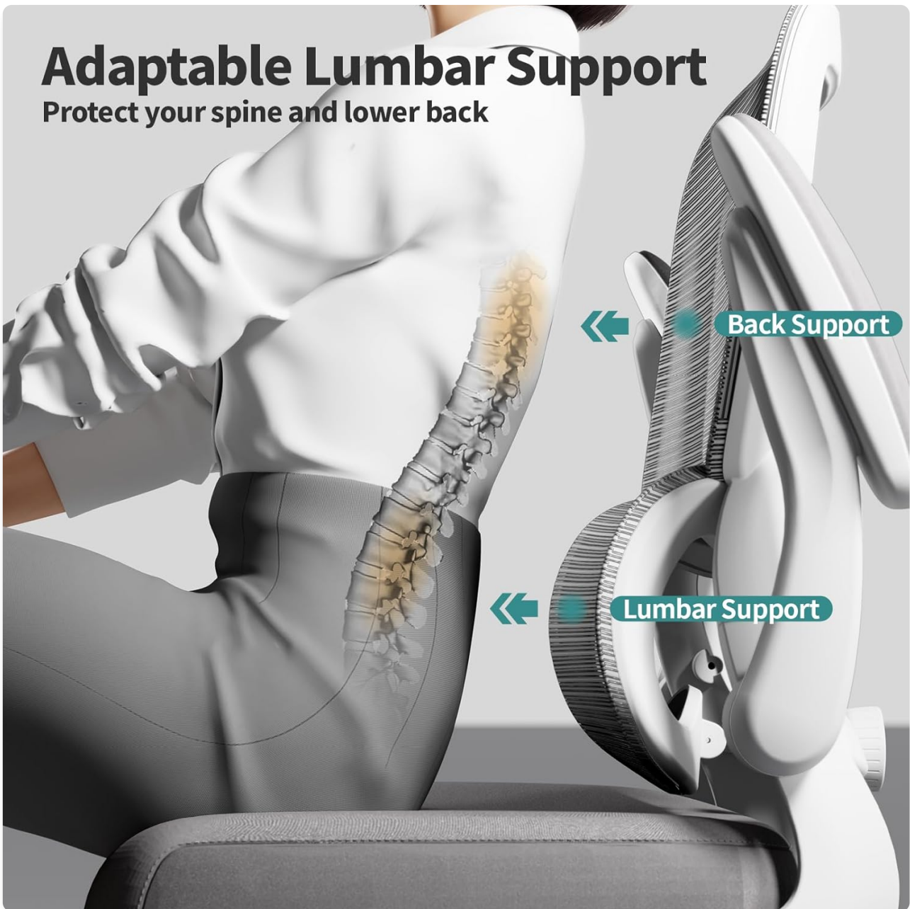
Figure 2: Adjustable lumbar support for personalized back comfort.

The chair features adaptable lumbar support to protect your spine and lower back. Adjust the lumbar support by turning the knob located on the side of the backrest. Turn the knob clockwise to increase the lumbar curve (pushing it forward) and counter-clockwise to decrease it (pulling it back). Adjust until you find your preferred level of support.