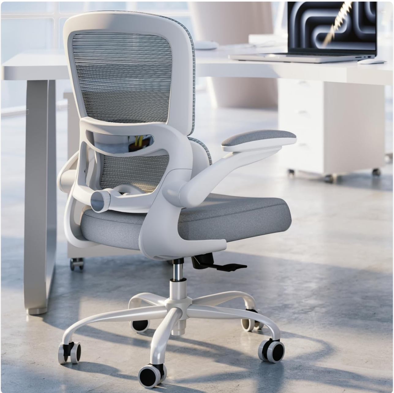
Figure 1: Key components of the TRALT Office Chair, including the base, gas lift, and silent wheels.

No seller-provided assembly videos were available for direct embedding based on the provided data.