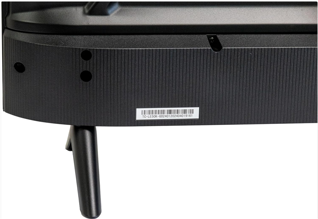
Figure 8: Model number label on the TV.