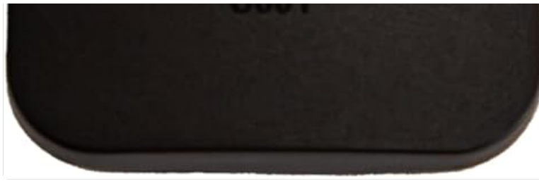
Figure 3: Remote control for the RCA 50-Inch UHD Smart Google TV.