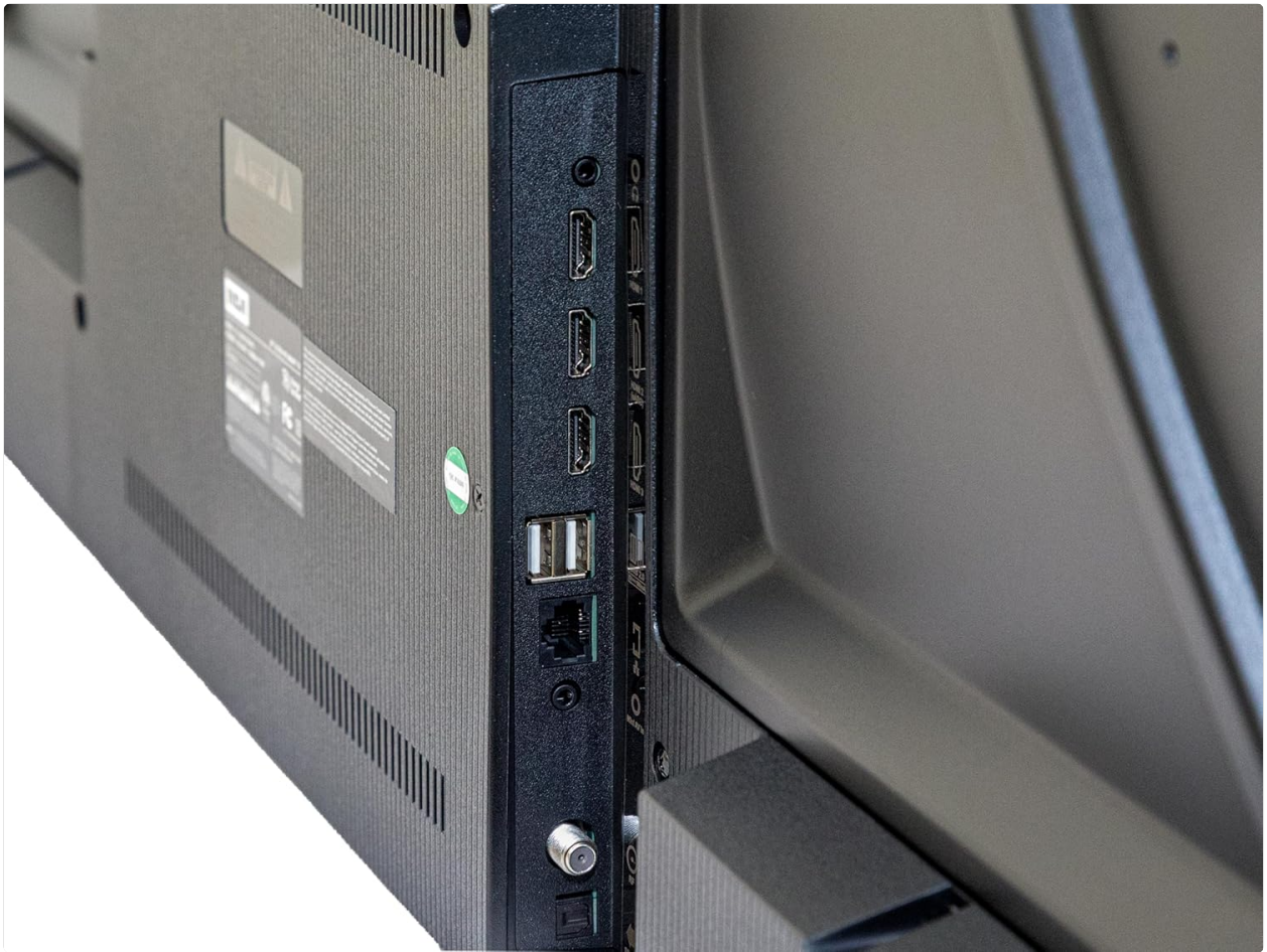
Figure 4: Connectivity ports on the RCA 50-Inch UHD Smart Google TV.