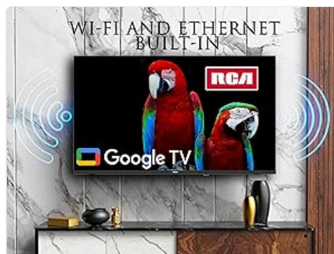
Figure 5: The TV supports Wi-Fi and Ethernet for network connectivity.