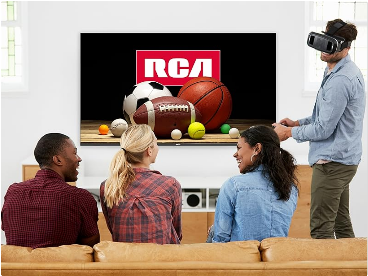
Figure 6: The wide viewing angle ensures a clear picture for group viewing.