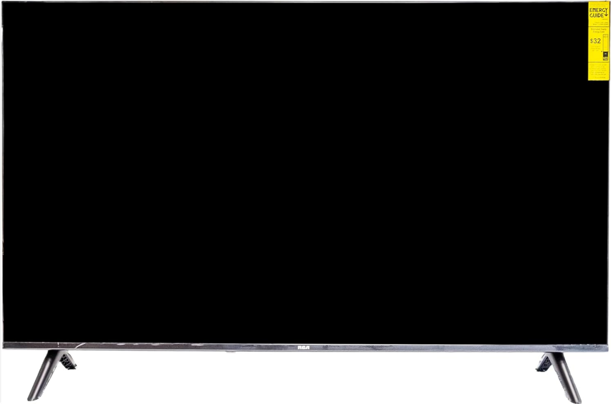
Figure 7: The TV's energy guide sticker, indicating its energy efficiency.