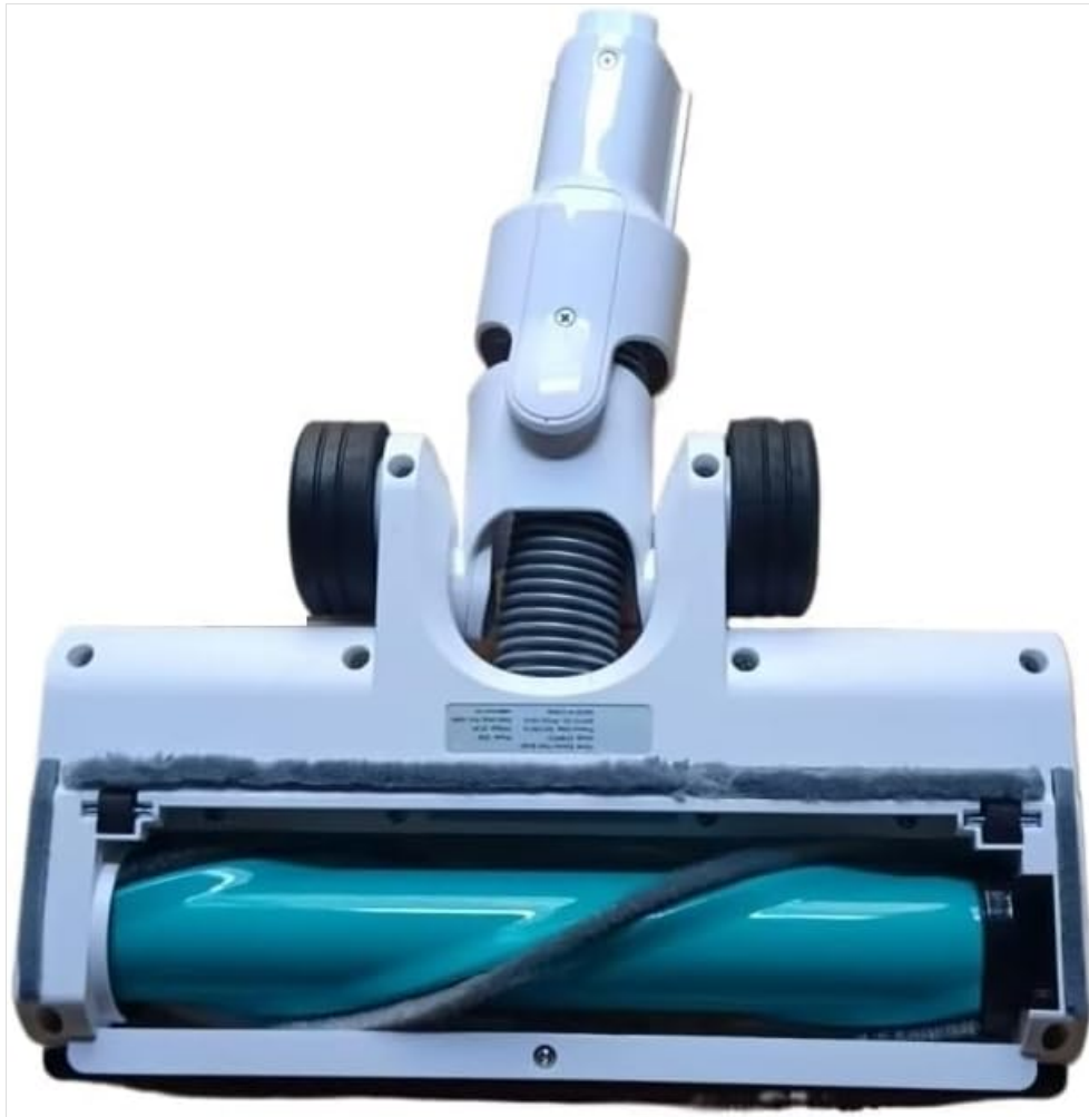
Figure 4: Underside view of the motorized floor brush head. This image clearly displays the teal-colored roller brush and the soft brush strips designed for efficient debris collection.