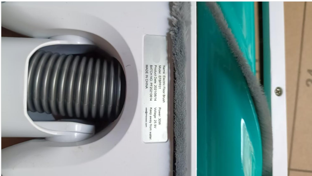
Figure 5: Product label on the brush head. This image shows a label with technical details such as "Name: Electric Floor Brush", "Model: EFBPF01", "Power: 30W", and "Voltage: 25.9V".