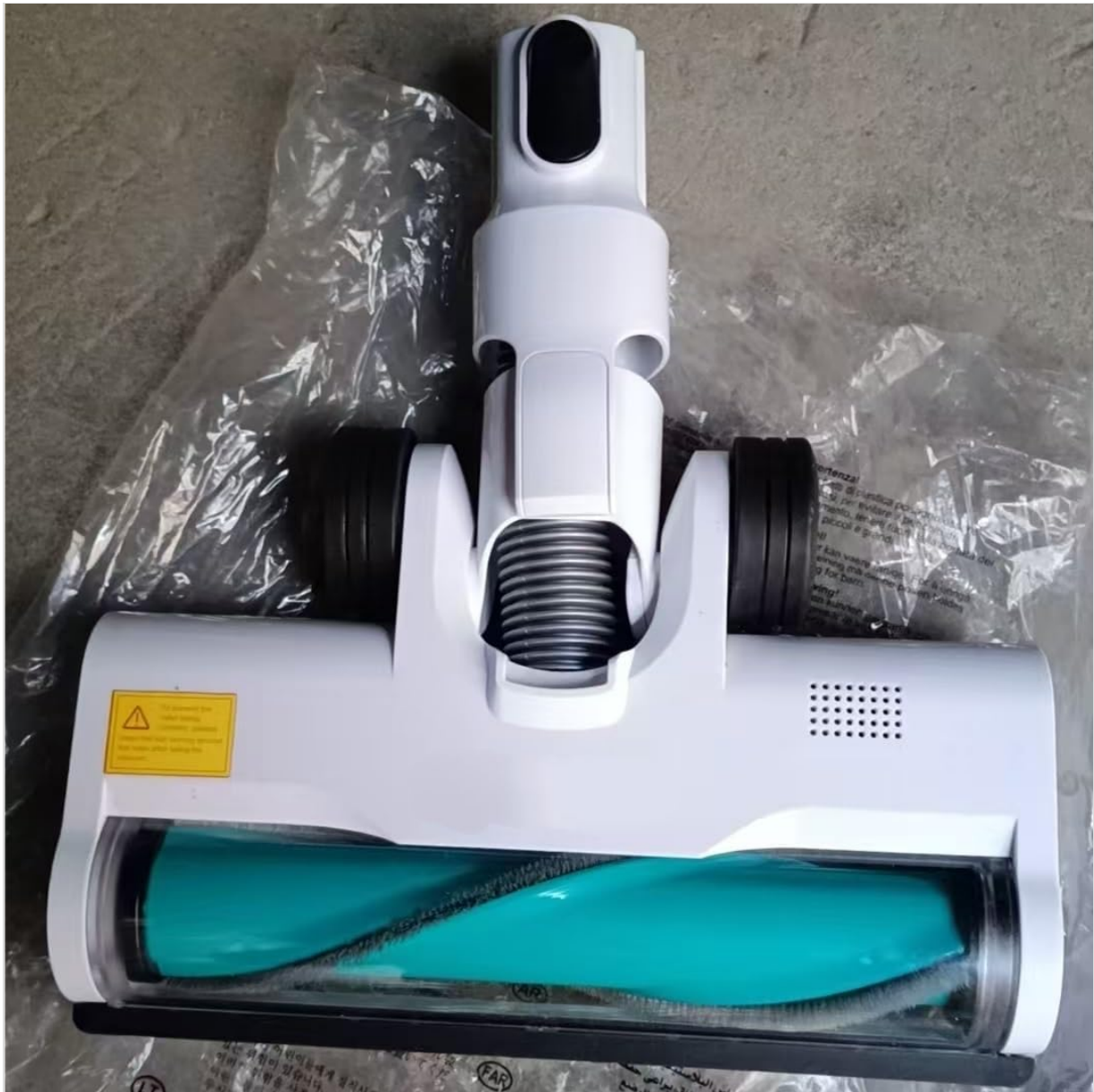
Figure 1: Motorized Floor Brush Head as received in packaging. This image shows the brush head enclosed in a clear plastic bag, highlighting its new condition.