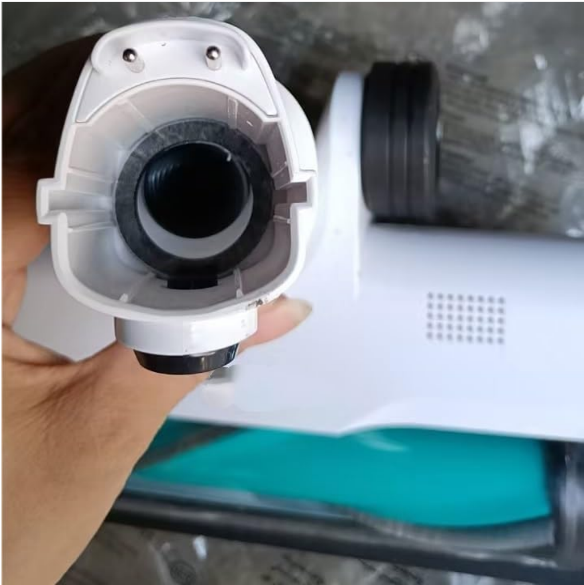
Figure 2: Detailed view of the brush head's connection mechanism. This image illustrates the circular opening and electrical contacts where the brush head connects to the vacuum's main body or extension wand.