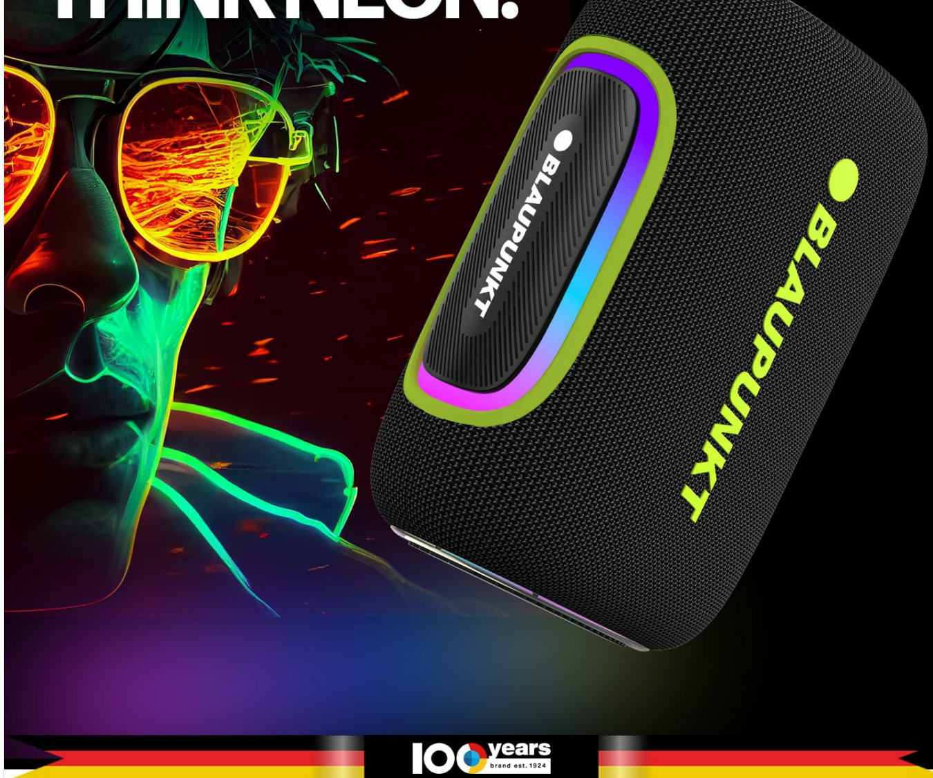
Image: Rear view of the Blaupunkt ATOMIK OMG speaker, displaying the protective flap covering the input ports. These ports typically include USB, TF card slot, AUX-in, and charging port.