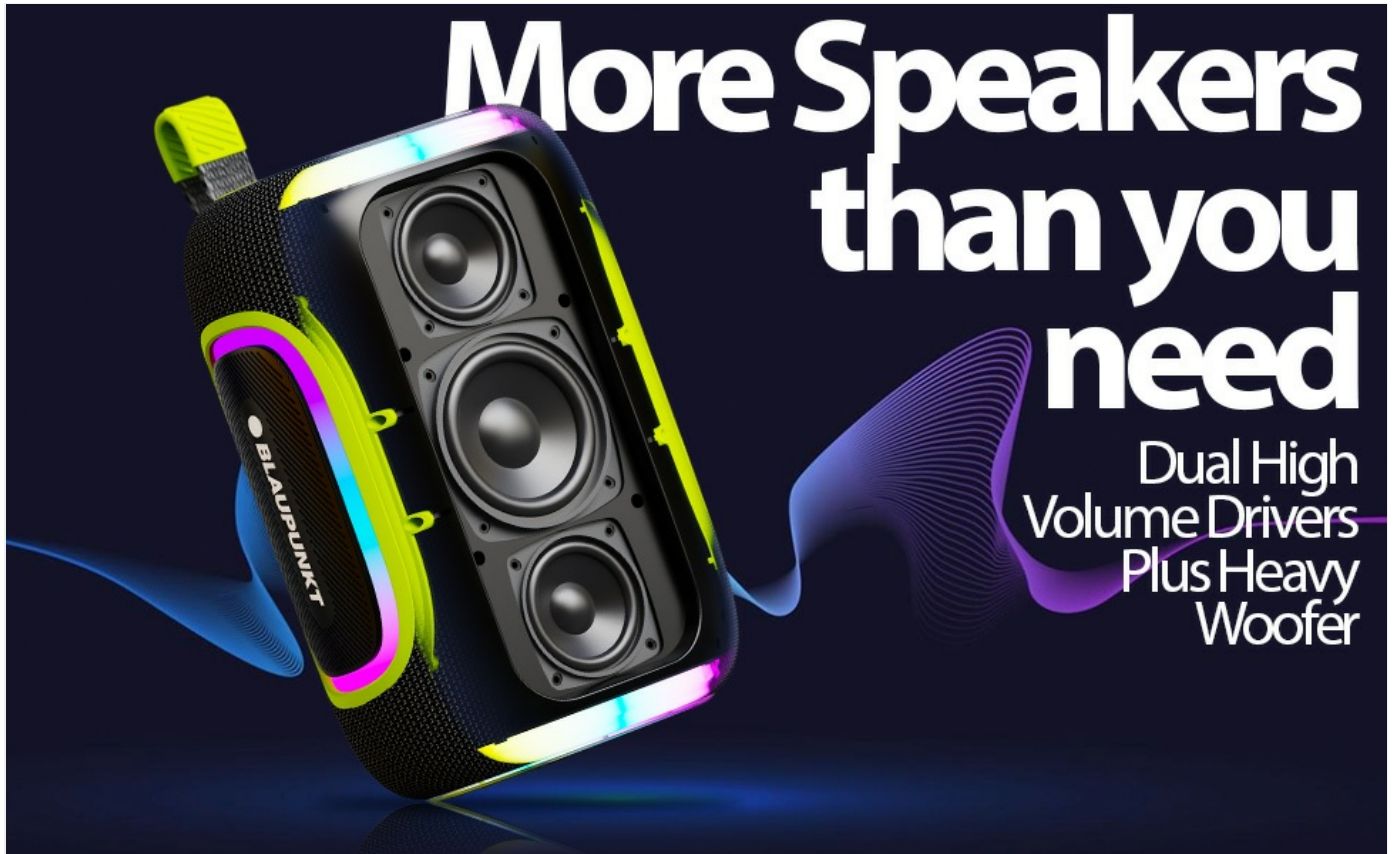
Image: The Blaupunkt ATOMIK OMG speaker, illustrating its quad 1800mAh batteries for extended playtime.