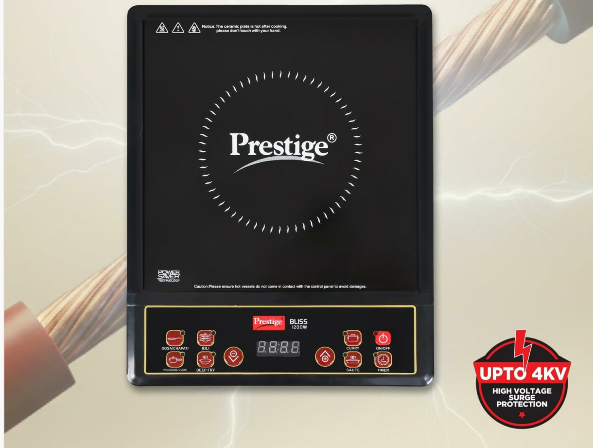
Image 3: The cooktop demonstrating its safety, stability, and reliability, featuring an automatic voltage regulator that protects against sudden power fluctuations and up to 4KV high voltage surge protection.

Automatic voltage regulator protects against sudden power fluctuations for long-lasting performance