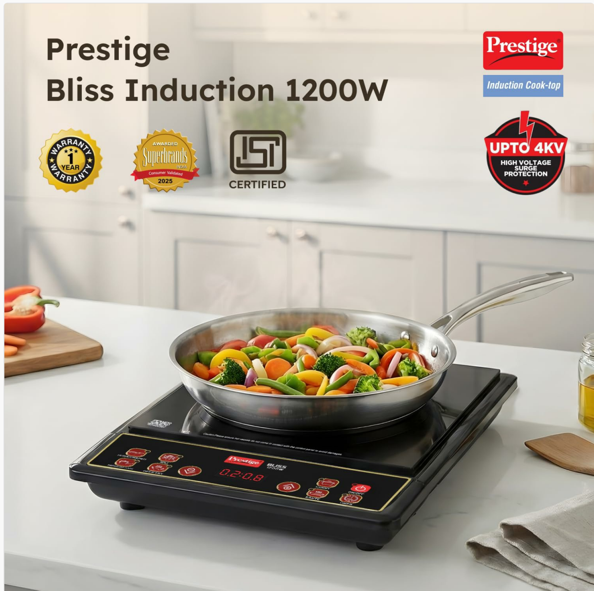
Image 1: The Prestige Induction Cooktop -Bliss 1200 W in operation, showcasing its design and key features like 1-year warranty, Superbrands award, ISI certification, and 4KV high voltage surge protection.

The Prestige Induction Cooktop -Bliss 1200 W is designed for modern kitchens, offering a sleek design and smart performance. It features a ceramic cooking surface and an intuitive control panel.