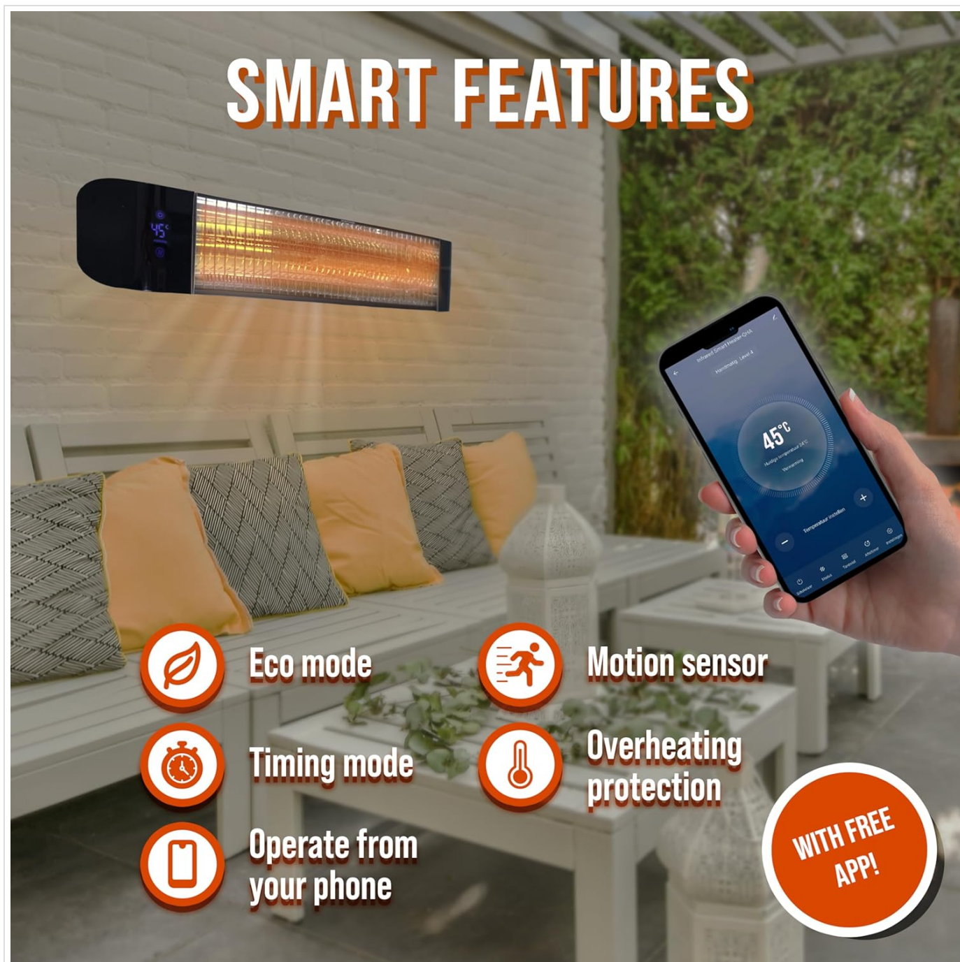
Image: An infographic titled 'SMART FEATURES' displays the heater mounted on a wall above a patio seating area, with a hand holding a smartphone showing the control app. Icons illustrate features like 'Eco mode', 'Timing mode', 'Operate from your phone', 'Motion sensor', and 'Overheating protection'. A 'WITH FREE APP!' badge is also visible.