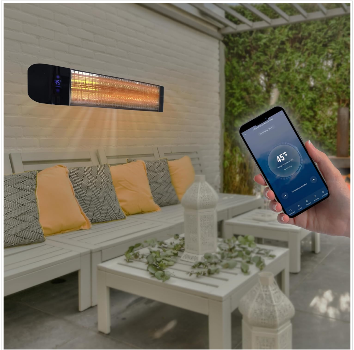
Image: The Silvergear patio heater is mounted on a wall, emitting a warm glow. In the foreground, a hand holds a smartphone displaying the heater's control app, showing a temperature of '45°C' and various control options.