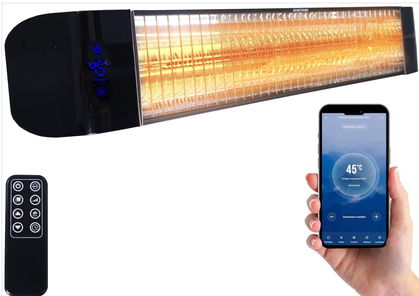
Image: The Silvergear 2400W Smart Infrared Patio Heater, a sleek black unit with an illuminated heating element, is shown alongside its remote control and a smartphone displaying the control app. The heater features a digital display showing '45°C'.

Thank you for choosing the Silvergear® 2400W Smart Infrared Patio Heater, model 4539. This manual provides essential information for the safe and efficient operation, installation, and maintenance of your new infrared heater. Please read this manual thoroughly before use and keep it for future reference.