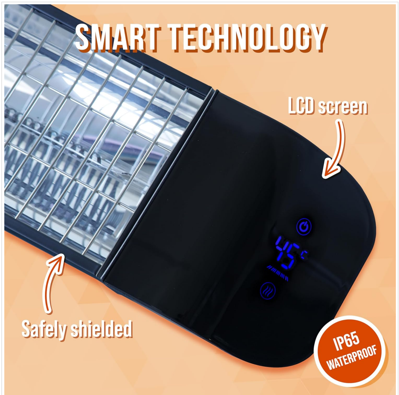
Image: A close-up view of the Silvergear patio heater highlights its LCD screen displaying '45°C' and the safely shielded heating element. An arrow points to the LCD screen, and another indicates the shielded area. A circular label confirms its IP65 waterproof rating.