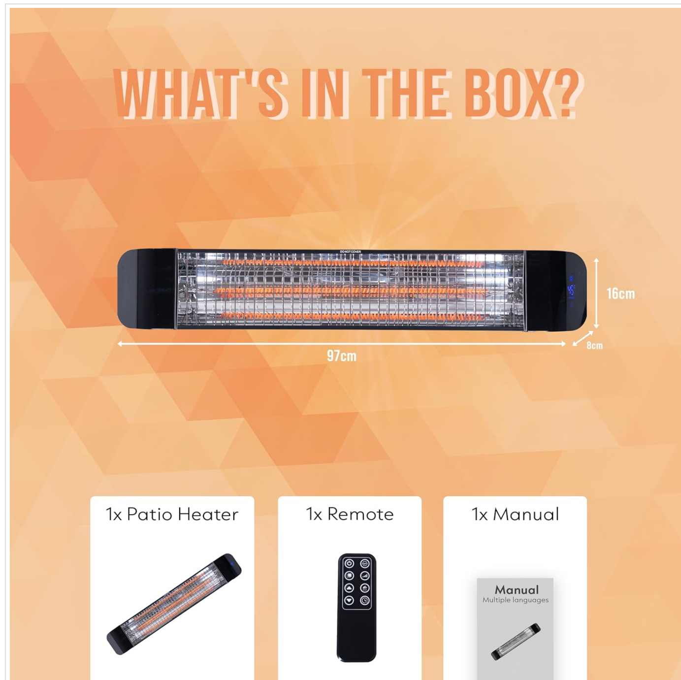
Image: A visual representation of the product's packaging contents. It shows the patio heater with dimensions (97cm length, 16cm height, 8cm depth), the remote control, and the user manual, labeled as '1x Patio Heater', '1x Remote', and '1x Manual' respectively.