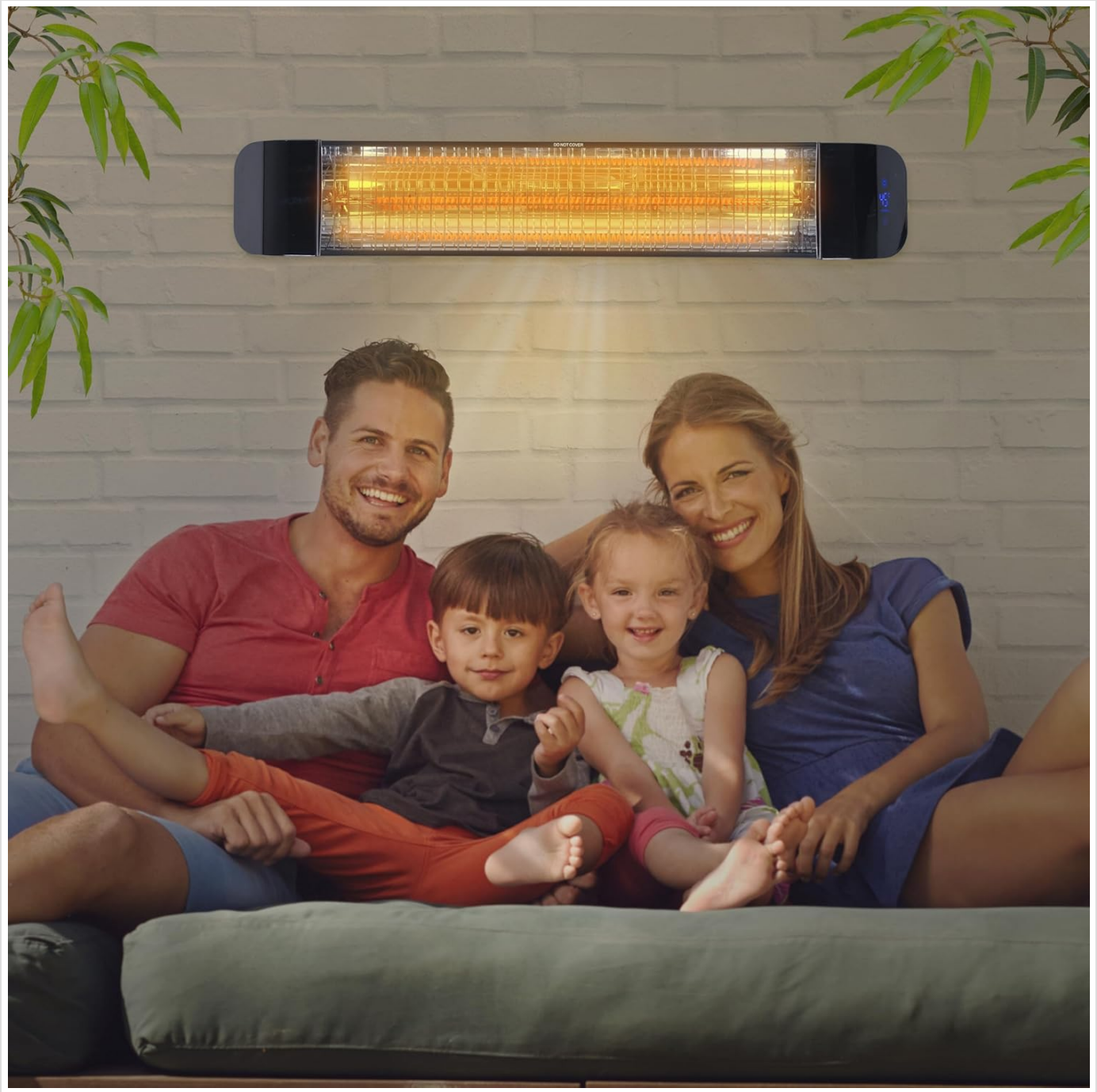
Image: The Silvergear patio heater is mounted on a white brick wall, providing warmth to a family seated on an outdoor sofa. The heater emits a warm glow, illuminating the patio area.

For detailed installation instructions, refer to the separate installation guide if provided, or consult a qualified electrician.