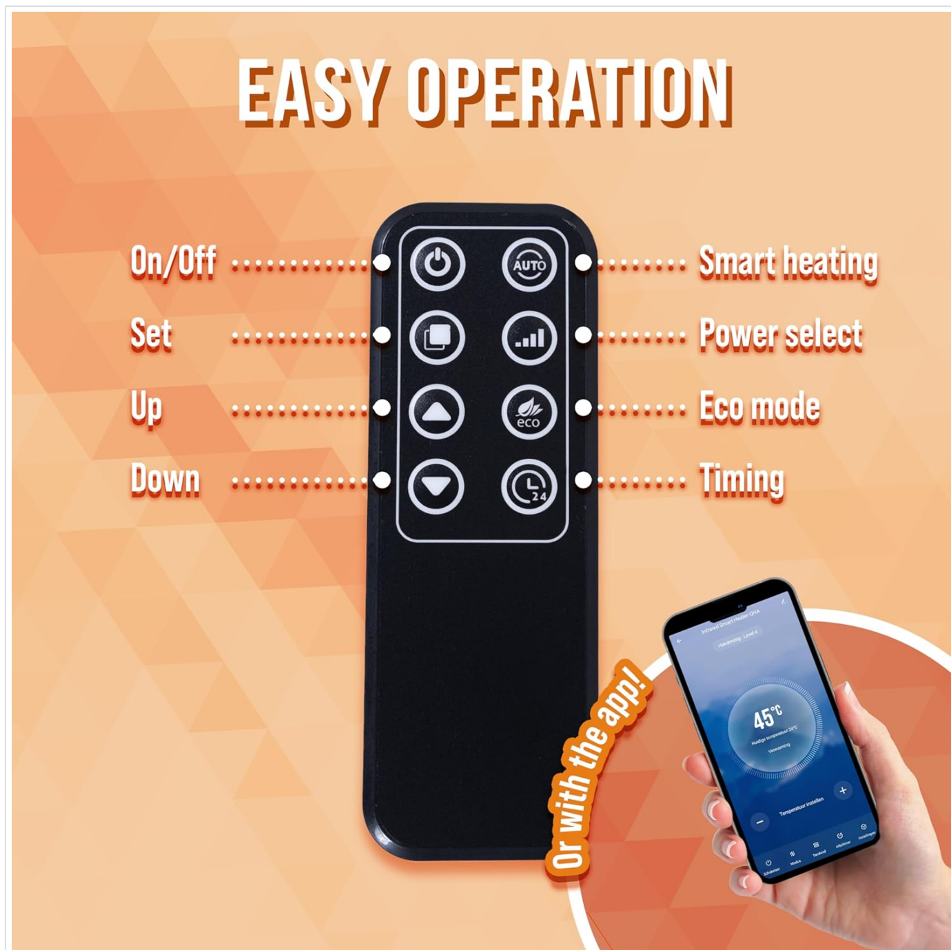
Image: A diagram illustrating the remote control's buttons and their corresponding functions, such as On/Off, Set, Up/Down, Smart heating, Power select, Eco mode, and Timing. A smartphone displaying the control app is also shown, indicating operation via app.