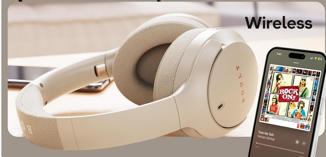
Image: Close-up of Boult Q headphones showing memory foam ear cushions, emphasizing comfort.