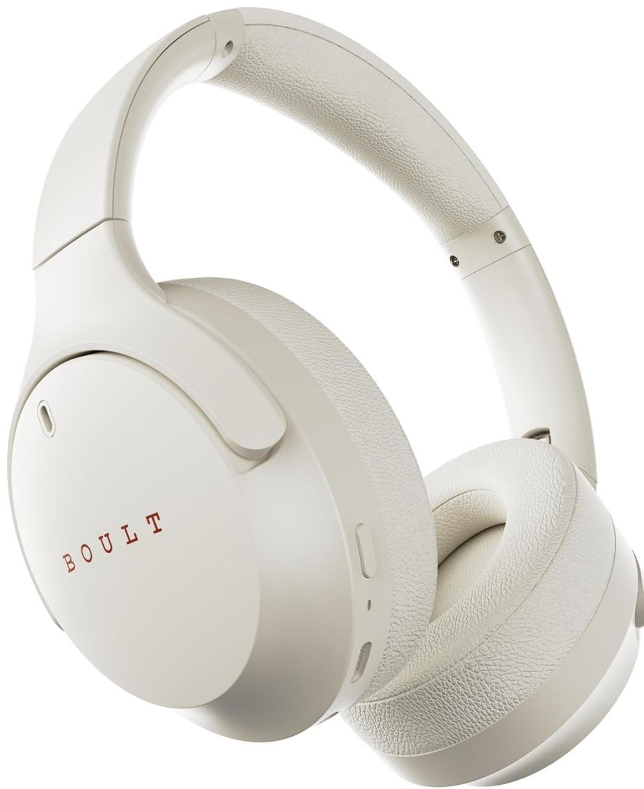
Image: Boult Q Over Ear Bluetooth Headphones in Beige, showcasing the sleek design and comfortable earcups.