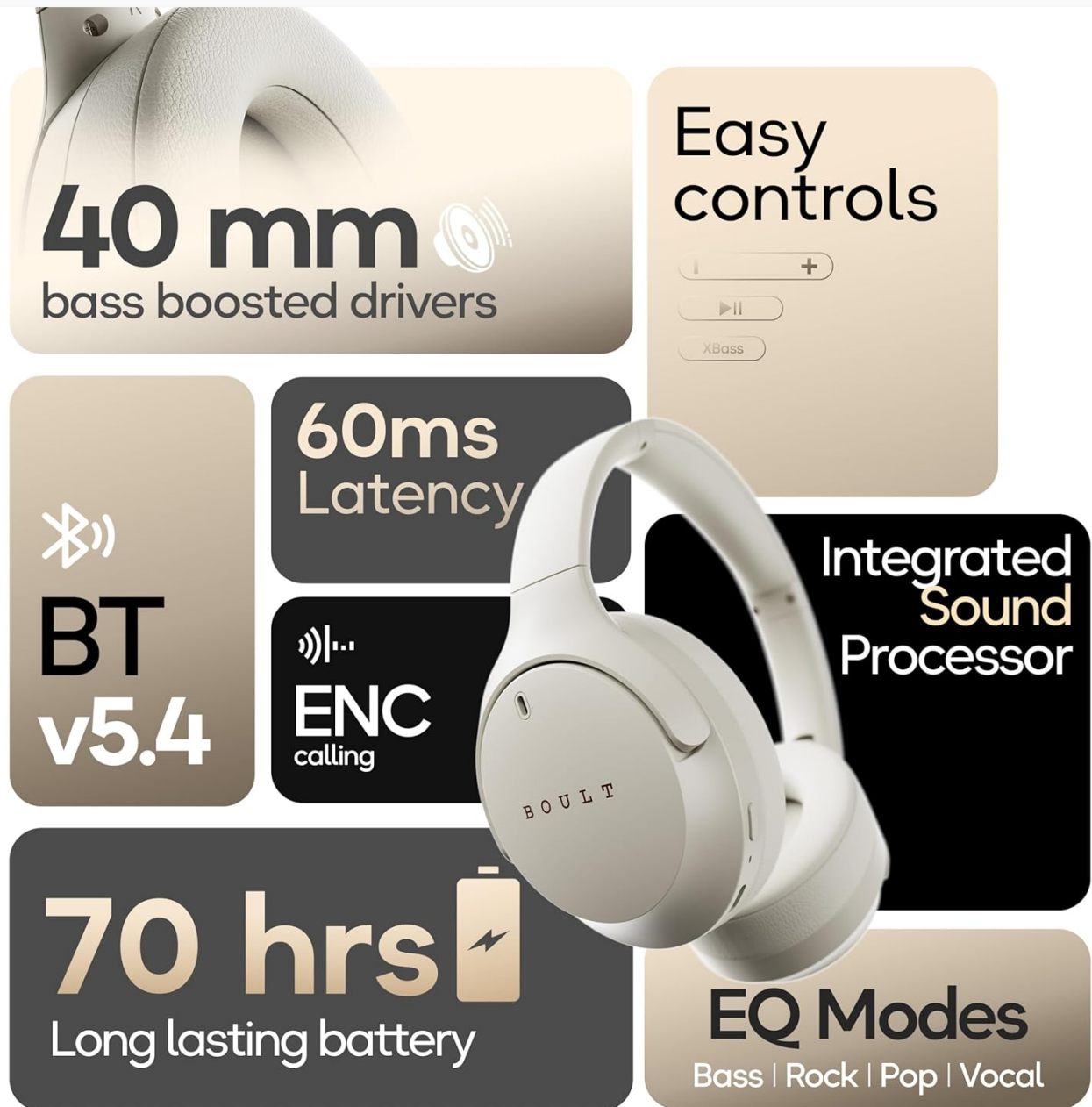
Image: An infographic highlighting key features of the Boult Q headphones, including 40mm bass drivers, BT v5.4, ENC calling, 70 hours battery, and EQ modes.