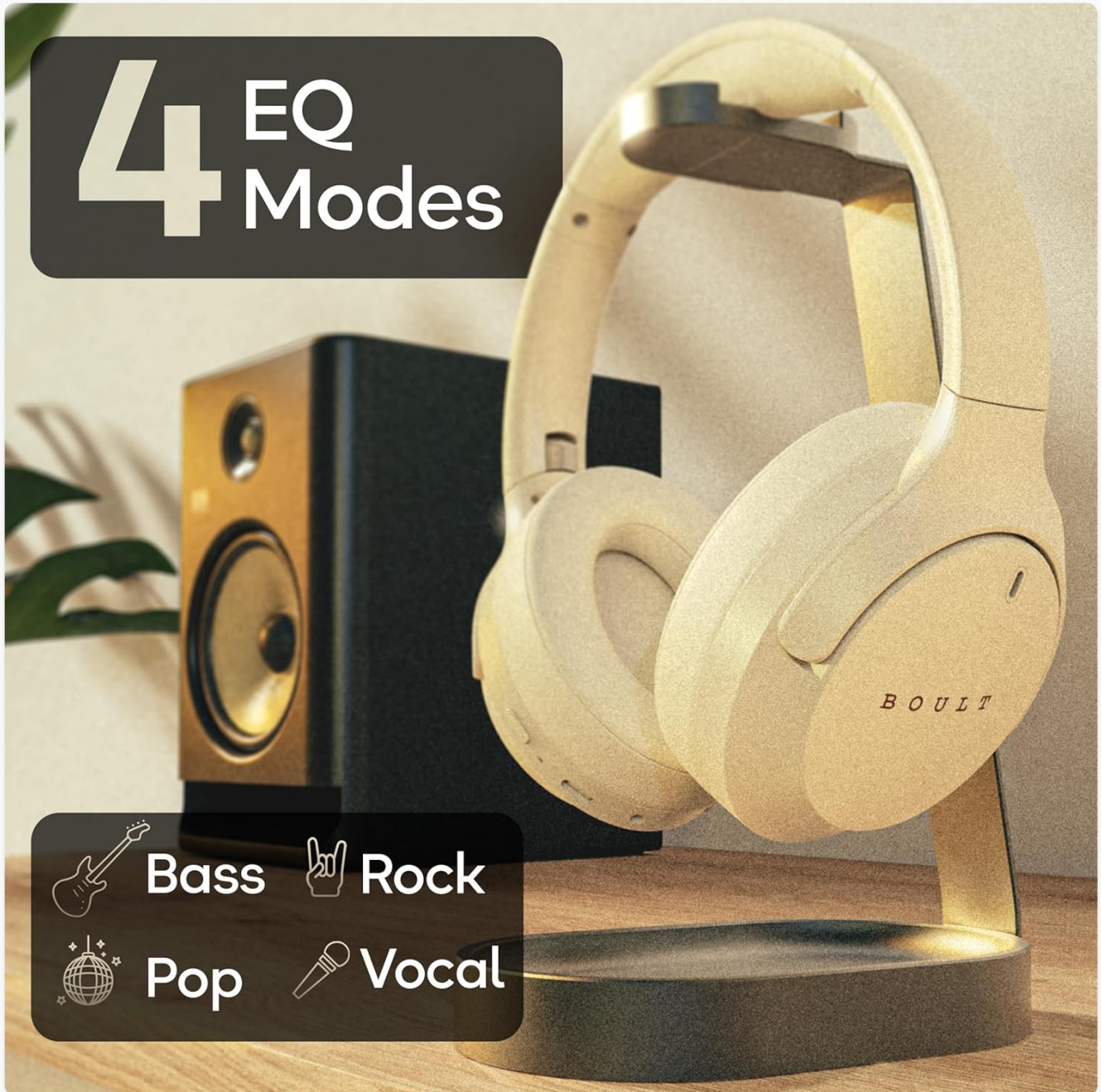
Image: Boult Q headphones illustrating the four available EQ modes: Bass, Rock, Pop, and Vocal.

Switch between modes using the dedicated EQ button.