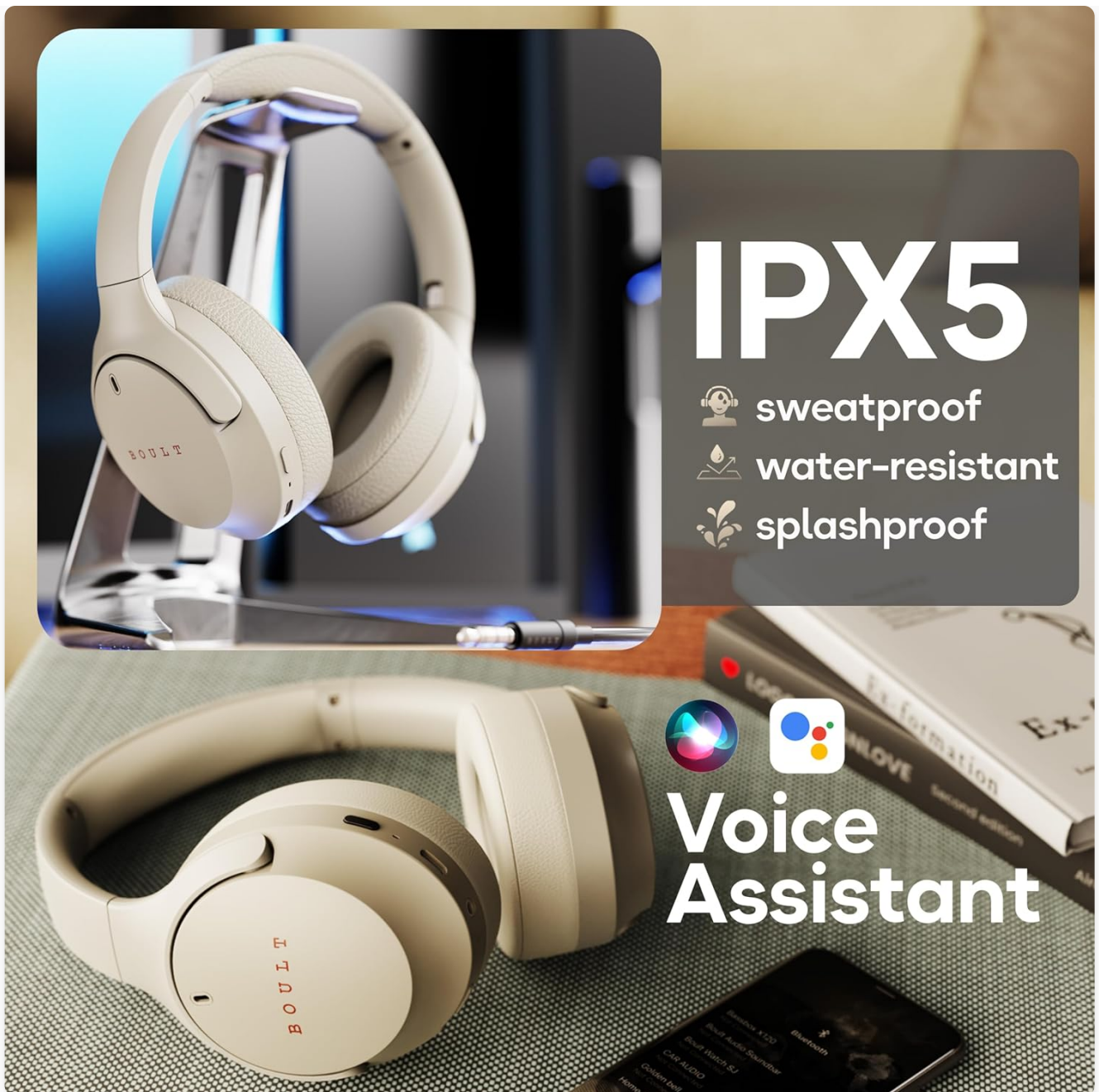
Image: Boulton Q headphones highlighting IPX5 rating for sweatproof, water-resistant, and splashproof protection, along with Voice Assistant compatibility.