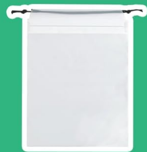
1 Storage Bag

Image: A visual representation of all items included in the QuTZ Talking Flash Cards package.