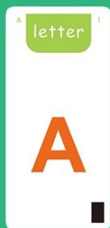
52 Letter Cards