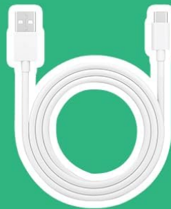
1 Type C Cable