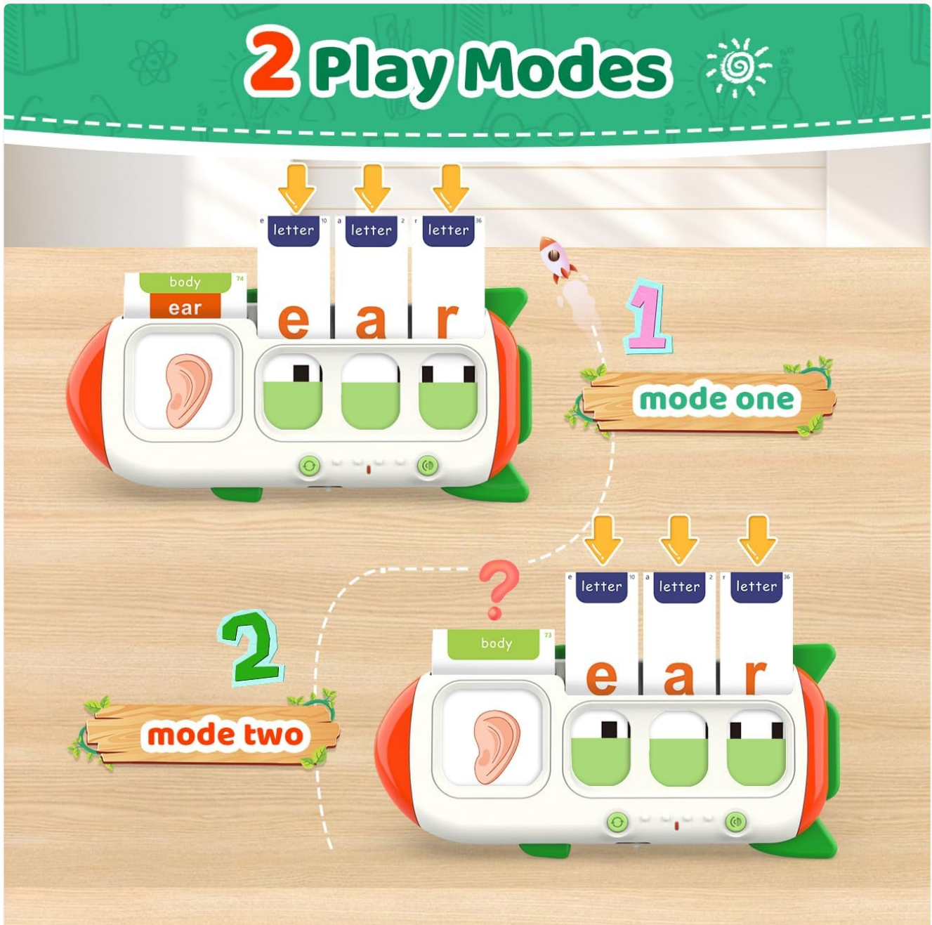
Image: A visual guide demonstrating the two interactive playing modes of the device.

The other side of the word cards features only a picture. Insert this side into the card reader to practice word recognition and recall without immediate spelling prompts.