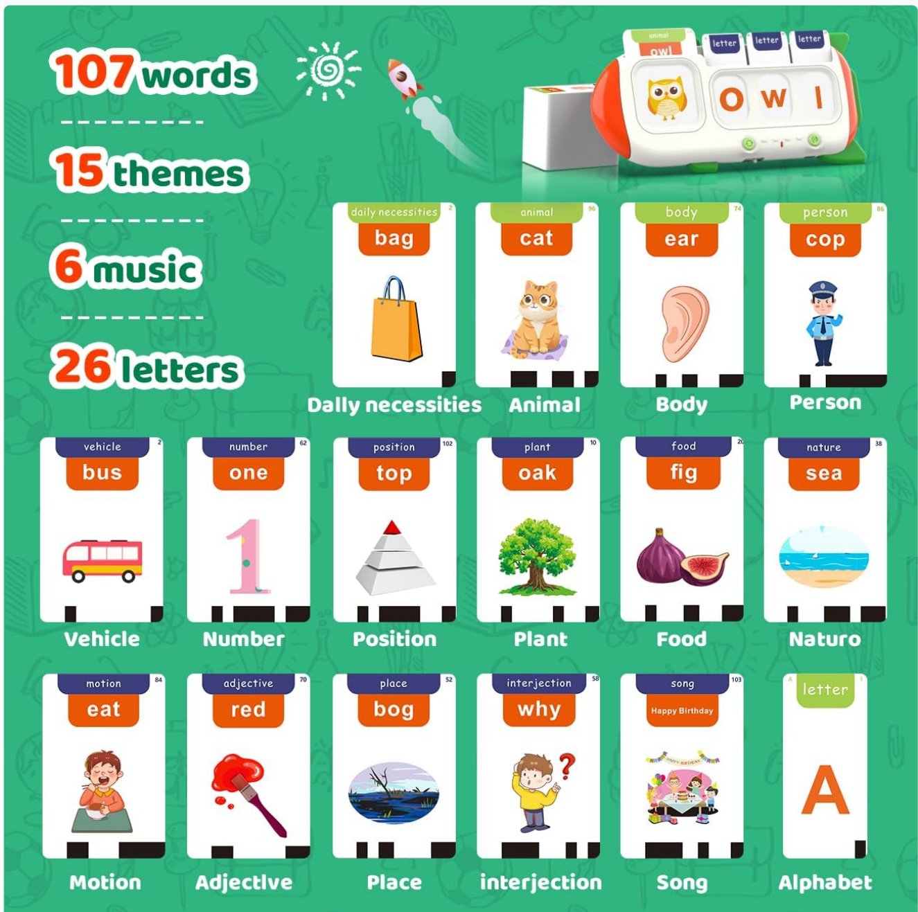
Image: An overview of the diverse range of 107 word cards across 15 themes, including 6 music cards and 26 letter cards.