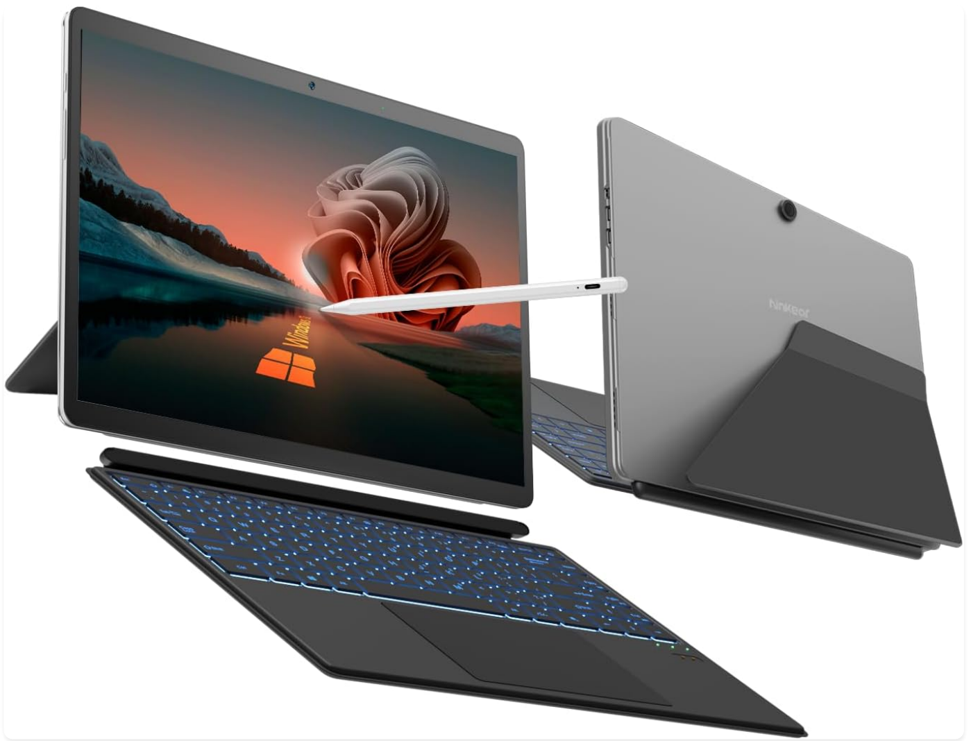
Figure 1: Ninkear T40 2-in-1 Laptop Tablet with detachable keyboard and stylus.