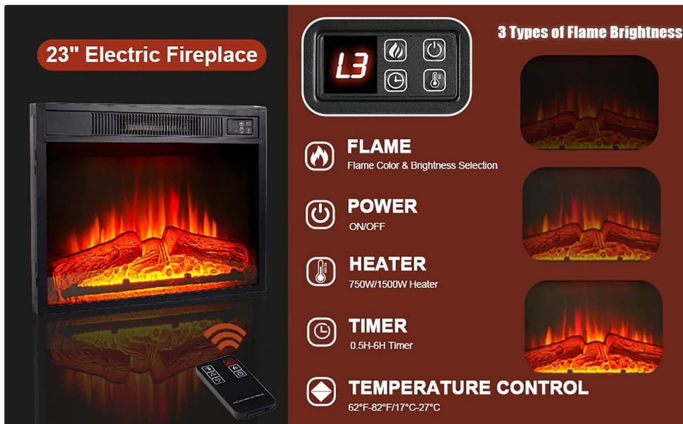
Figure 4: Control panel and remote functions for the electric fireplace insert.