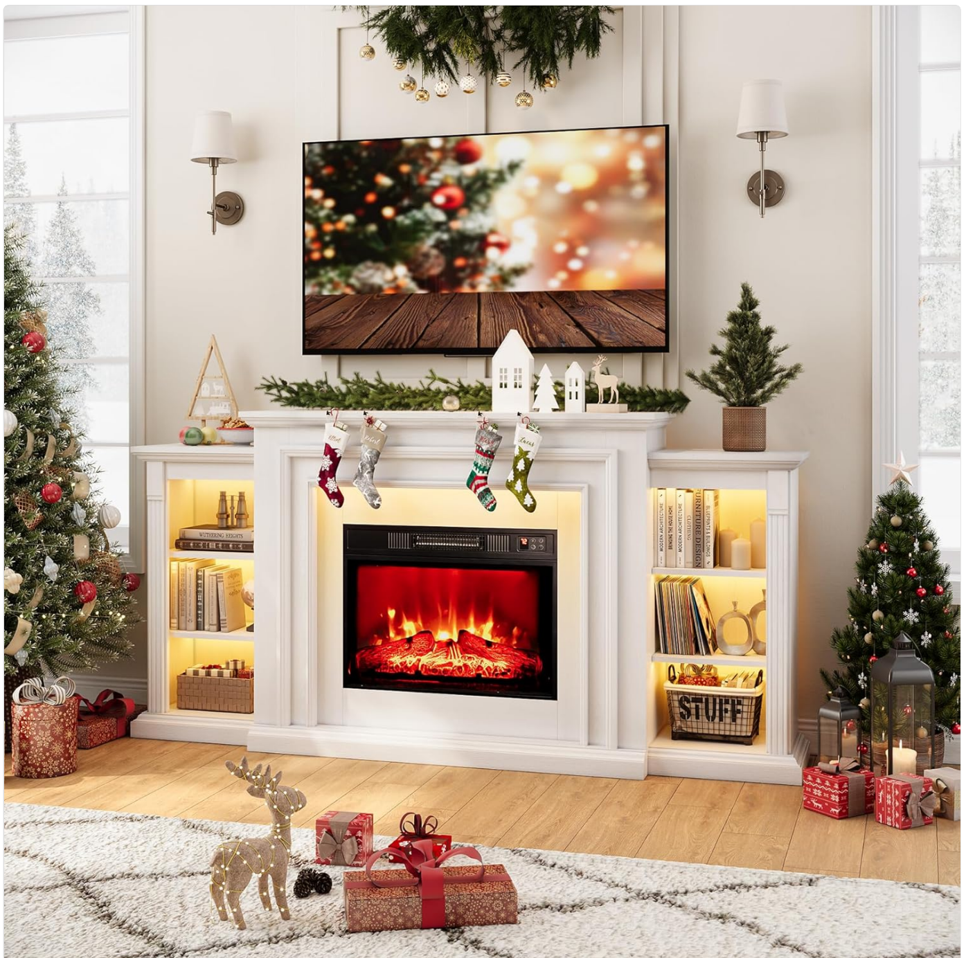
Figure 1: The BOSHIRO 72" Electric Fireplace with Mantel, showcasing its design and integration into a living room.