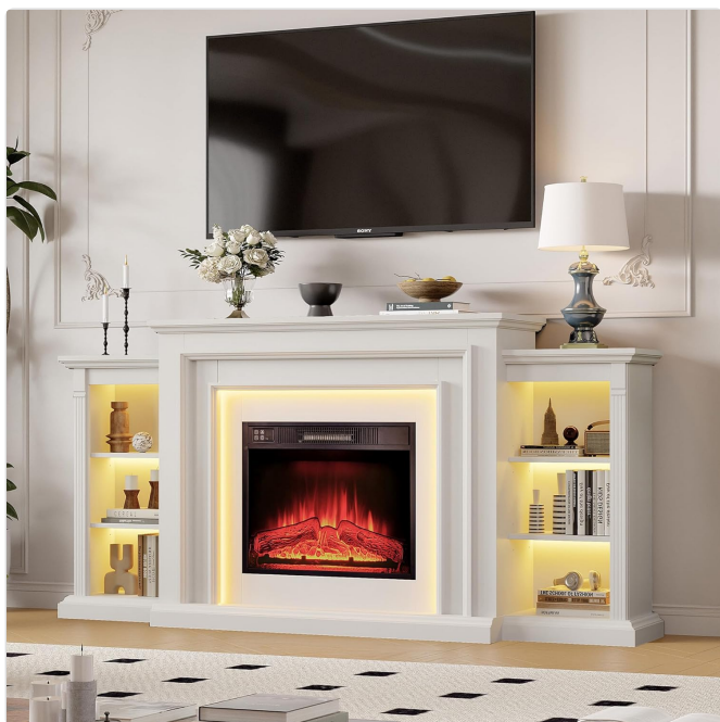
Figure 6: Unit with warm yellow LED lighting.