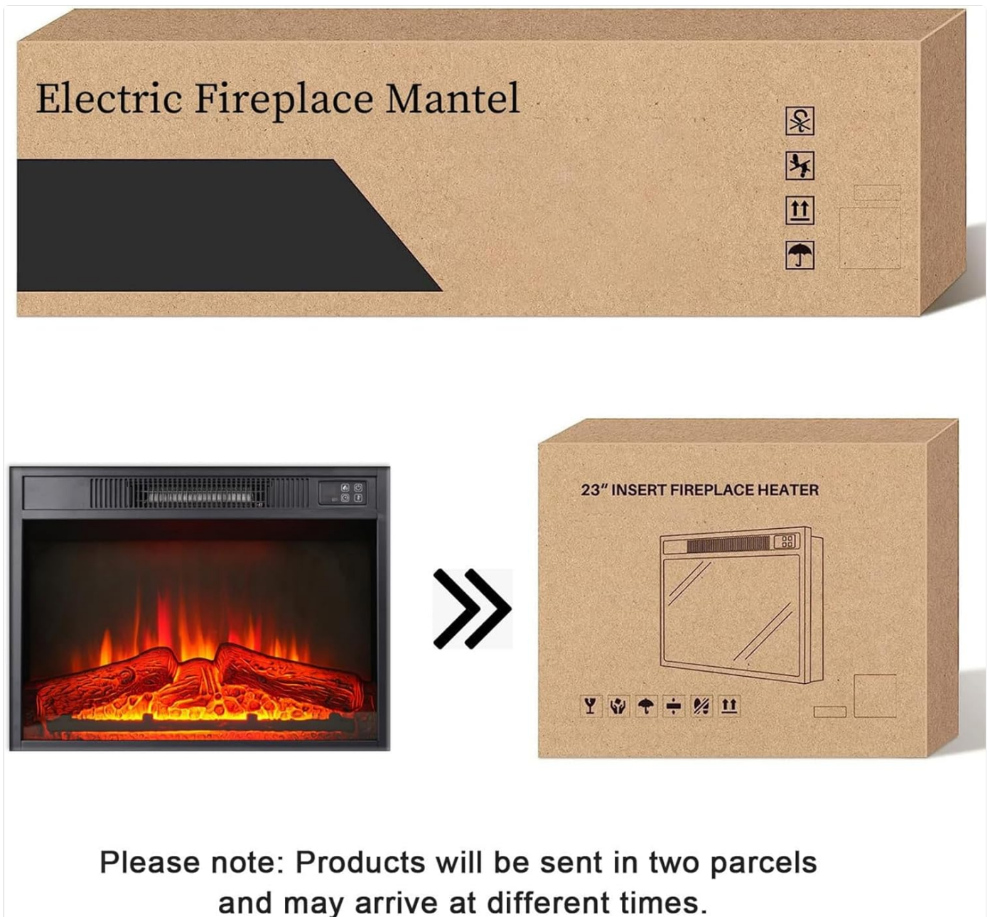
Figure 2: The product is delivered in two distinct packages.