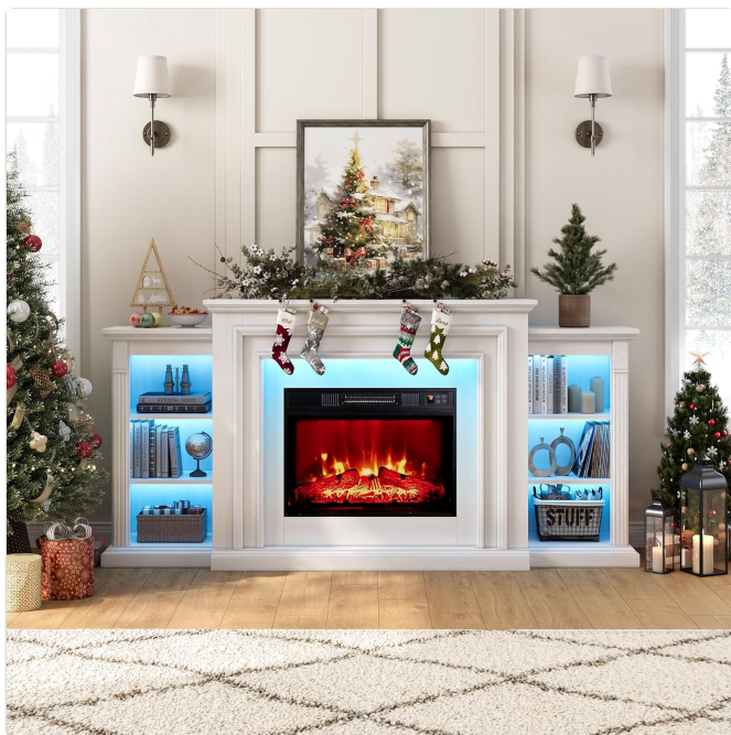
Figure 5: Unit with blue LED lighting.