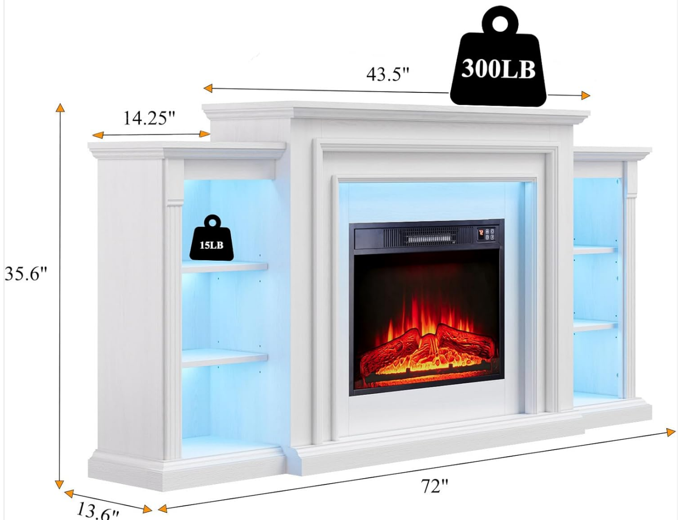
Figure 3: Key dimensions and weight capacities of the assembled unit.