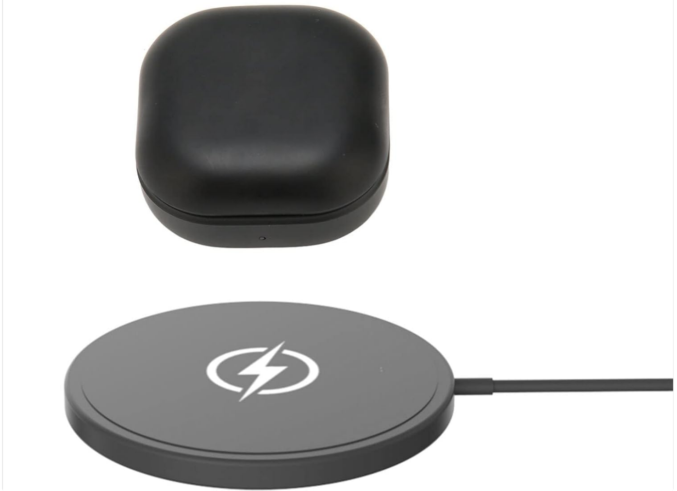
Image: The Earbuds Charging Case positioned above a circular Qi wireless charging pad, illustrating its support for wireless charging.