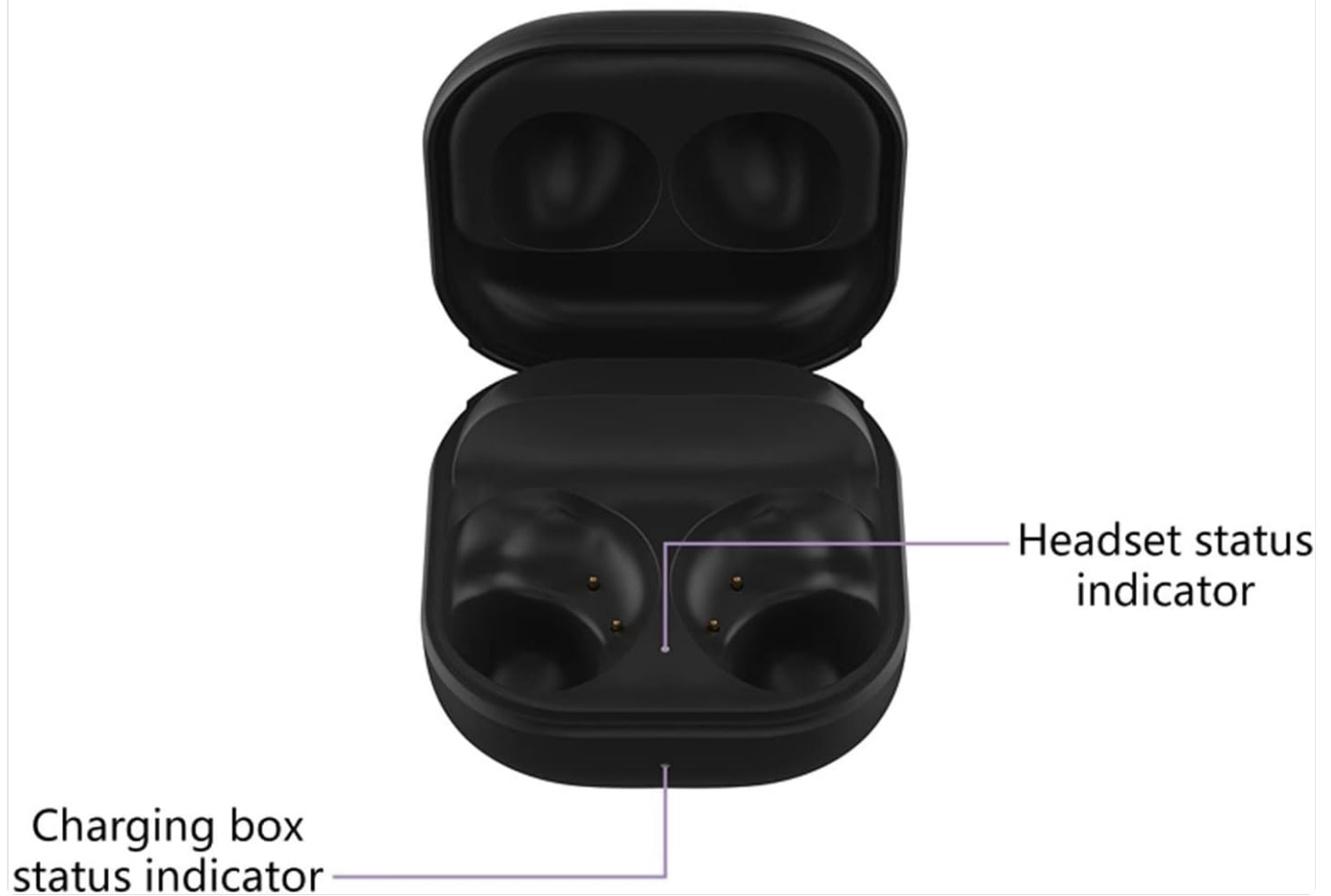
Image: An open Earbuds Charging Case highlighting the locations of the headset status indicator (inside the earbud slots) and the charging box status indicator (on the front edge of the case).