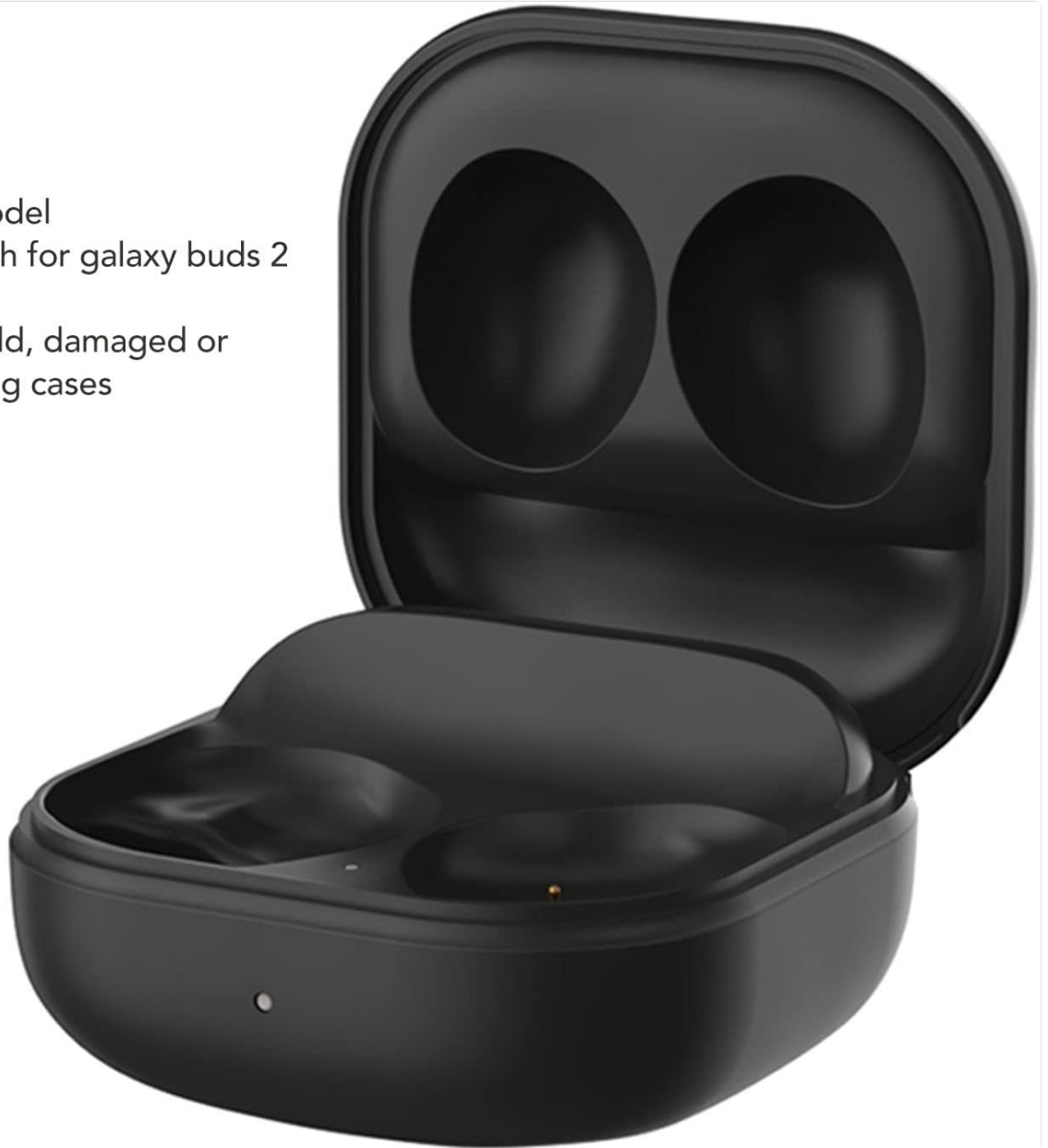
Image: The open Earbuds Charging Case, showing the two compartments for earbuds and the internal charging contacts. This case is compatible with Buds 2 earphones.

Compatible Model Compatible with for galaxy buds 2 earphones For replacing old, damaged or missing charging cases