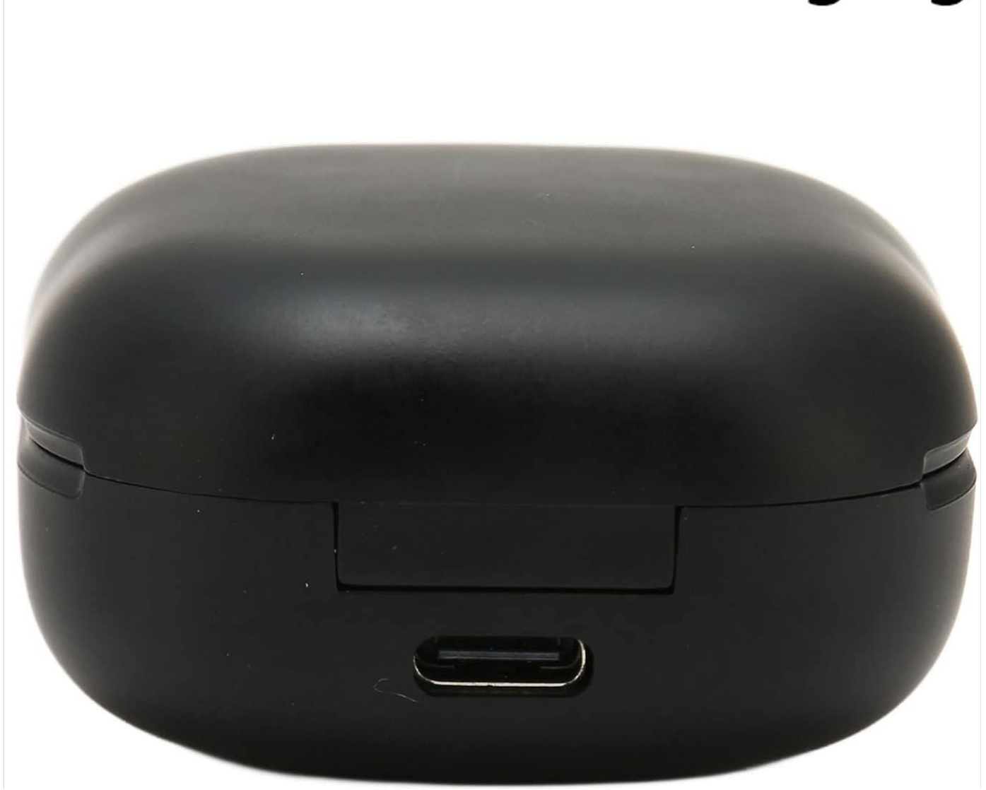
Image: A close-up view of the Earbuds Charging Case showing the USB-C universal charging port located at the front bottom edge.