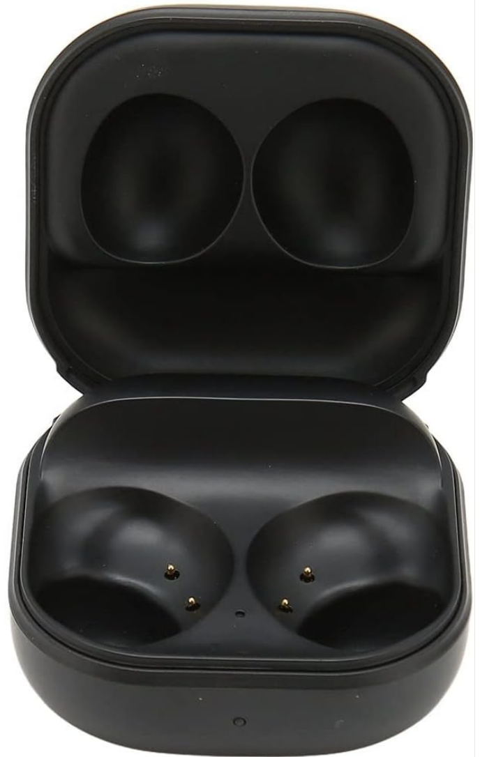
Image: An open Earbuds Charging Case with text indicating "Pairing Support" and "Features wireless pairing sync button and quick appear pairing mode. Pair your earbuds with your phone." Also mentions "Built in 700mAh Battery. Charges the earphones about 3 to 5 times."