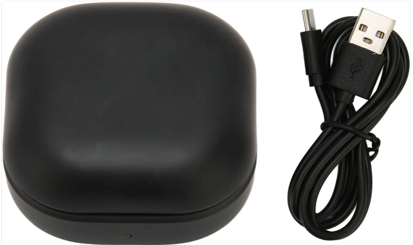
Image: The Earbuds Charging Case (black, compact) shown alongside its included Type C charging cable.

This manual provides detailed instructions for the use and maintenance of your new Earbuds Charging Case. Please read this manual thoroughly before using the product to ensure proper operation and longevity.