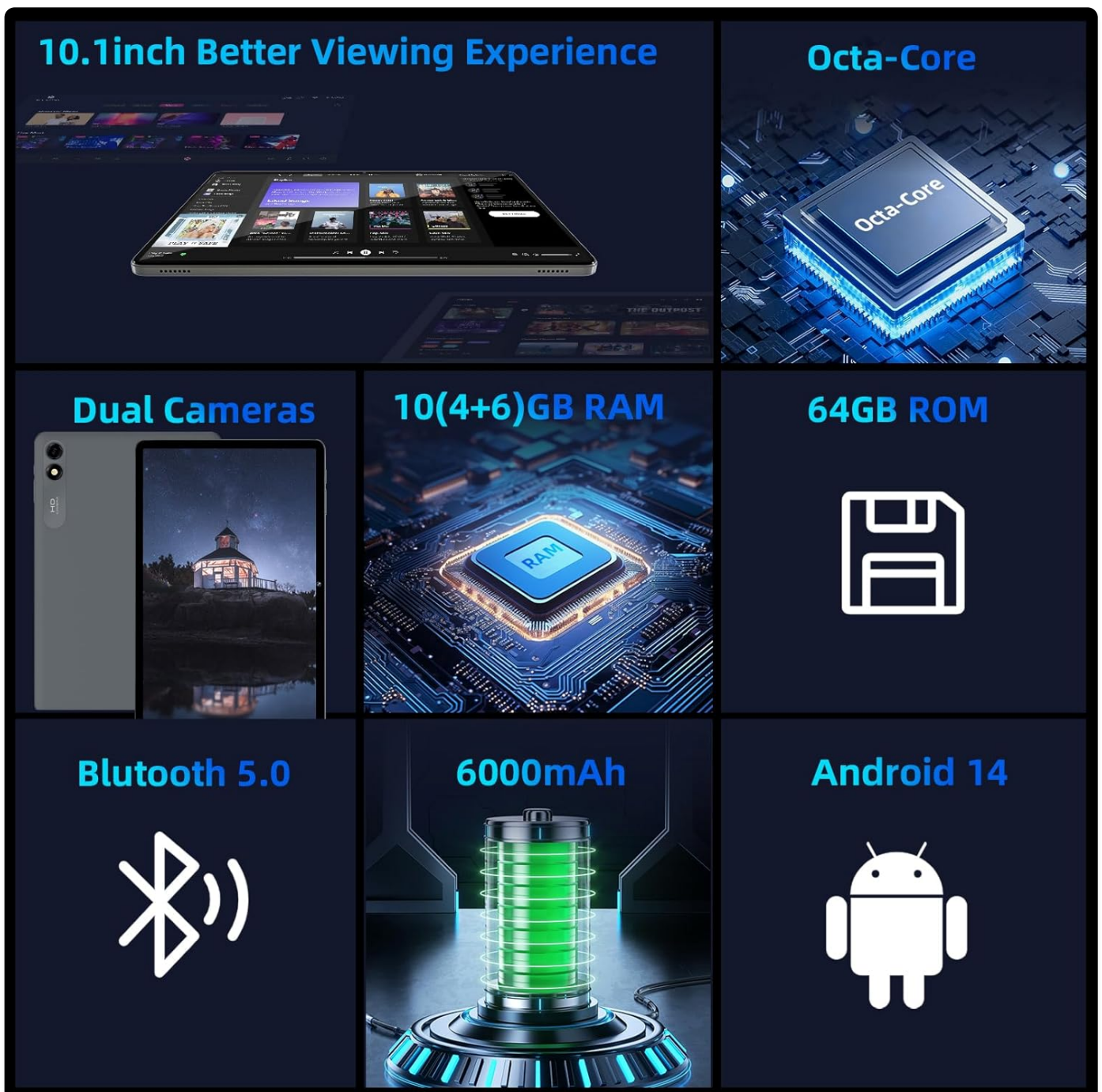
Image 3.1: Visual representation of the tablet's core specifications and features.