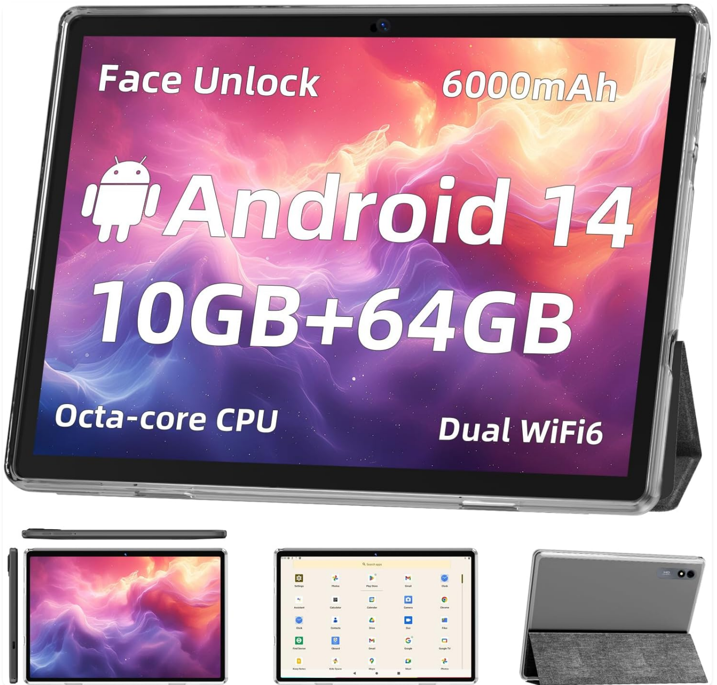
Image 1.1: The TUOHAITIME Android 14 Tablet, showcasing its sleek design and key features on the screen.