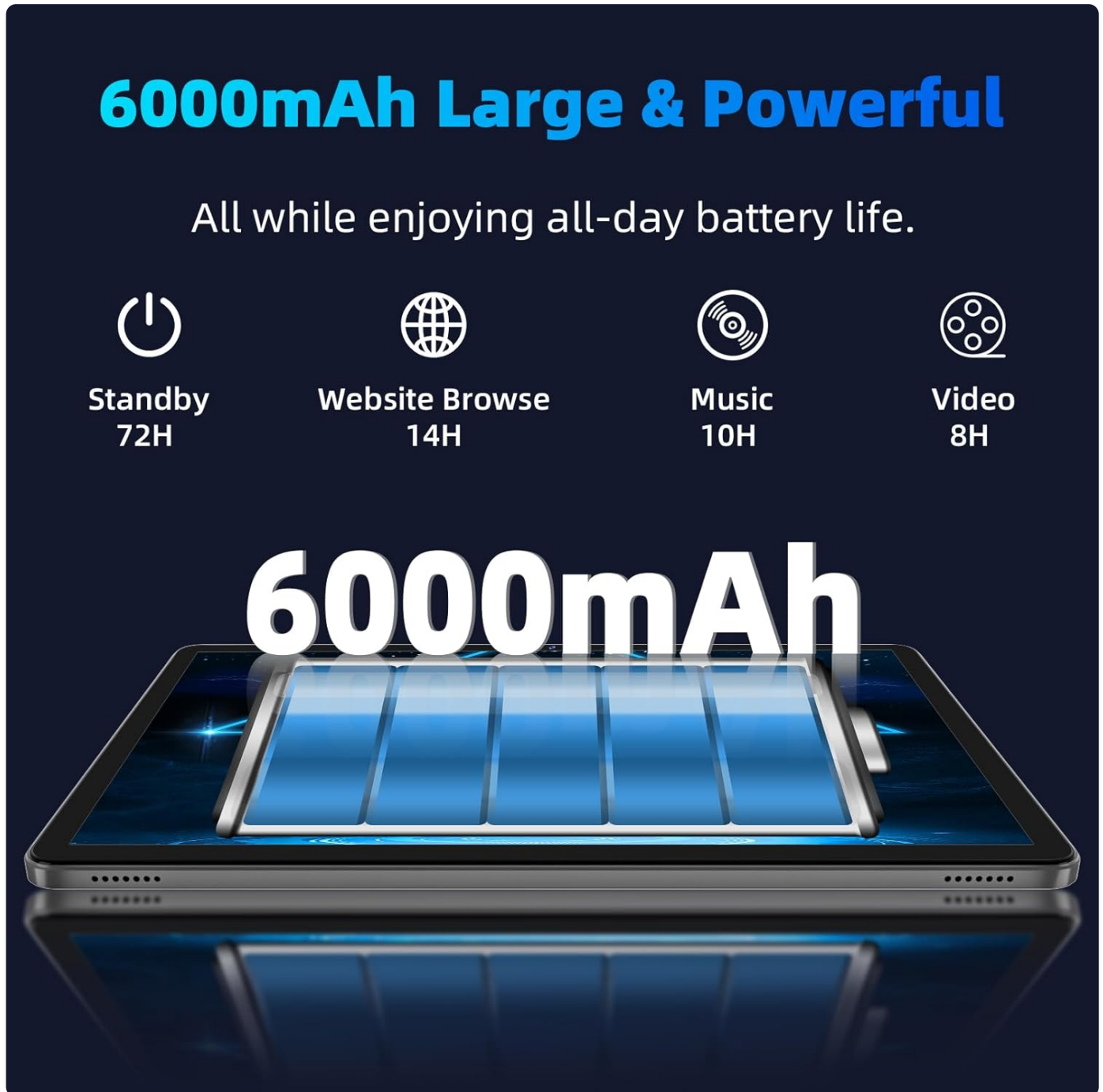
Image 6.1: Battery capacity and estimated usage times for the 6000mAh battery.