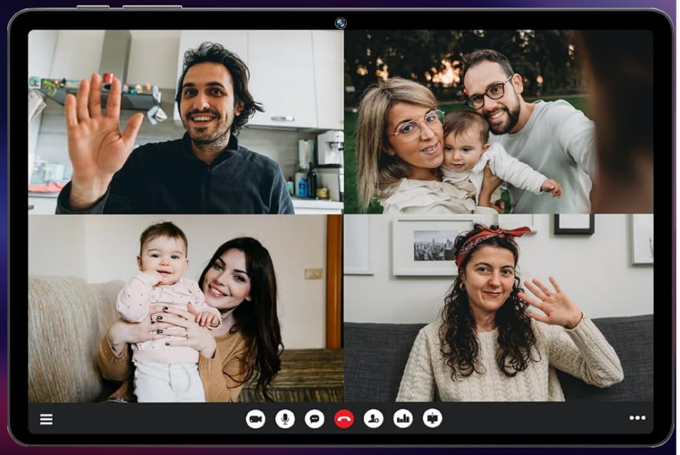
Image 5.1: Android 14 interface demonstrating features like parallel view and parental controls.