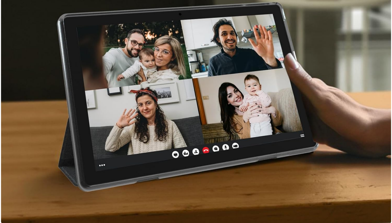
Image: The tablet screen showing a video conference with multiple participants, demonstrating the use of the front camera for communication.