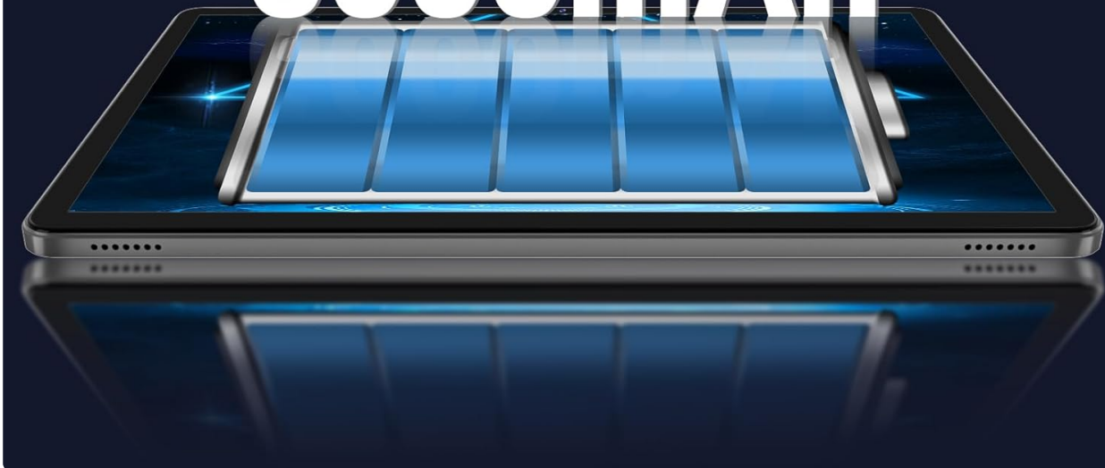
Image: A graphic illustrating the 6000mAh battery capacity and estimated usage times: 72 hours standby, 14 hours website browsing, 10 hours music, and 8 hours video playback.