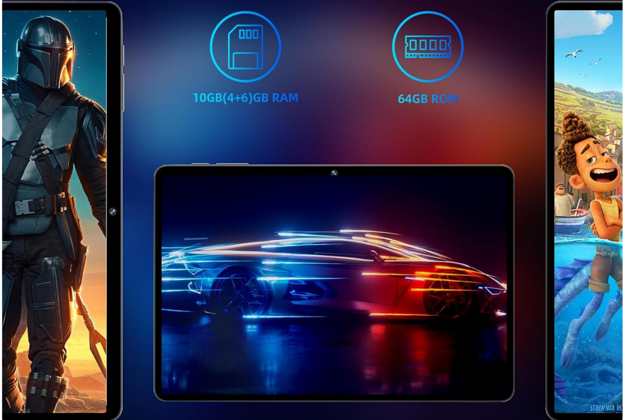
Image: A visual representation of the tablet's storage capabilities, indicating 10GB (4GB+6GB) RAM and 64GB ROM, with the option to expand memory up to 1TB via an SD card.

The tablet has 10GB(4GB+6GB) RAM + 64GB ROM storage space and you can also add an SD card to expand the memory to 1TB The large storage space allows you to never worry about insufficient memory