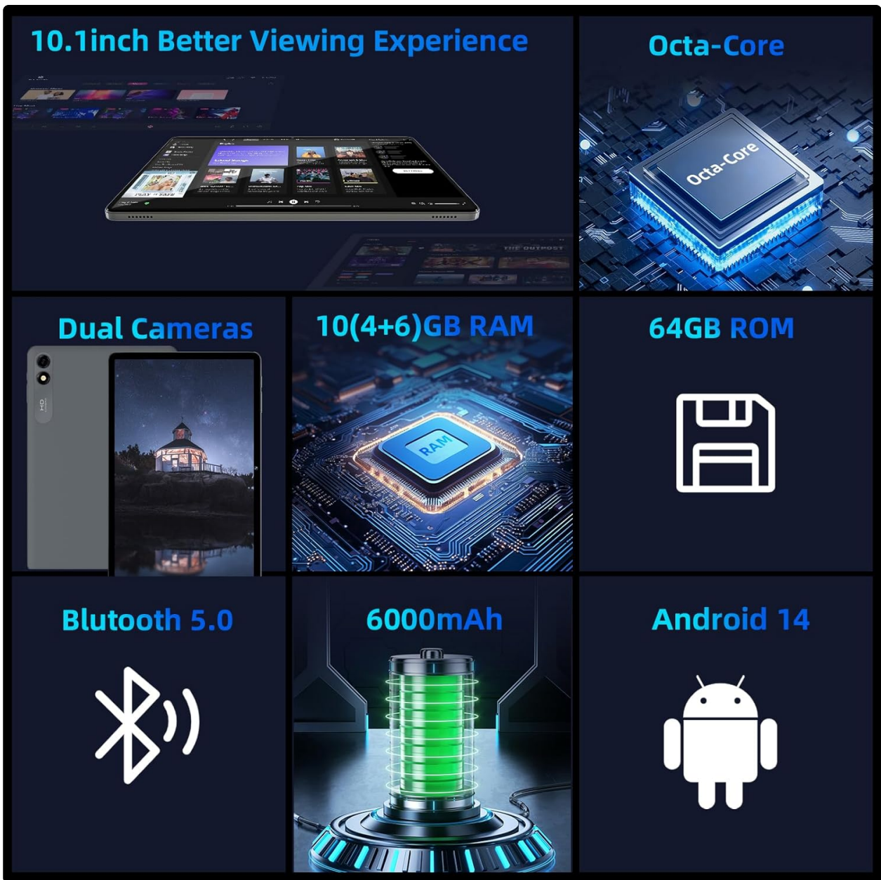
Image: An infographic showcasing key features including 10.1-inch display, Octa-Core processor, dual cameras, 10GB RAM, 64GB ROM, Bluetooth 5.0, 6000mAh battery, and Android 14.