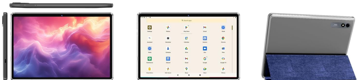
Image: The TUOHAITIME Android 14 Tablet displayed with its protective case and charging cable.