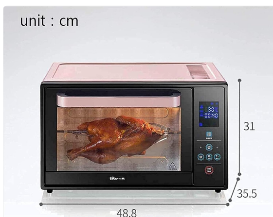
Figure 3.1: Oven dimensions. The oven measures 48.8 cm in width, 35.5 cm in depth, and 31 cm in height.