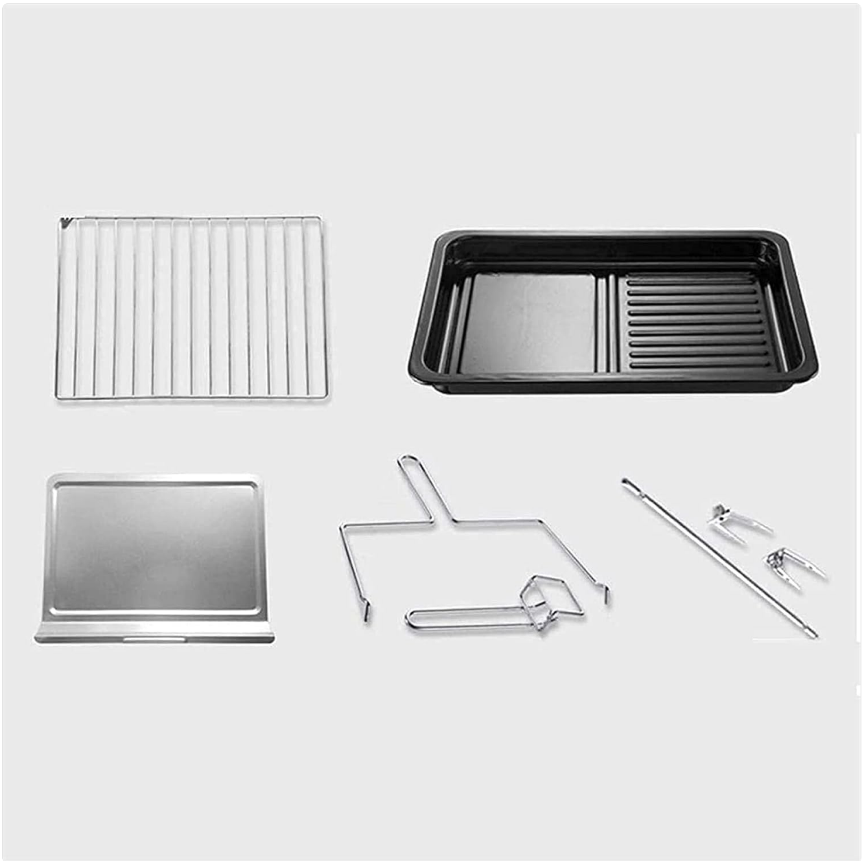
Figure 4.1: Included accessories. This image displays the baking rack, baking pan, crumb tray, rotisserie fork, and rotisserie handle that come with the oven.