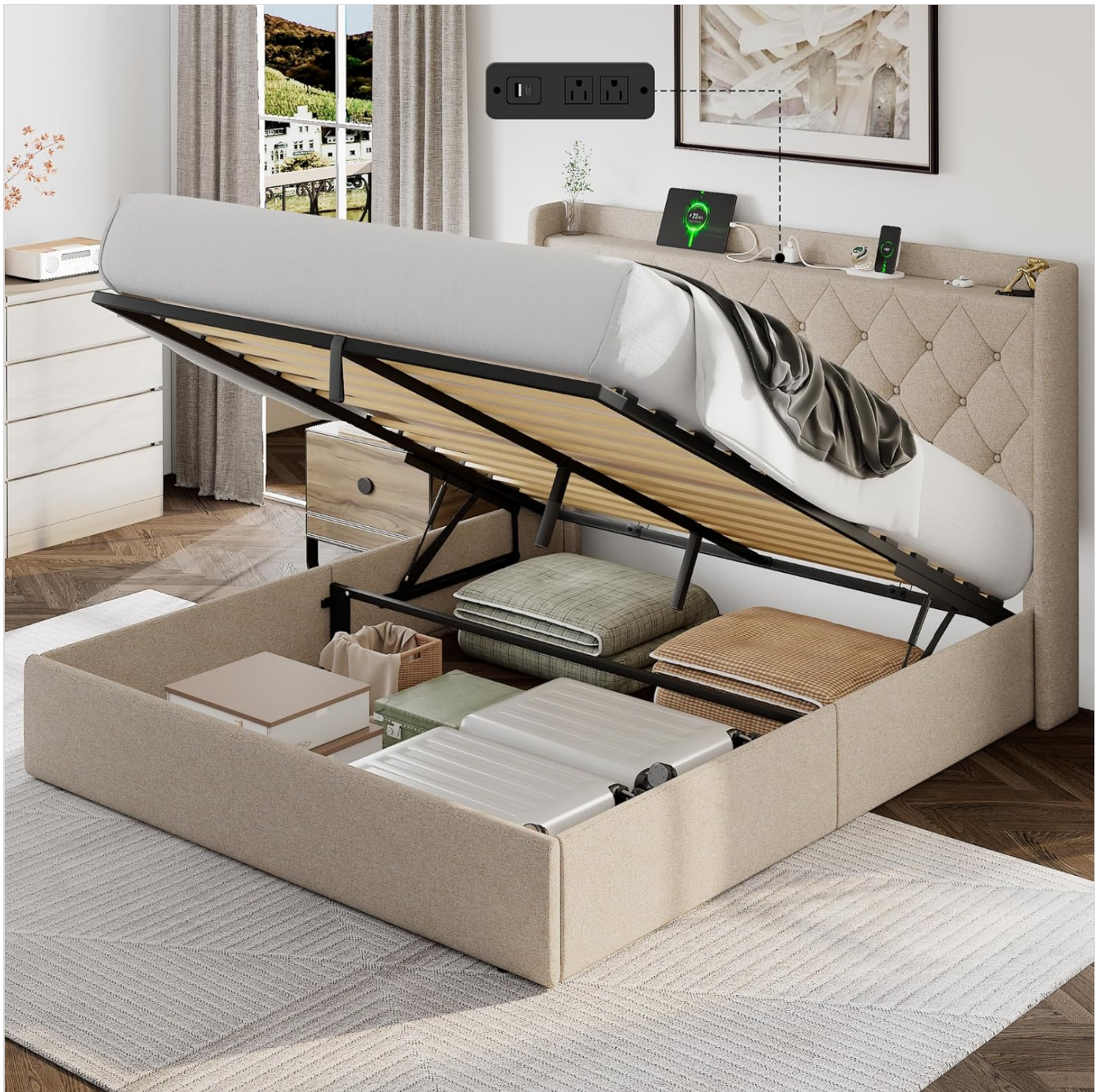
Image: The bed frame with its hydraulic lift system open, showcasing the 10.8-inch deep storage space.