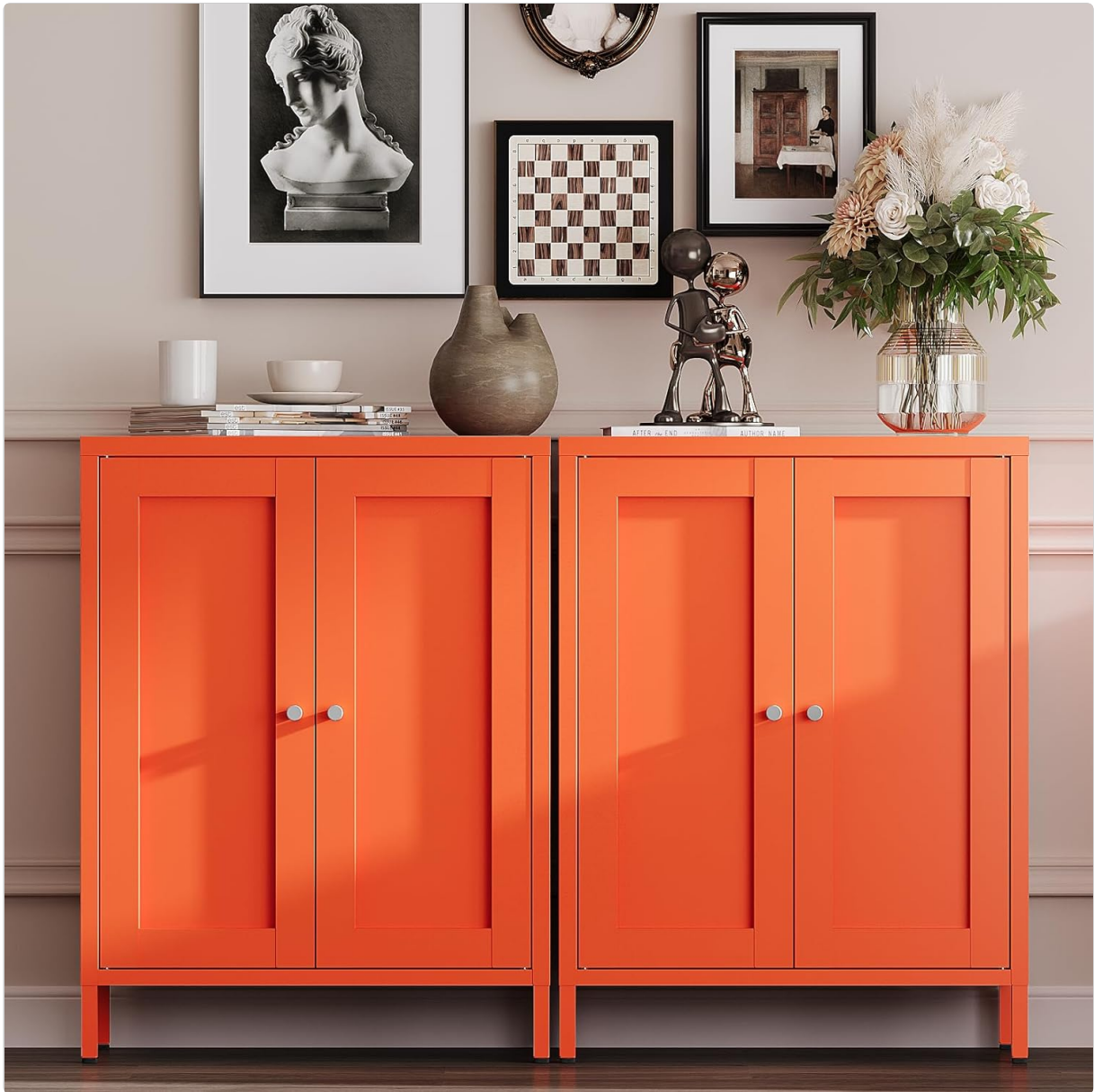
Image: The YAUWOH Metal Bathroom Storage Cabinet as part of a complete bathroom furniture set, highlighting its cohesive design.