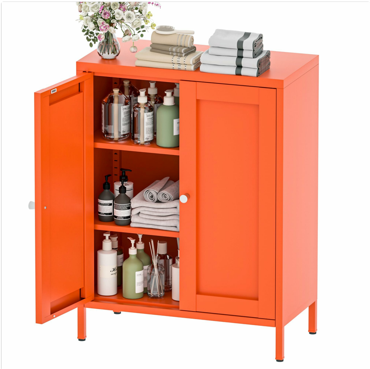
Image: The YAUWOH Metal Bathroom Storage Cabinet in orange, with its doors open, revealing stored items and adjustable shelves.