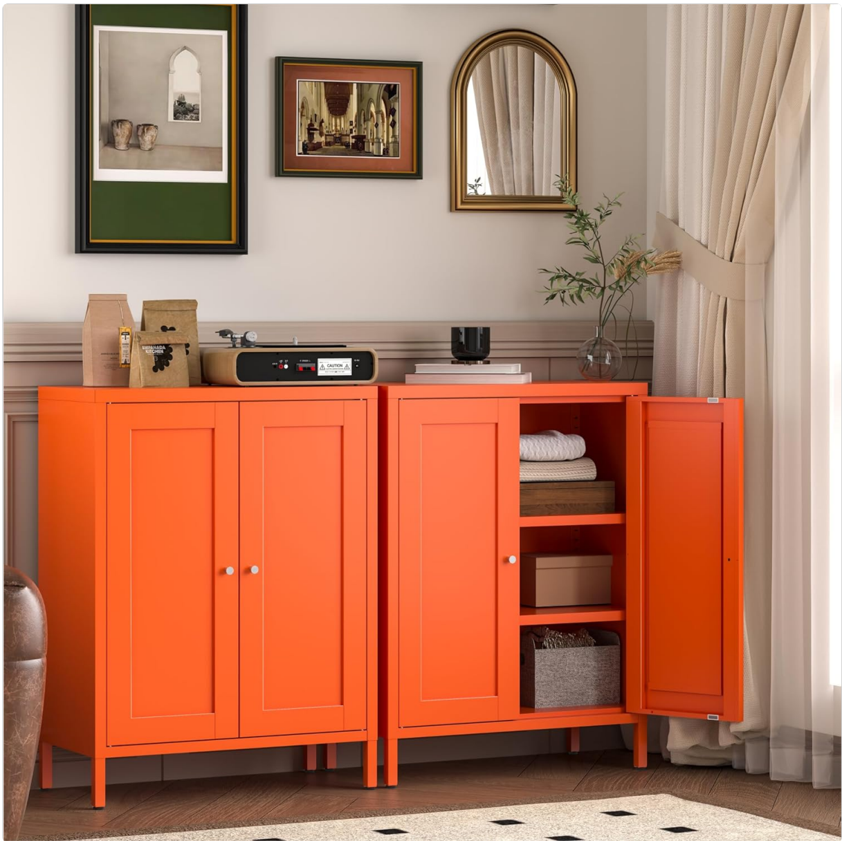
Image: A pair of orange metal storage cabinets presented together, illustrating how multiple units can complement a space.